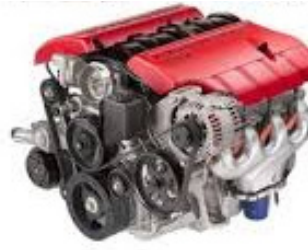
Internal Combustion Engine