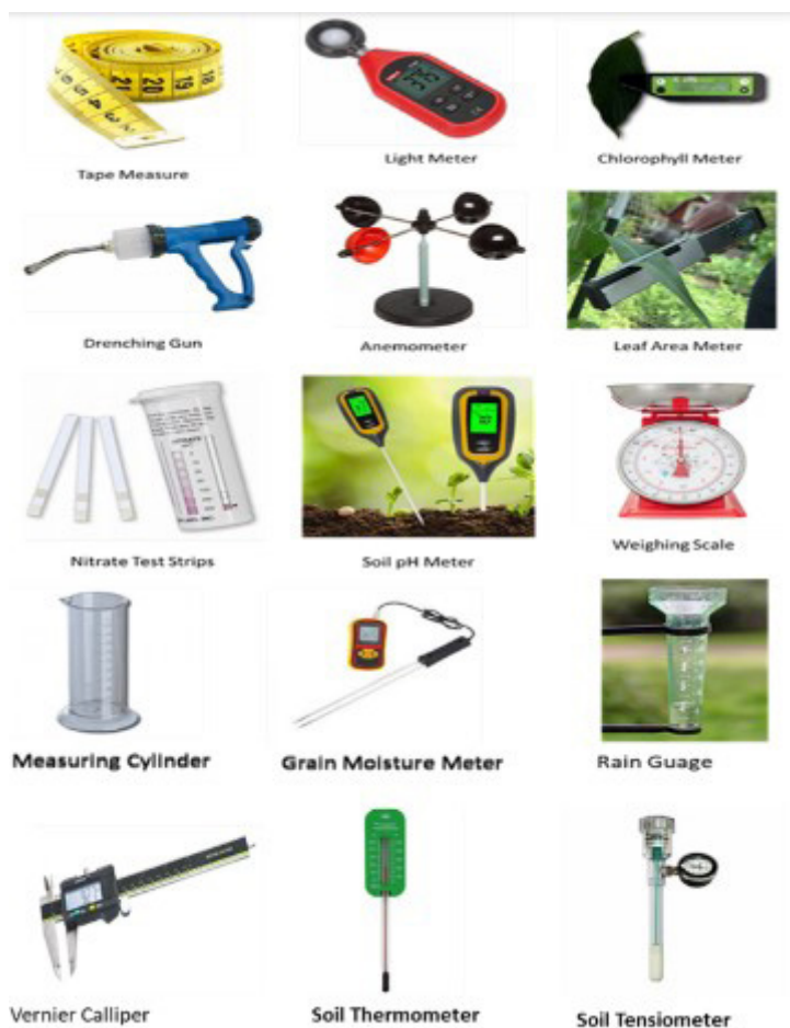
Figure 2.1 Examples of agricultural measuring tools

Nitrate test strips: They are used to measure or assess the nitrate levels in soil or plant tissues. Store in a cool dry place, follow manufacturer's instructions and keep away from contaminants.