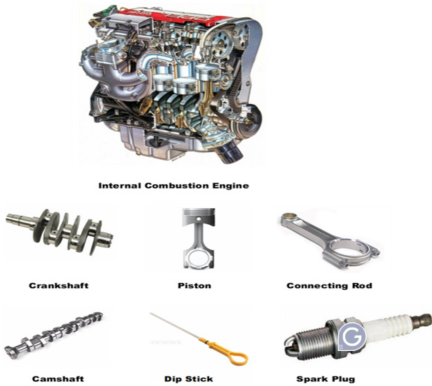
Fig 2.10 Typical petrol engine and some major parts