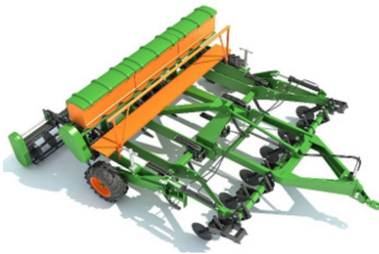
Fig 2.14 A seed harrow combined with a seed drill