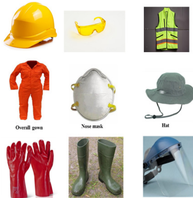
Fig 2.5 Some examples of PPE used in agriculture