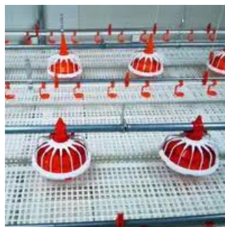
Automatic Water Trough