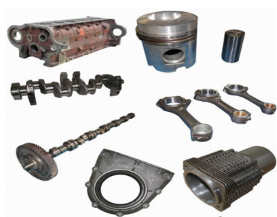
Fig 2.12 Major parts of a diesel engine