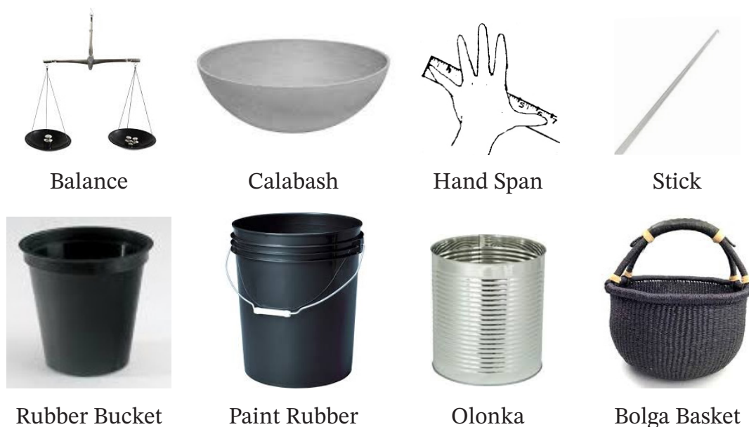
Fig 2.2 Types of indigenous Agricultural measuring tools Sack

Sack: A sack is a large bag made of strong cloth, paper, or plastic. It is commonly used to store and carry large amounts of produce. Most farmers use sacks to measure grains such as maize, cowpea, millet, and sometimes, tubers and vegetables.