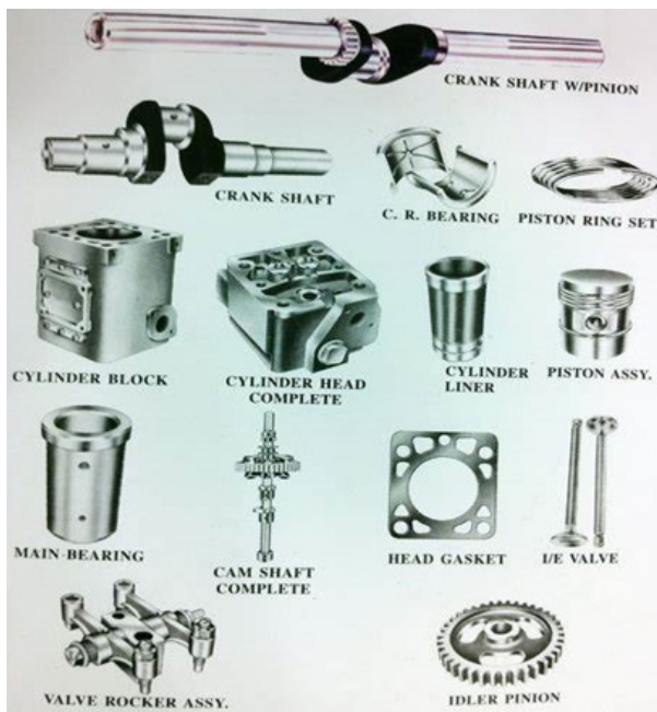
Fig 2.11 Major parts of a diesel engine