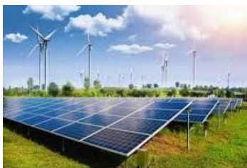
A tractor with a PTO