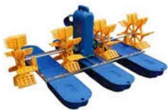
Fish Pond Aerator