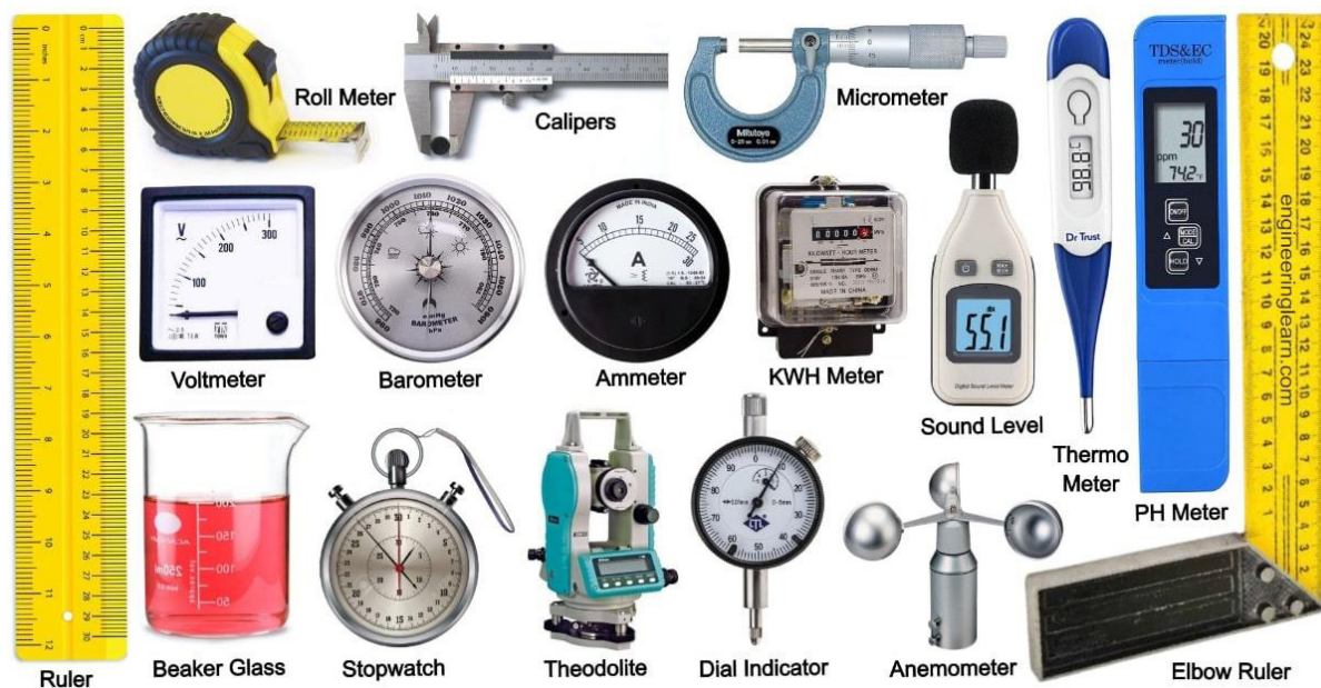
Fig 2.3 Examples of instruments for measuring standard units