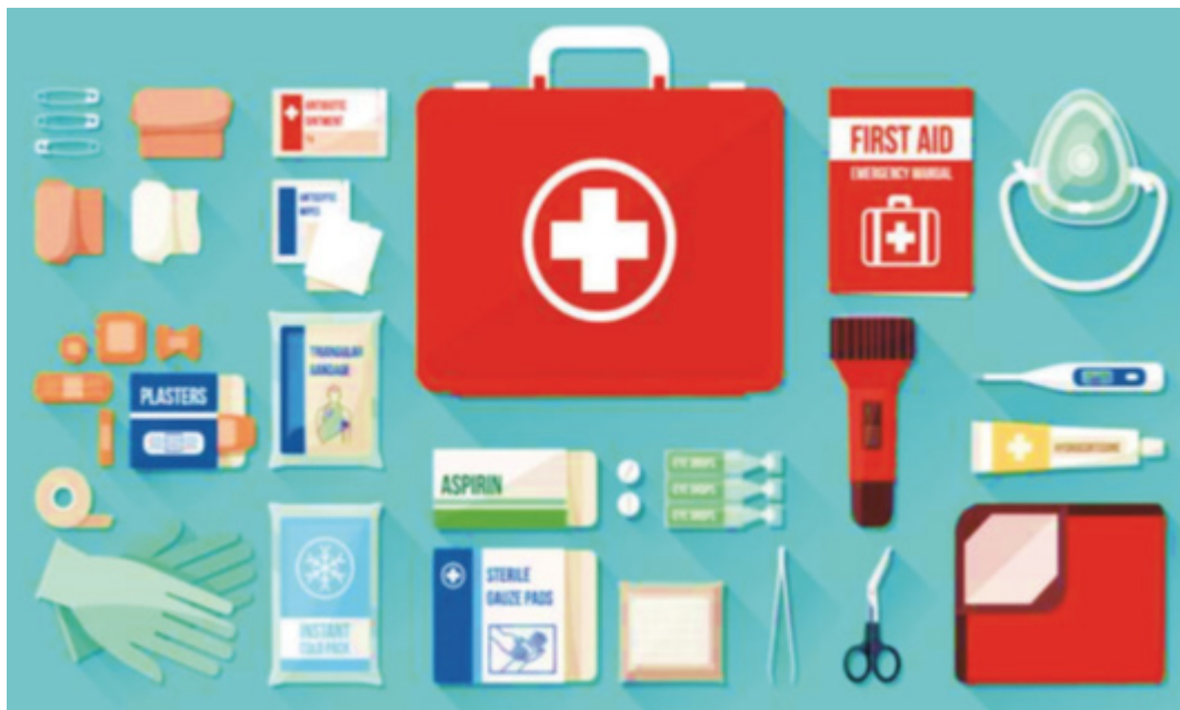
Fig 2.6 Some items found in a first aid box