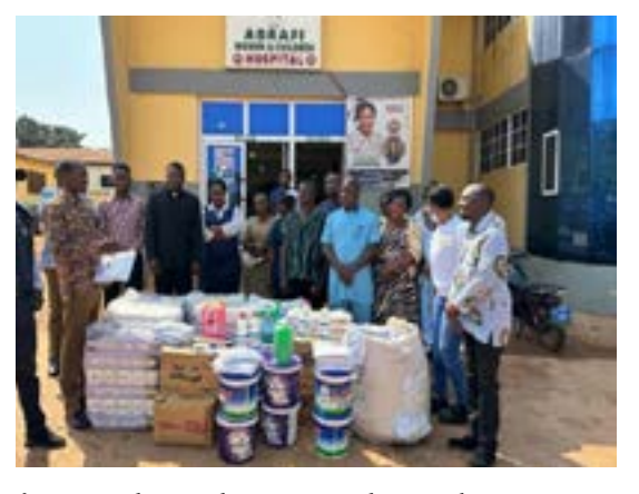
Fig. 3.2: Ghana Shippers Authority donating items to a hospital