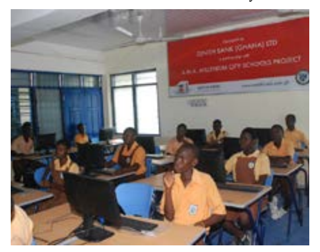
Fig. 3.3: Zenith Bank (GH) Ltd. equips computer labs for schools in Accra Metropolitan Area