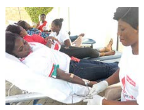
Fig.3.1: Graphic Communication Group offering free medical care to a community

Examples of corporate social responsibility in action: