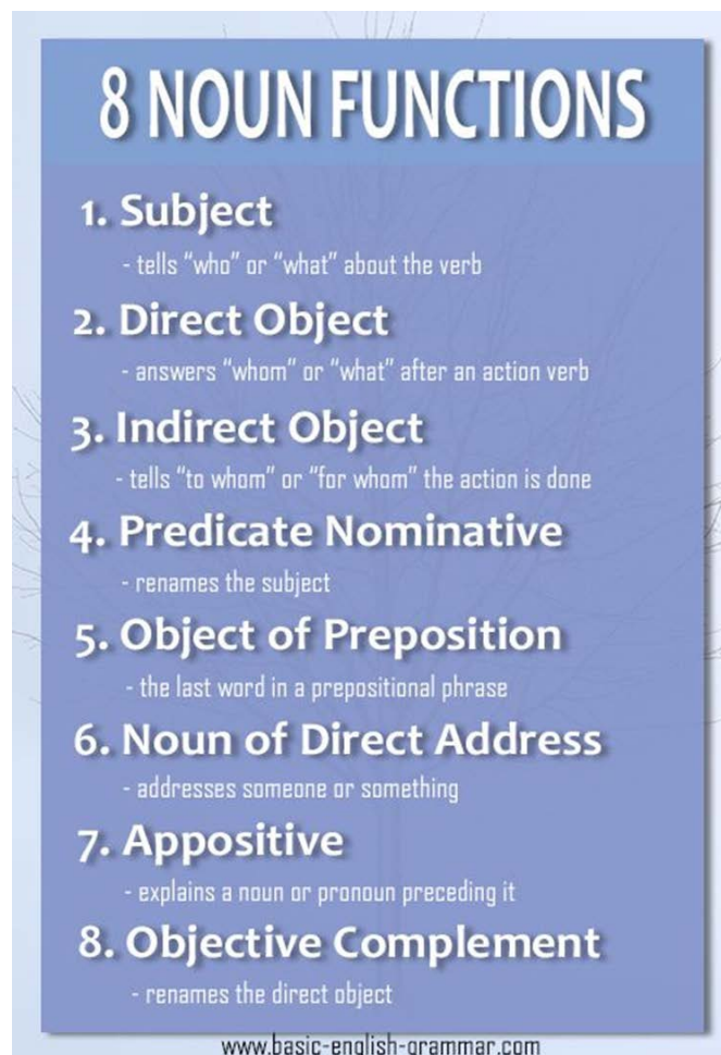
Fig 2.1 Functions of nouns

In a sentence, nouns can play crucial roles as subjects, direct objects, indirect objects, subject complements, object complements, objects of the preposition, and appositives.