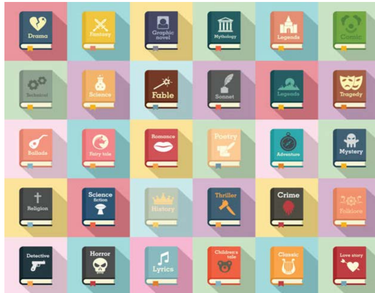
Fig 2.4 Genres of Literature