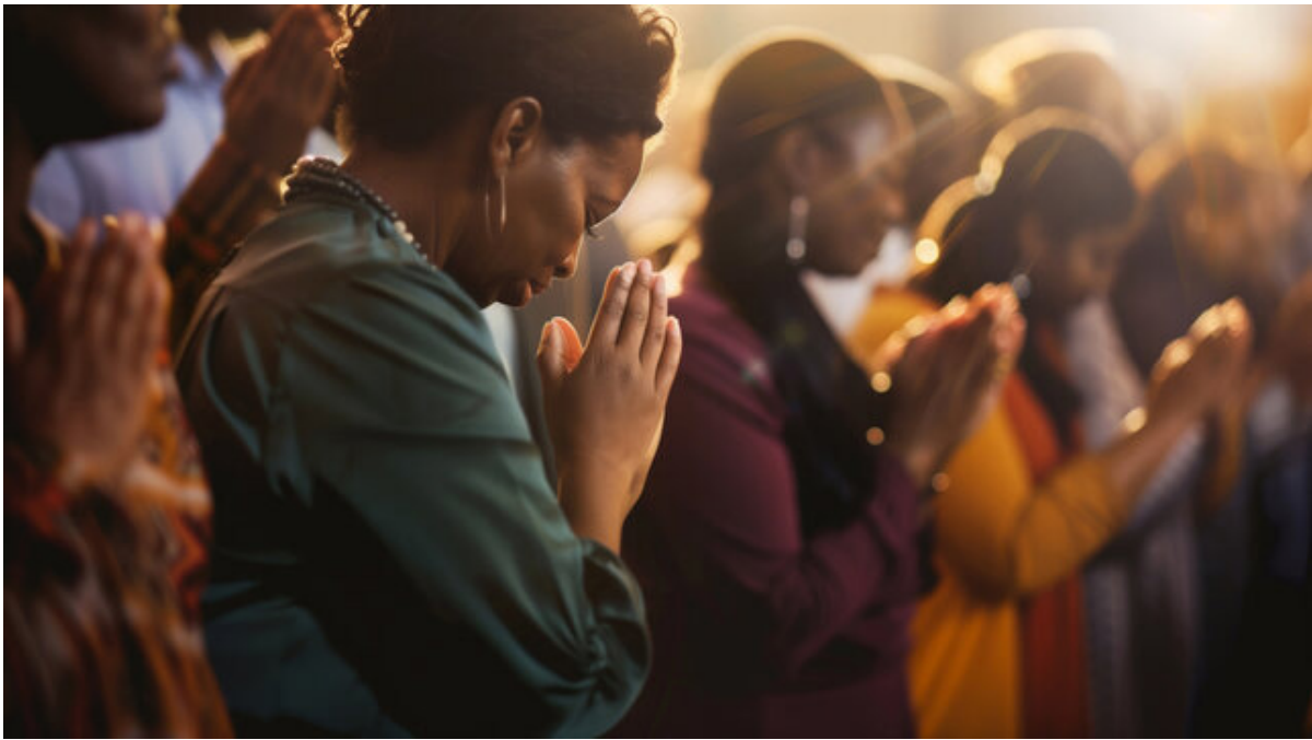
Fig. 1.4: People praying