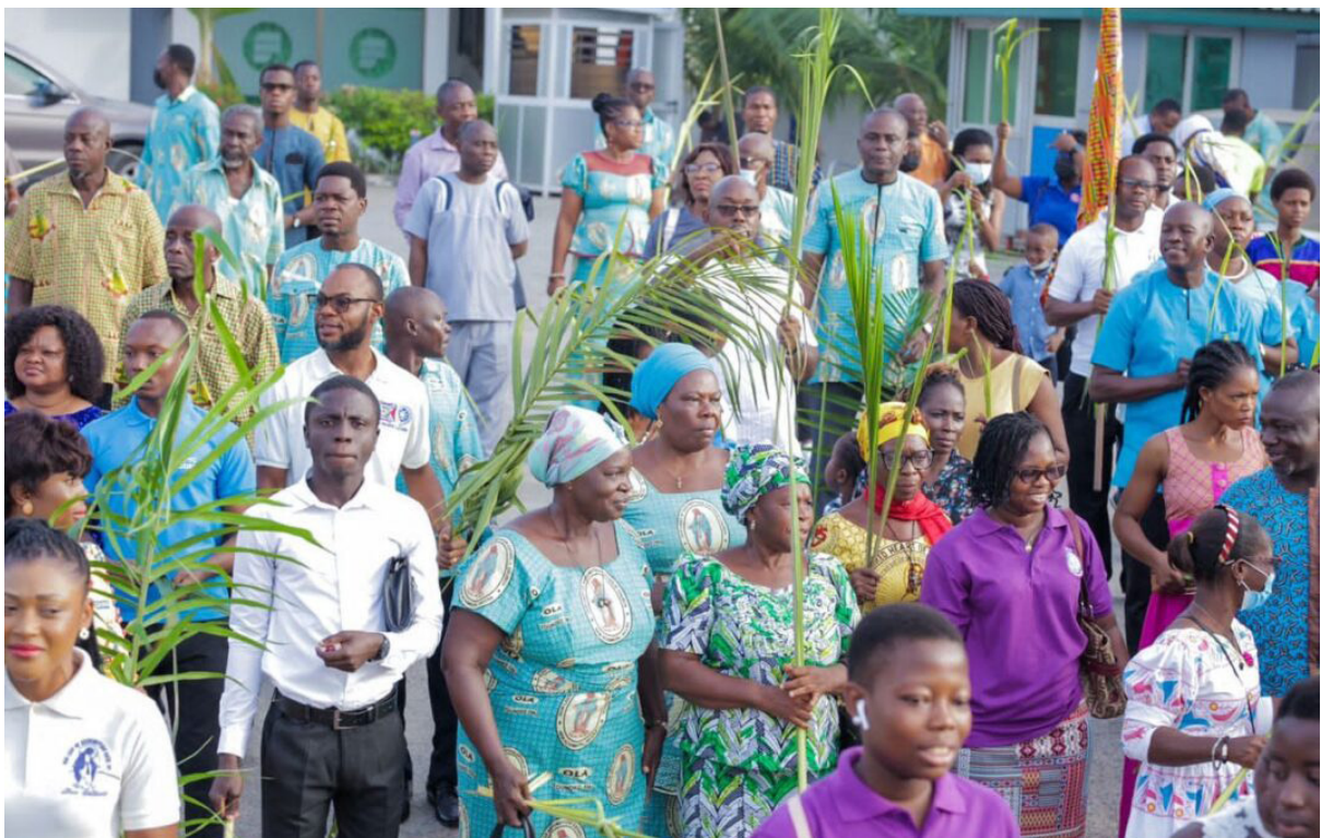
Fig. 1.2: A group of Christians engaging in a religious activity