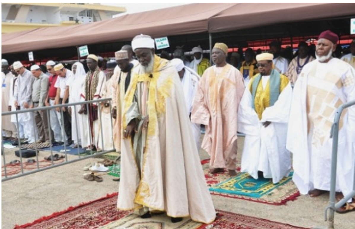
Fig. 1.3: Muslims mark Eid-ul-Adha