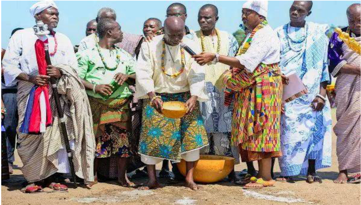
Fig. 1.1: The pouring libation