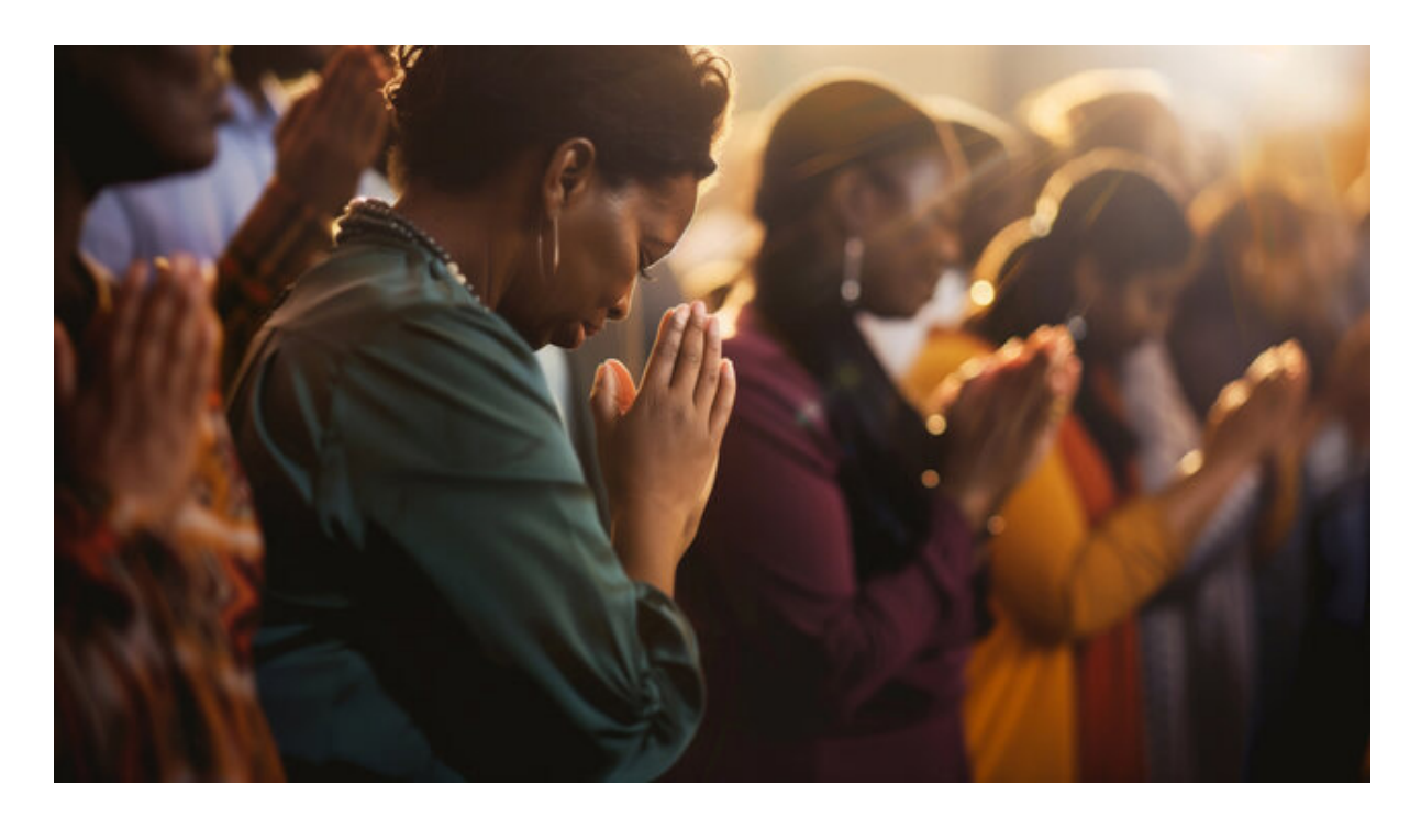
Fig. 1.4: People praying