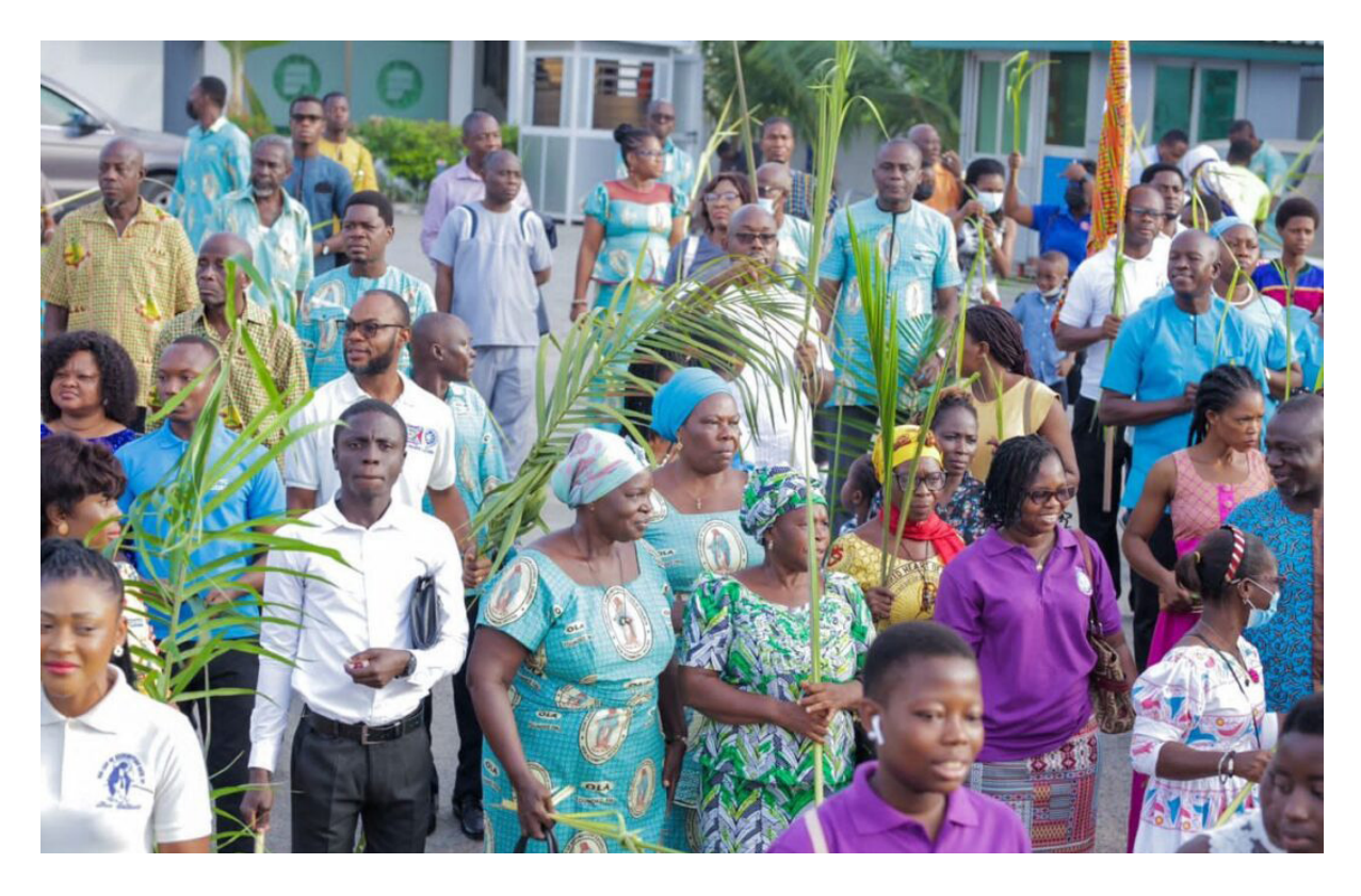
Fig. 1.2: A group of Christians engaging in a religious activity