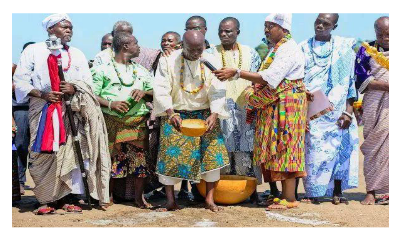
Fig. 1.1: The pouring libation