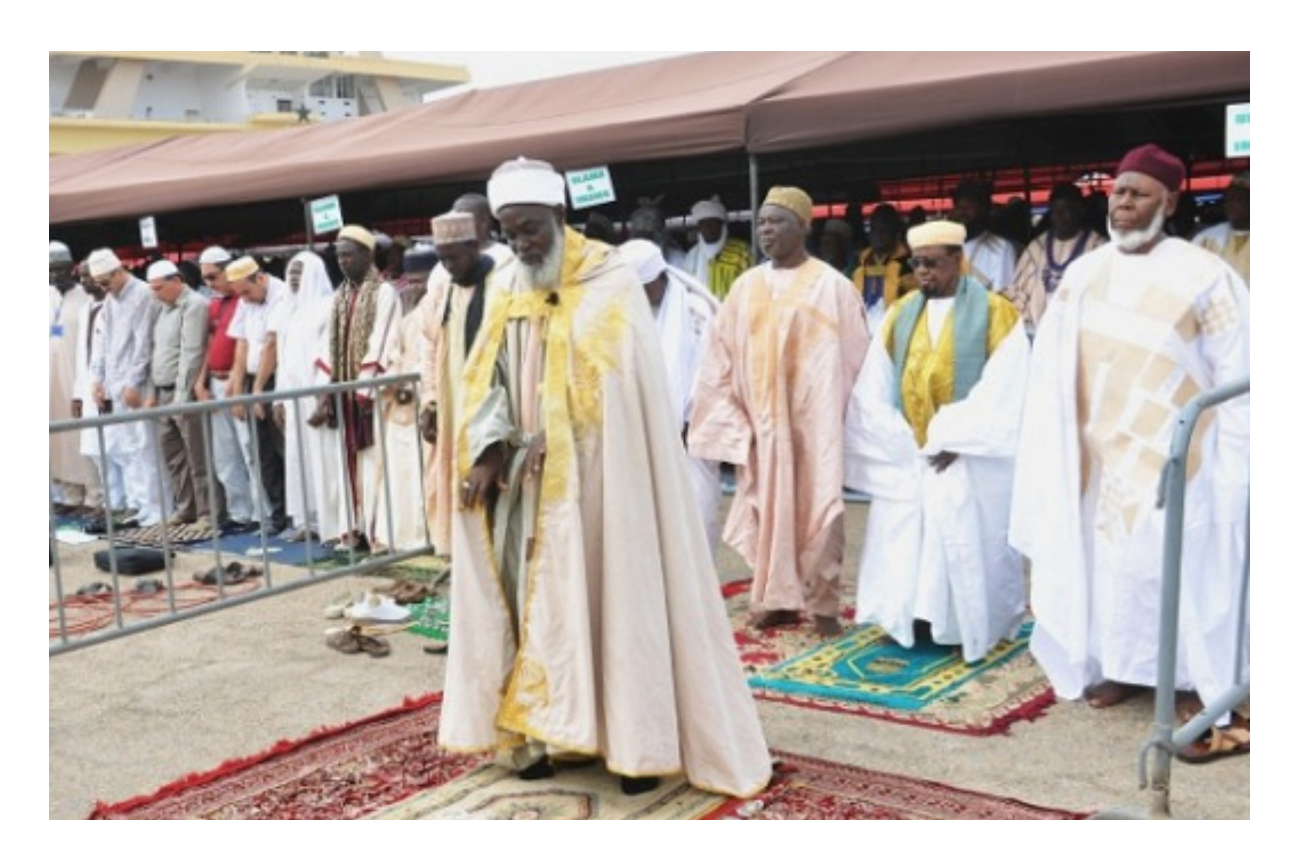
Fig. 1.3: Muslims mark Eid-ul-Adha

2. Non-Religious Activities : They are actions that both religious and nonreligious people perform that are not linked to any religious creed, code, or cult. Unlike religious activities, these are seen as ordinary or non-sacred. For instance, humanism, political activities, support for football teams, and school durbars are examples of non-religious activities.