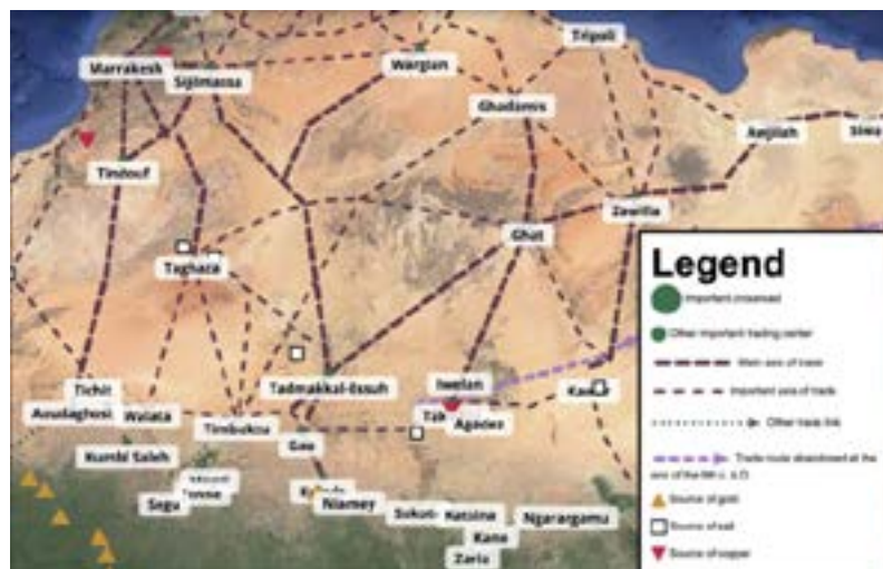
Fig. 5.2. An ancient African Map showing trade routes of the Trans-Saharan Trade.

Long ago, people in Africa traded with each other and with people from far away. They used trade routes across deserts and seas. In Africa, there was a big trade route called the Trans-Saharan Trade. People travelled with camels and donkeys carrying goods like salt, cloth, and even books! They exchanged these for gold, cotton, and other things. North Africans traded with people outside Africa too. Egyptians sailed across the sea to places like Lebanon, Syria, and India. They brought back copper, stones, and olive oil. They also traded with places in East Africa for things like ivory and shells. In return, East Africans got spices, silk, and metals from places like China and India. Trade was important because it helped people get things they needed and share their culture with others.