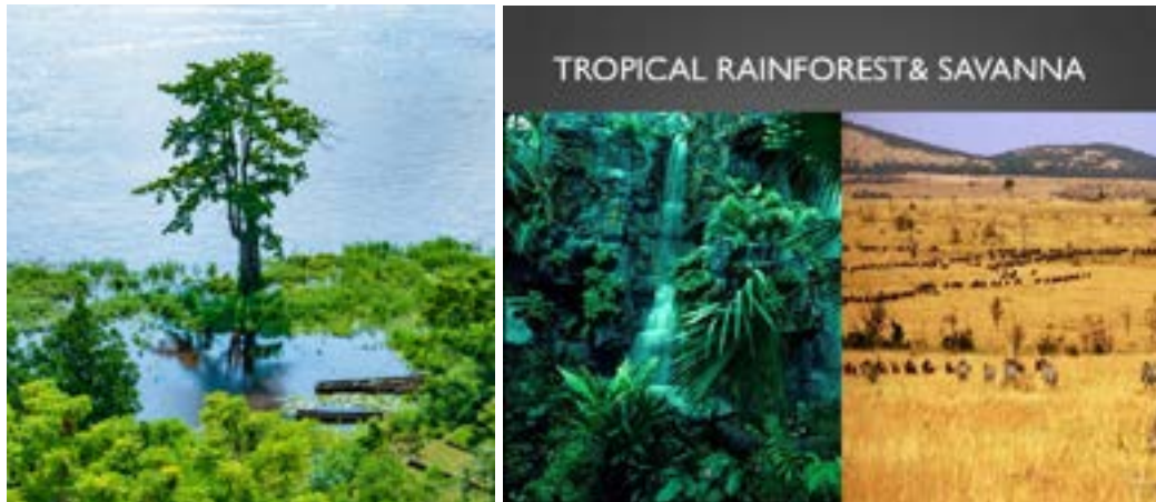
Fig. 5.1. A picture of Africa's diverse geographical features.