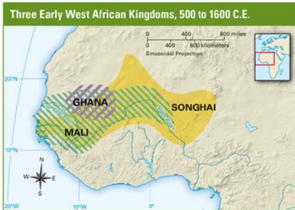
Fig. 5.9. A map of early West Africa

development of the region, leaving a lasting legacy that is still studied and celebrated today.