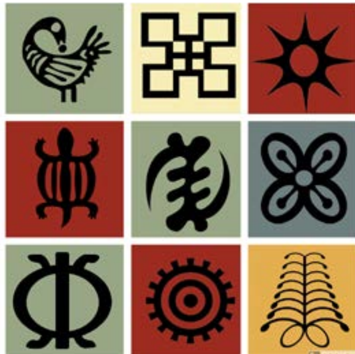
Fig. 5.8. Some Adinkra symbols

convey ancient traditional wisdom about life, philosophical thoughts, and aspects of the environment. Many of the Adinkra symbols have meanings linked to proverbs and some symbols depict historical events, human behaviour, plant life and objects' shapes.