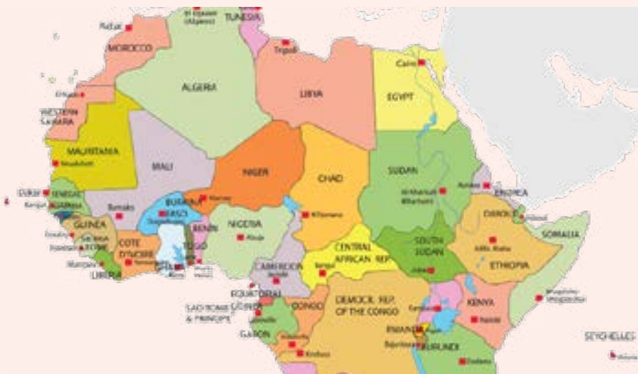
Fig. 5.10. West Africa Map

Look at the political Map of West Africa below and locate southern Mauritanian and Mali to determine the origin of the old Ghana Empire.