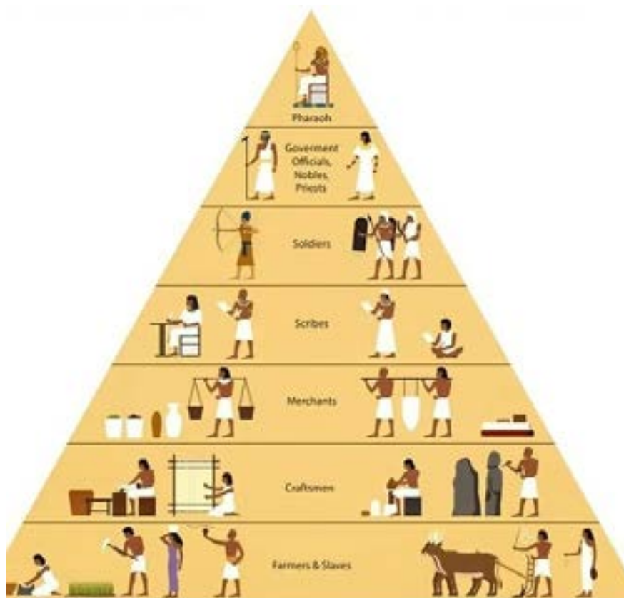
Fig. 5.3. Social hierarchy of ancient African civilisation.

At the bottom were slaves. They were either captured in wars or bought by people. They did domestic work but sometimes had chances to become more important. For example, one emperor in Mali used to be a slave before becoming a ruler. In another place called Bornu, some important advisors were originally from slave families. In ancient Africa, people had different roles, but everyone played a part in their society.