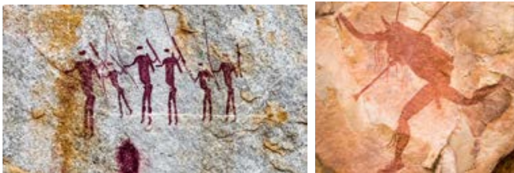
Fig. 5.7. African Rock Art

African art was also very special. People painted and carved pictures on rocks to tell stories and show what life was like a long time ago. These paintings and carvings teach us about their beliefs and how they lived. Another important part of African culture is Adinkra symbols. These symbols are like pictures that have meanings about life and nature. They are used to decorate things and teach important lessons. In Africa, people were creative and made many things that are still important and admired today.