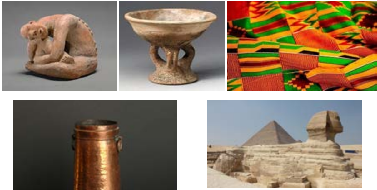
(a) Egyptian copper cups