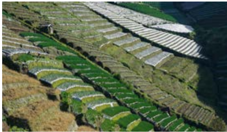
Fig. 5.5. A picture of terrace farming.

In the area of farming, some people in Africa also made flat steps on hillsides called terraces, so they could grow more food. This helped them to prevent erosion and also use the land better.