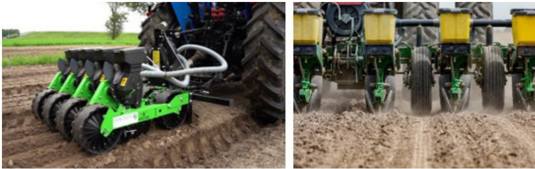
Fig. 2.27: Seed planters in different angles