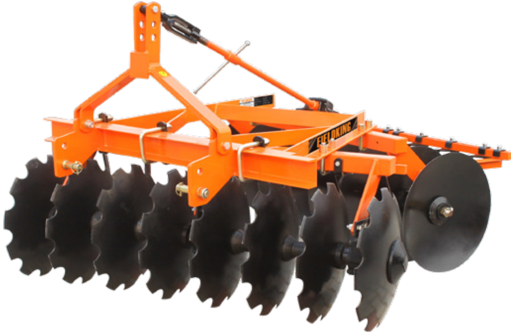
Fig. 2.24: Harrower