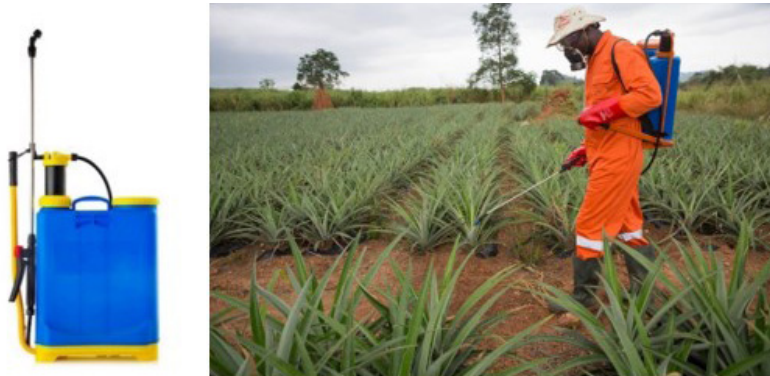
Fig. 2.30: Knapsack Sprayer (left), Man manually using a knapsack sprayer on a farm (right)