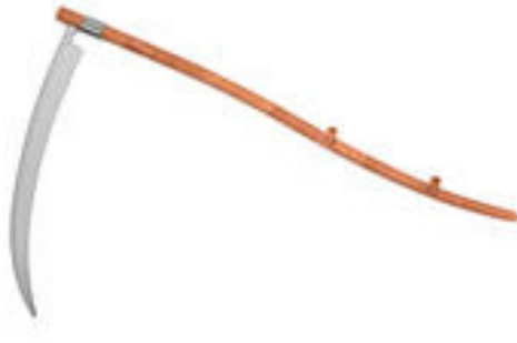
Fig. 2.8: Picture of a scythe