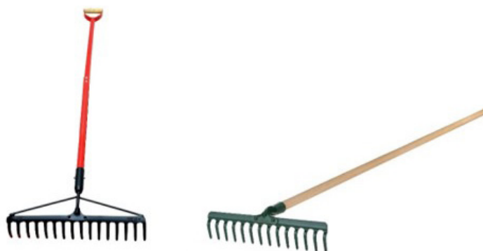
Fig. 2.10: Diagram of rake