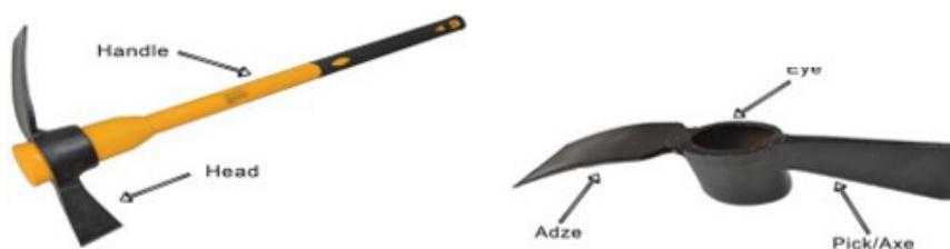
Fig. 2.6: Picture of a mattock head of a mattock