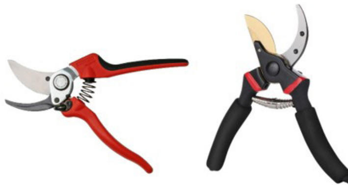
Fig. 2.14: Pruning shears