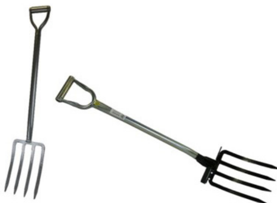
Fig. 2.11: Spading forks/pitchforks/foot forks