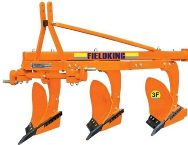
Fig. 2.22: Mould-board plough