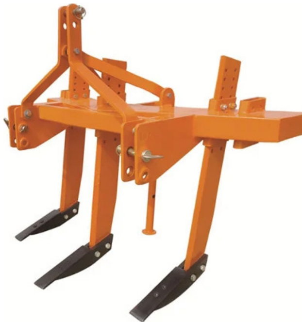
Fig. 2.23: Sub-soil single-arm plough