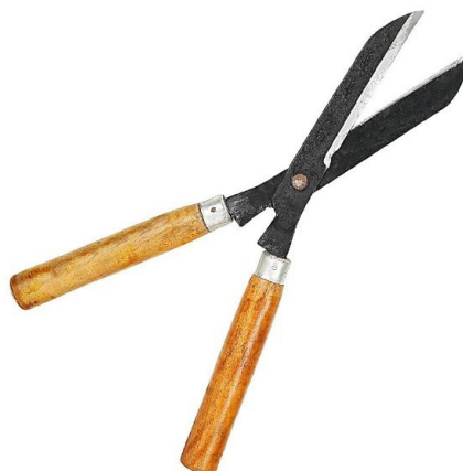
Fig. 2.17: Hedge shears