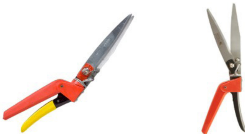
Fig. 2.16: Grass shears