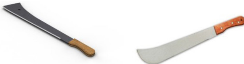
Fig. 2.5: Diagram of machetes/bolos