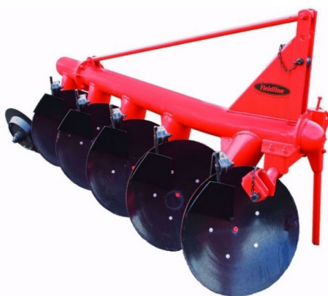
Fig. 2.22: Mould-board plough