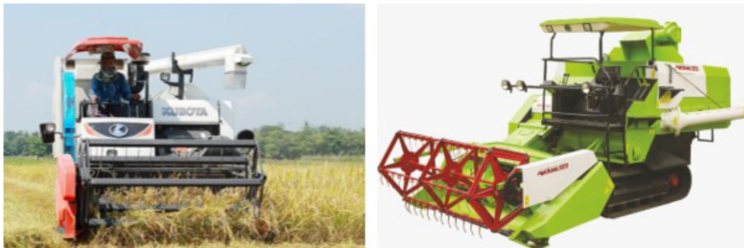
Fig. 2.29: Harvester (left), Harvester on a farm (right)

2. Harvester: They are used to harvest larger areas of crops quickly and efficiently.