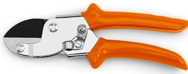
Fig. 2.15: Secateurs