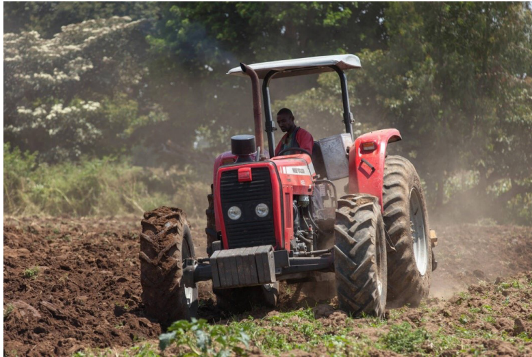
Fig. 2.28: Picture of a tractor