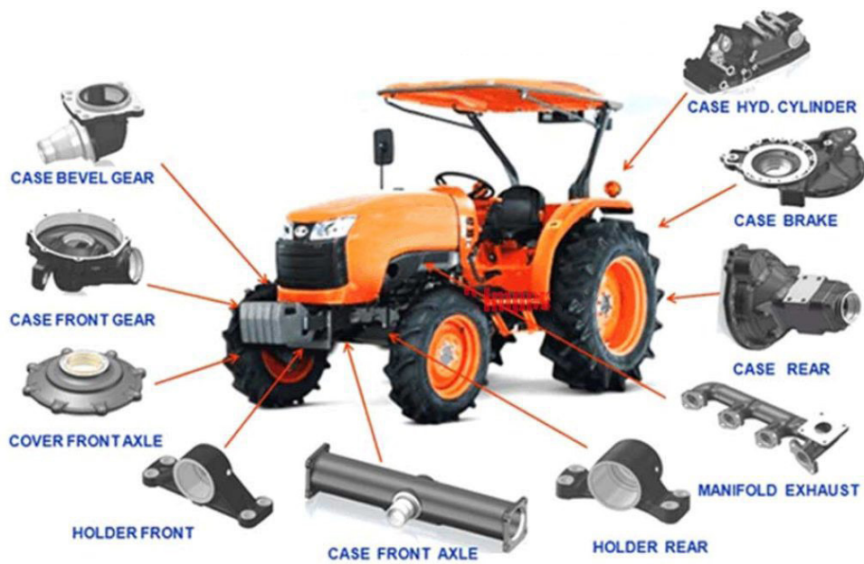
Fig. 2.29: Parts of a tractor

2. Harvester: They are used to harvest larger areas of crops quickly and efficiently.