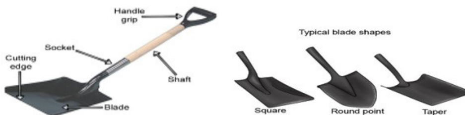
Fig. 2.9: A diagram of a spade. Heads of spade and shovel (middle)

shaft. At the end of the blade is the cutting edge, which does the work of cutting through soil, clay, snow, and any other material.