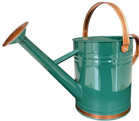
Fig. 2.18: Manual sprinkler

19. Manual sprinkler: This is a simple hand-held watering can for watering plants.