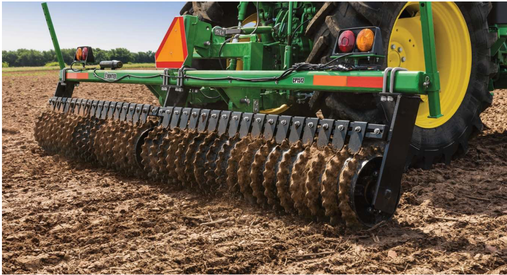
Fig. 2.13: Cultipacker