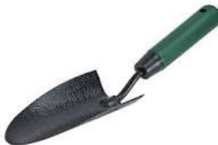
Fig. 2.2: Picture of hand trowel