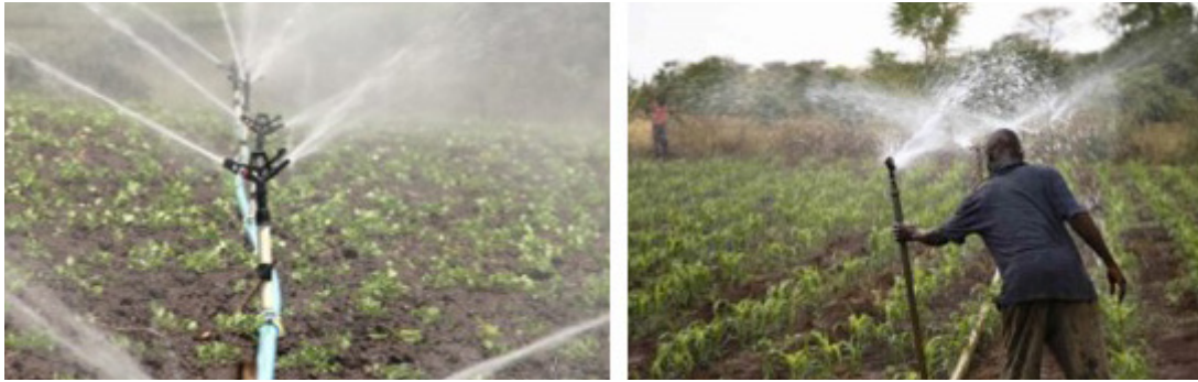
Fig. 2.26: Sprinkler