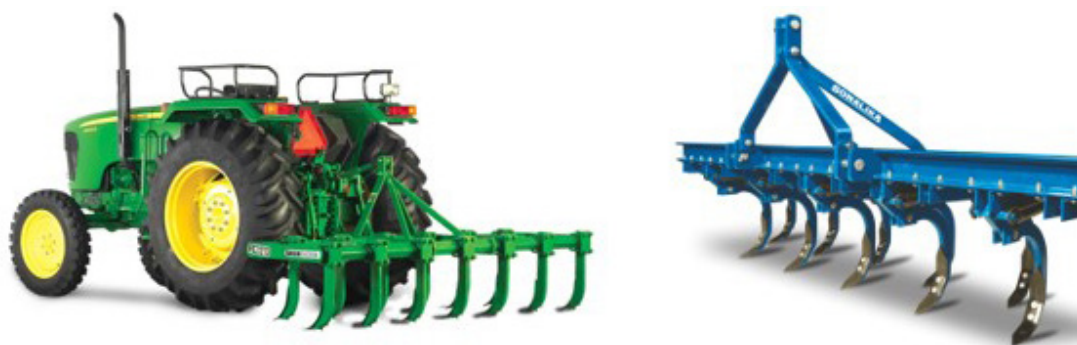
Fig. 2.21: Pictures of cultivators