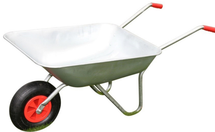
Fig. 2.19: Picture of a wheelbarrow

20. Wheelbarrow: This tool consists of a container mounted on a single wheel with two handles for controlling movement. A wheelbarrow is used for moving lightweight items such as fertilisers, manures, plants, seeds, and waste materials.