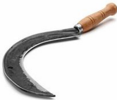
Fig. 2.7: Diagram of a sickle