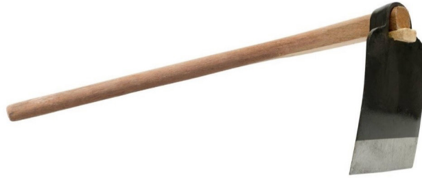
Fig. 2.12: Grab hoe