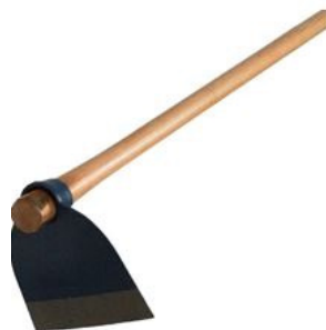
Fig. 2.4: Diagram of a hoe