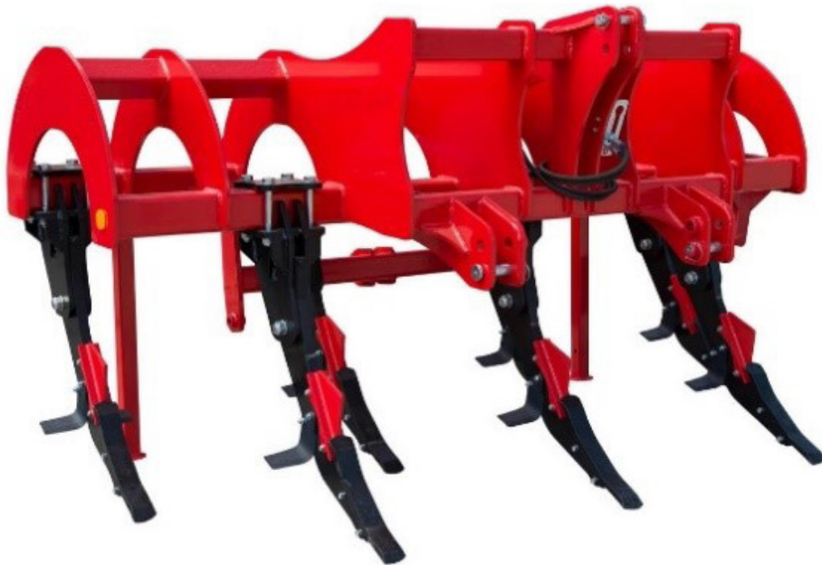
Fig. 2.25: Subsoiler