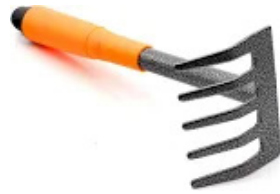
Fig. 2.3: Picture of hand cultivator