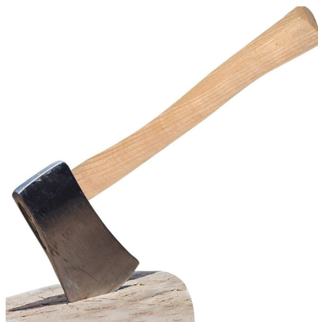
Fig. 2.20: Picture of an axe

21. Axe: Consists of a metal part (head) and a handle that can be made of different materials, usually wood. It is used for cutting or splitting wood and big branches of trees.