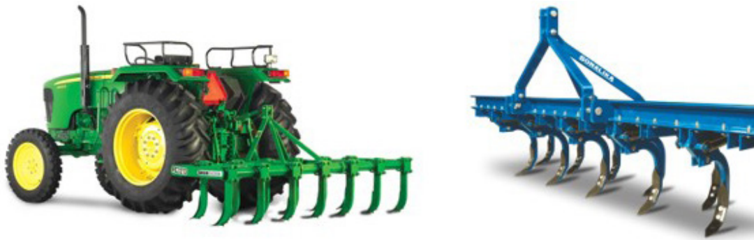
Fig. 2.21: Pictures of cultivators