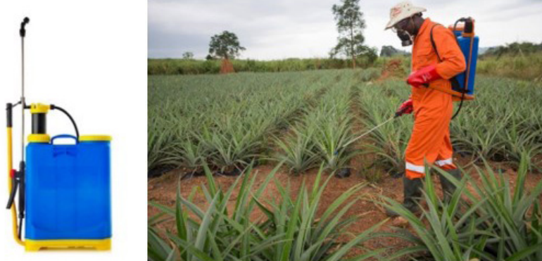
Fig. 2.30: Knapsack Sprayer (left), Man manually using a knapsack sprayer on a farm (right)