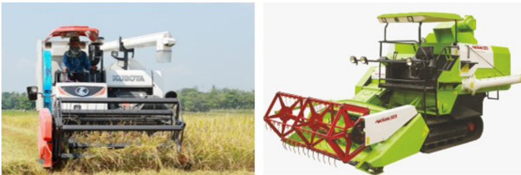
Fig. 2.29: Harvester (left), Harvester on a farm (right)