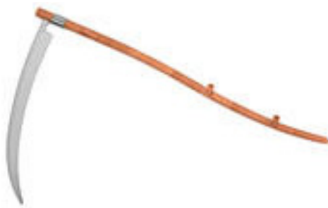
Fig. 2.8: Picture of a scythe