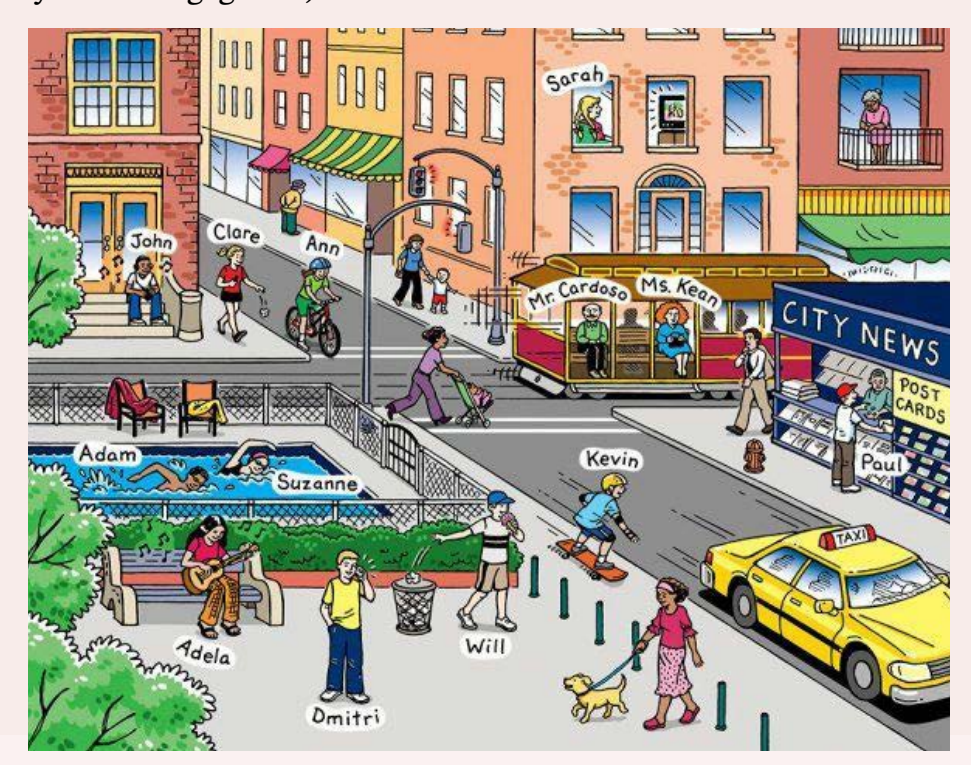
Fig 6.1: City picture for description

(Identify the type of dress, the colour of dress, their locations and the activities that they are all engaged in).