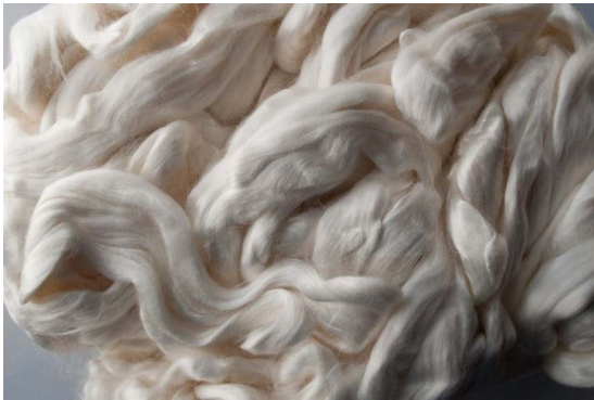
Fig 4.3: Acetate