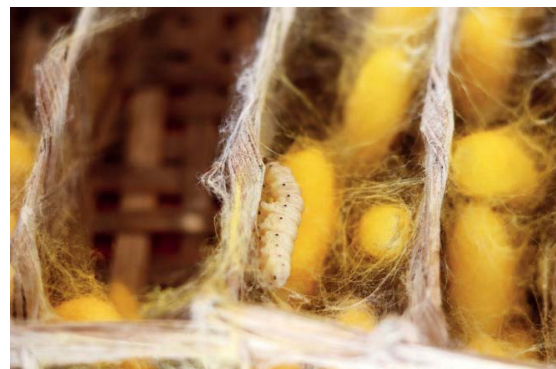
Fig 4.2: Cotton boll