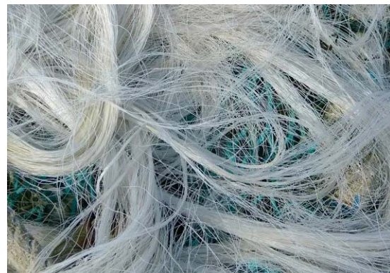
Fig 4.6: Nylon