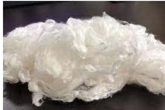
Fig 4.4: Viscose/rayon