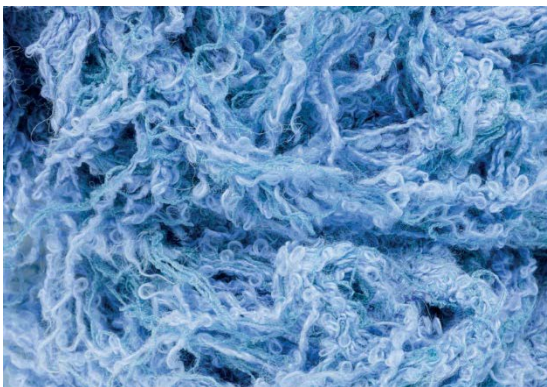
Fig 4.5: Polyester