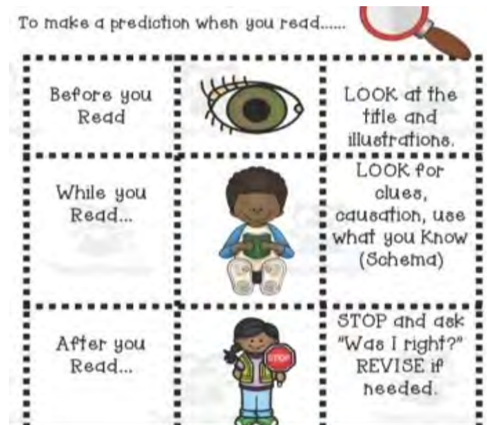
Fig 8.1: Predicting the Content of a Text

Examine the picture below to give more ideas on how to accurately predict the content of a text.