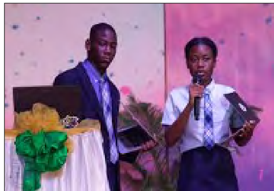
Fig. 10.1: A picture of an oral presentation

An oral presentation is the act of talking to people on a particular topic. During oral presentation, you listen to a speaker to understand the ideas talked about and share your opinions on it verbally. Some oral presentation situations include class meetings, classroom presentations, club meetings, group discussions and oral reports to teachers, classmates, friends, or parents. Oral presentation helps to educate, inform, and entertain the listener. Engaging in oral presentation will also help you develop your confidence in the use of the English language. The speaker is normally required to use simple language and make the ideas very brief