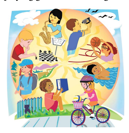
Fig 2.2 Examples of recreational activities

that one undertakes to have fun and enjoy life during one's free time. This includes experiences that require physical activity, interactions and playing with other people. Examples include dancing, playing games, swimming, hiking, gardening etc.