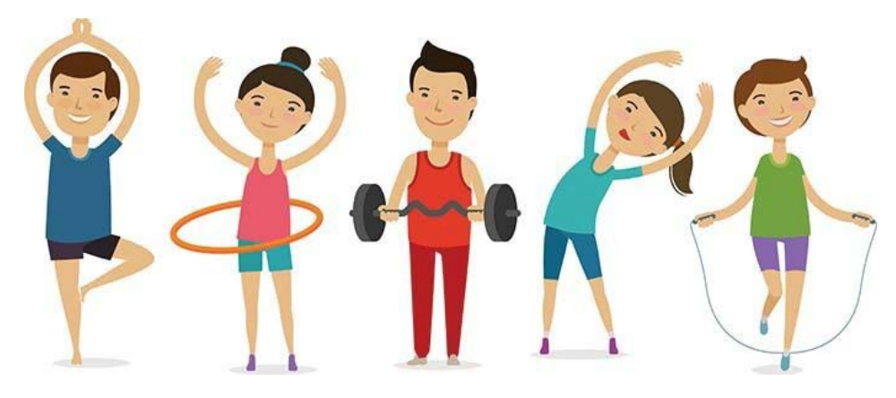
Fig 2.1 Illustration on different physical activities

Physical activity: Physical activity is any bodily movement produced by skeletal muscles that requires energy expenditure. It refers to all forms of movement including dancing, walking, jogging, running, cycling and swimming.