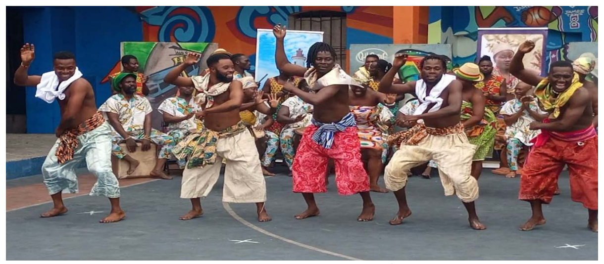
Fig 2.4 Performance of Kpanlogo dance.