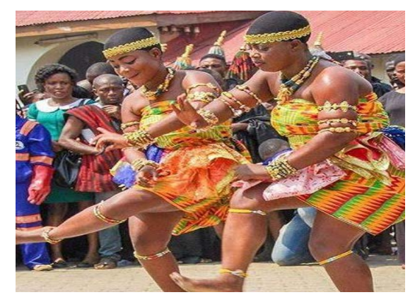
Fig 2.5 Performance of Adowa dance.