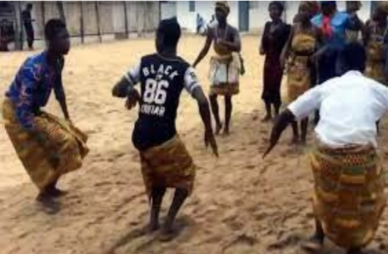
Fig 2.3 Performance of Agbadza dance