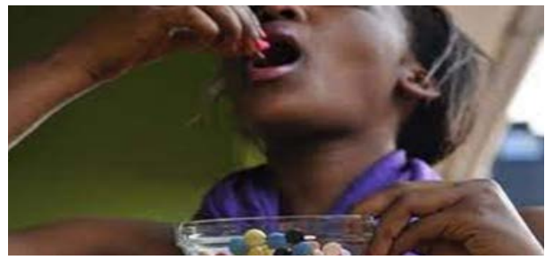
Fig 3.13 Wash hands always Fig 3.14 Avoid self-medication