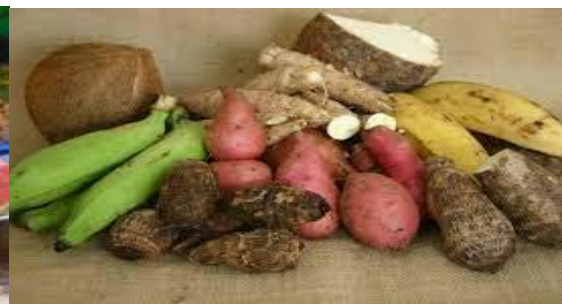
Fig 3.7 Fruits Fig 3.8 Starchy roots and plantain

4. Water: Water is a transparent liquid with no color, flavor, or odor that is used for drinking, cooking, and cleaning. Drinking plenty of water every day is essential for healthy health. Make it a habit to drink water at regular intervals throughout the day. The normal recommendation is to drink two liters (8 glasses) of water each day, but this might vary based on the season and the type of activities/work an individual engages in. Water has the ability to heal the body and benefits it in several ways.