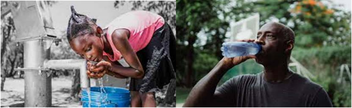
Fig 3.9: Do not wait until Fig 3.10 water a beverage for champions