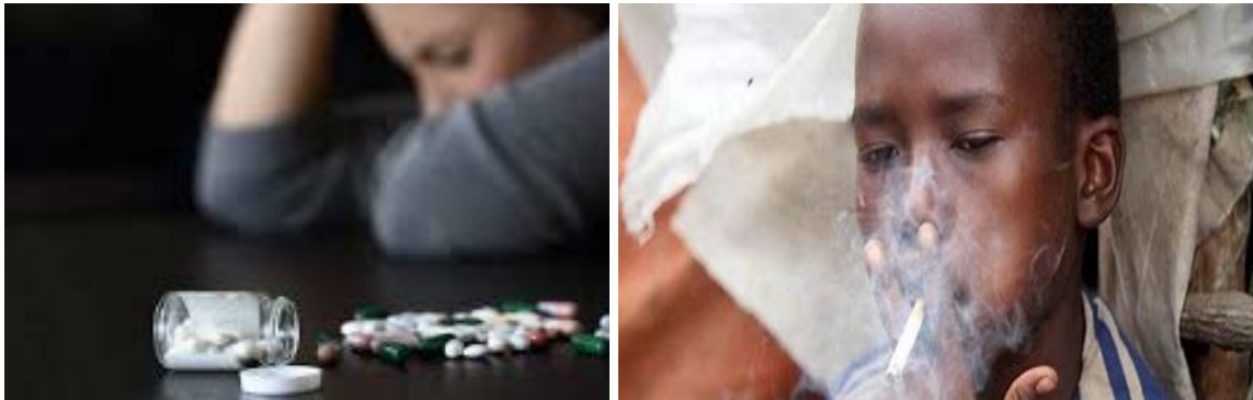
Fig 3.12 Bad behaviours to avoid.

Unhealthy lifestyle: An unhealthy lifestyle refers to actions or behaviours that increase a person's likelihood of developing illness, injuries and even death.