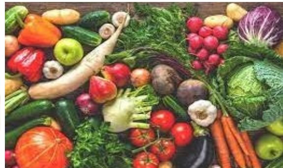
Fig 3.5 Whole grains Fig 3.6 Vegetables