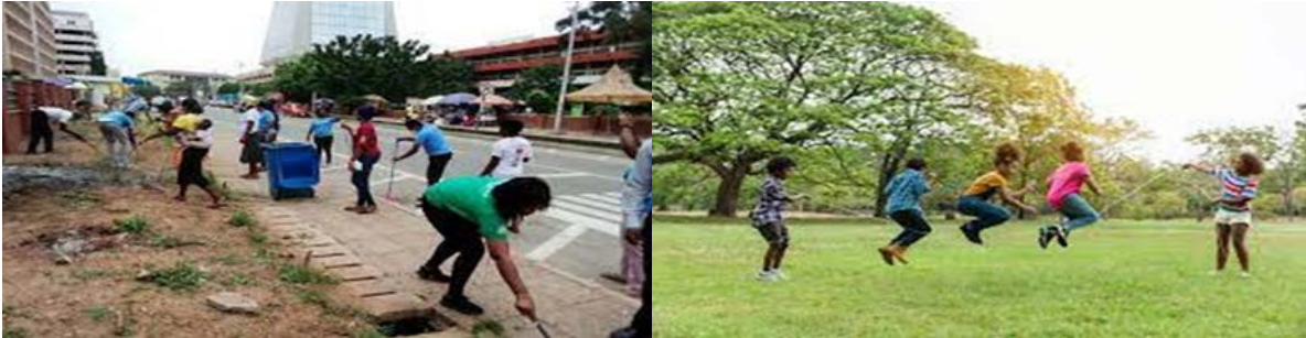
Fig 3.1 Incidental activity Fig 3.2 Physical Exercise

2. Sleep and relaxation: Sleep is a period of relaxation. It is a period of diminished mental and physical activity during which consciousness changes or is transformed, and bodily activity is reduced to some level. During sleep, muscular activity decreases and reactions to the environment are considerably decreased. It is advised that people sleep for 7-8 hours every night. This helps to: