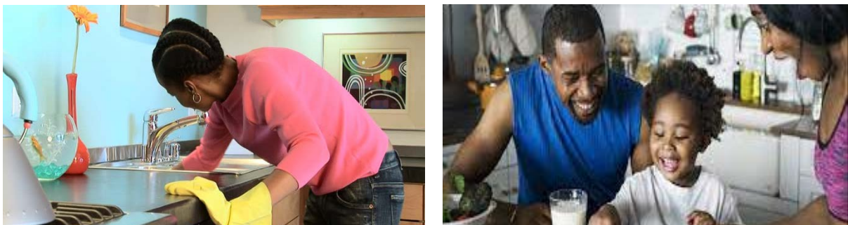
Fig 3.11 A healthy lifestyle produces a joyful home.

A Healthy Lifestyle: A healthy lifestyle is defined as actions or behaviours that lower the risk of disease and accidents while also improving overall wellness.