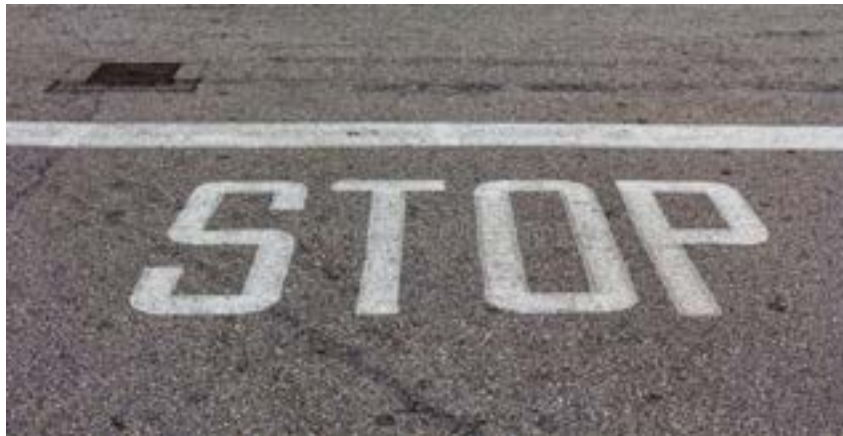
Fig. 2.17: Stop lines

These lines indicate the position beyond which vehicles should not proceed when required to stop at intersections by traffic police or other control device.