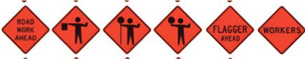
Fig. 2.11: Orange Road signs as temporary signs relating to road work

Orange road signs are usually temporary signs relating to road work, temporary traffic control, and maintenance warnings. When you see orange road signs, be sure to watch for workers on or near the roadway.