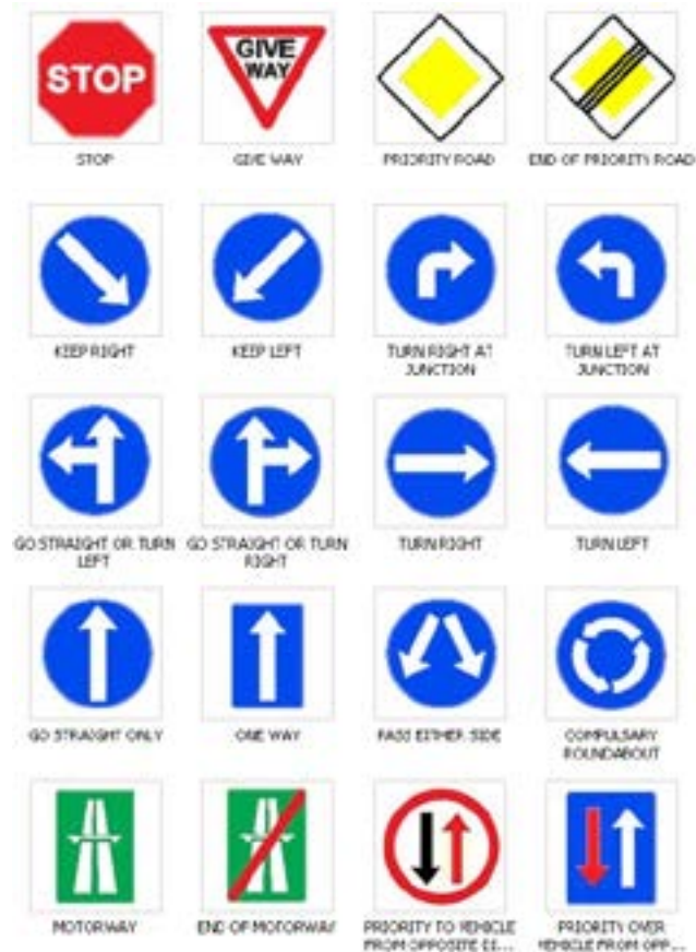
Fig.2.15: Warning signs