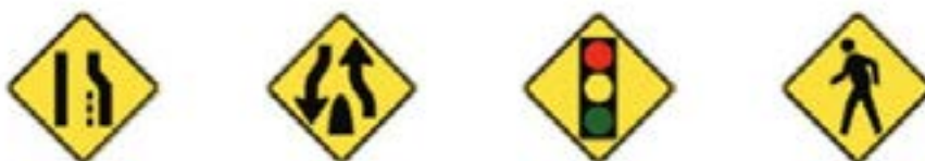
Fig. 2.10: Yellow Road signs are general warning signs

Yellow road signs are general warning signs to indicate potential dangers or changing road conditions ahead. For example, road signs that use the colour yellow may warn you that there is a narrow bridge ahead, a railroad crossing, curves in the roadway, a pedestrian crossing, or any other potential danger.