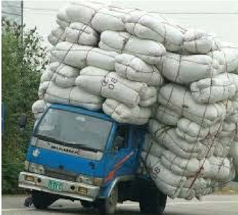
Fig 2.1 A picture of an overloaded vehicle