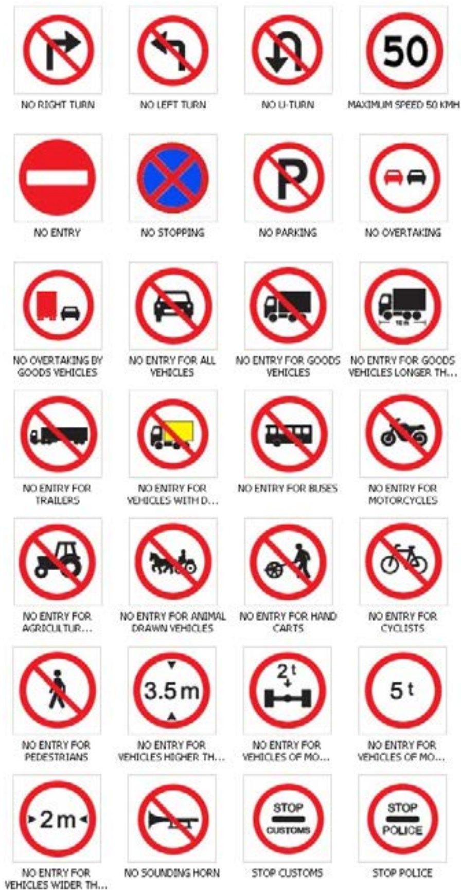
Fig. 2.13: Speed limits signs.