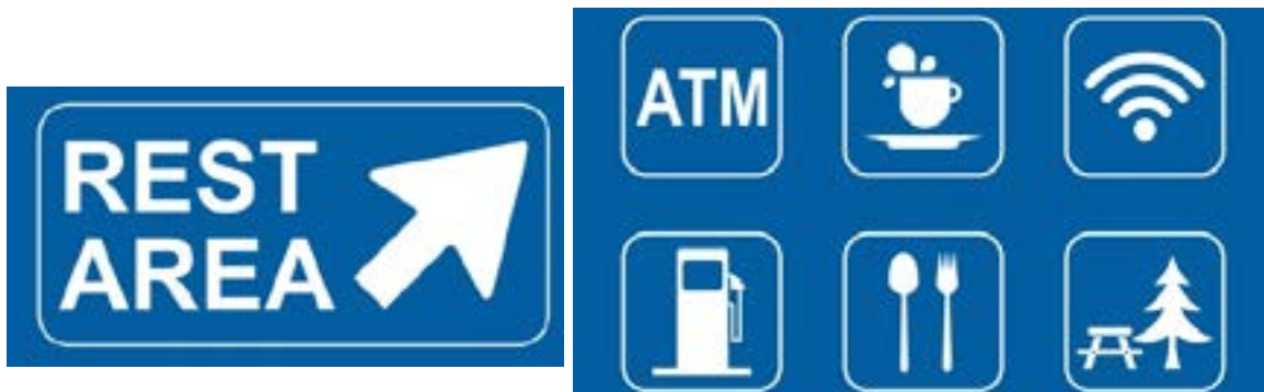
Fig. 2.9: Blue Road signs display services for travellers

Blue road signs display services for travellers. These signs are normally found on highways, directing motorists to where they can find places such as rest areas, tourist sites, hospitals, hotels, fuel stations, restaurants, and other services commonly used by motorists.