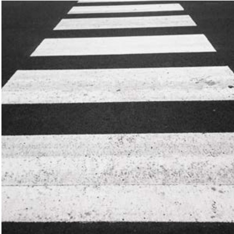
Fig. 2.16: Zebra crossings