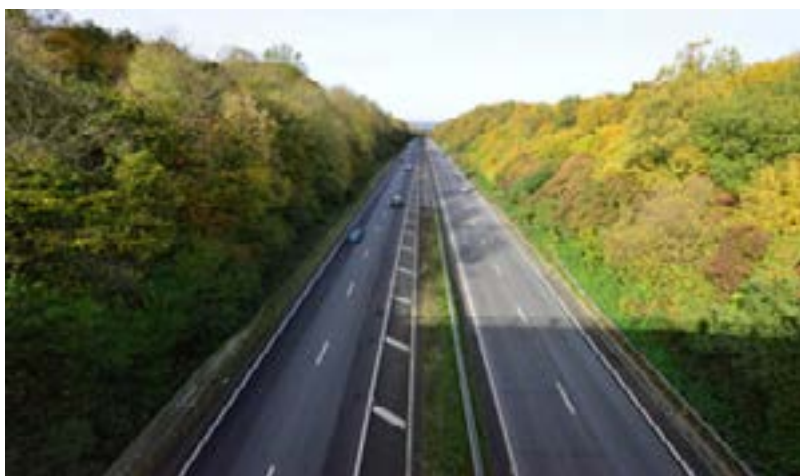
Fig. 2.19: Edge lines

These are line markings used to define road boundaries and prevent vehicles from straying off the road.