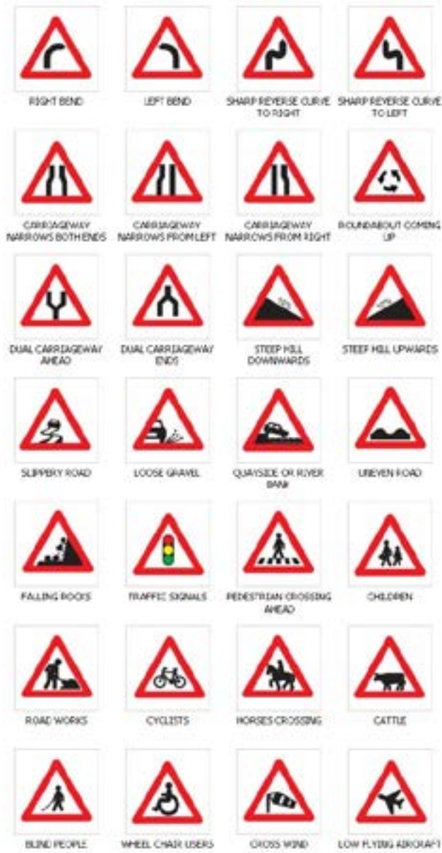
Fig. 2.14: Warning signs.

These are signs designed to warn road users especially motorists of hazards or dangers ahead. Therefore, they should slow down to prevent accidents. Below are some of the warning signs in Ghana.