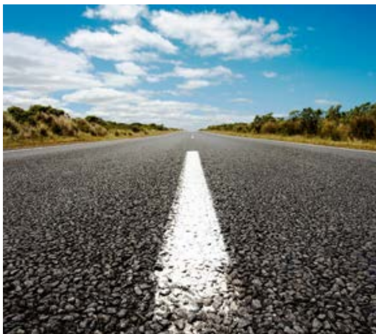
Fig. 2.18: Center lines