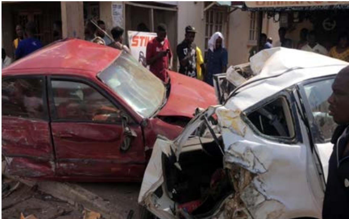
Fig 2.4 An accident scene

Road accidents often cause damage to vehicles and infrastructure such as roads, bridges, and traffic signals. The cost of repairing this infrastructure adds to the economic burden of road accidents and can lead to troubles in transportation and commerce.