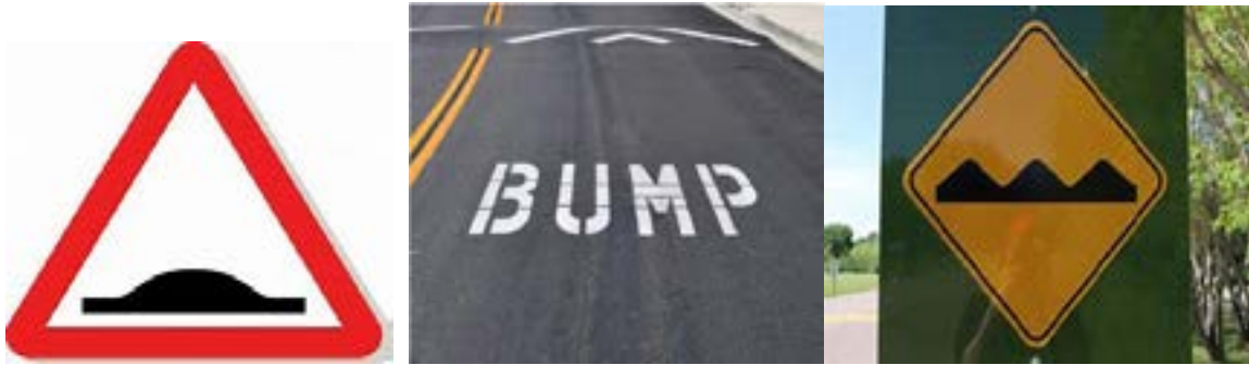
<cap>Fig. 2.20: Speed humps.