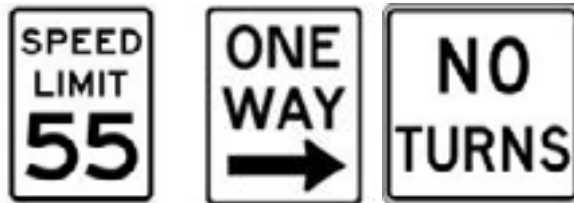
Fig. 2.12: Black and white signs provide motorists with regulations and laws governing use

Road signs with black and white colours provide motorists with regulations and laws governing the use of that road.