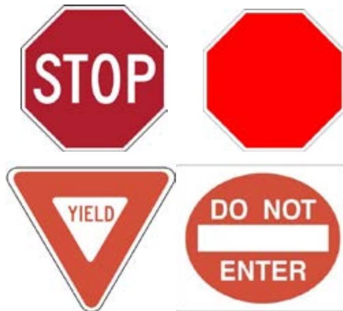
Fig. 2.6: Red Road signs

Red road signs refer to situations where you must stop or yield. All stop signs and yield signs use the colour red, but other signs such as do not enter, and wrong way signs can also use red colouring.