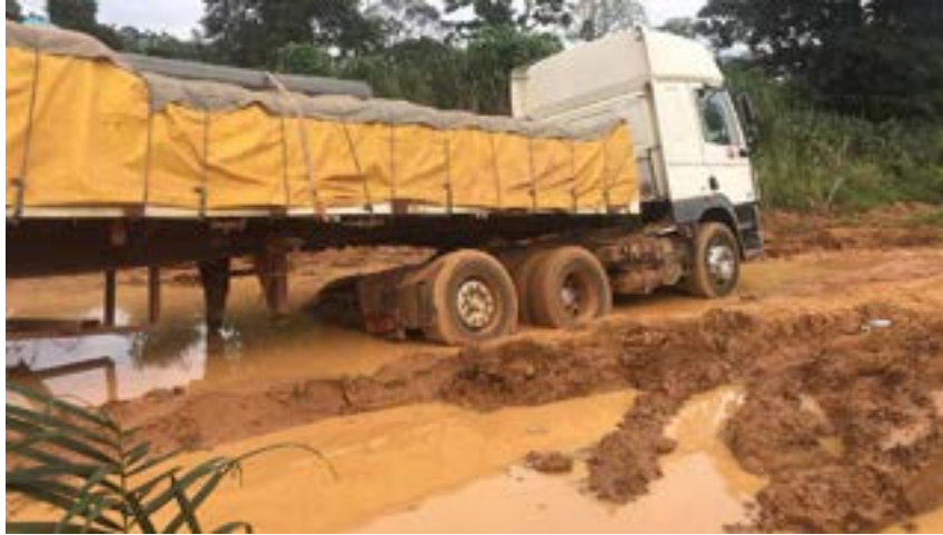
Fig 2.2 A picture of a bad road