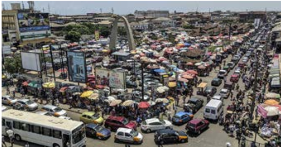
Fig 2.5 Traffic congestion in Accra