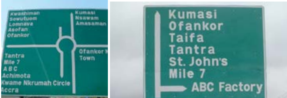
Fig. 2.7: Green Road signs are directional signs

Green road signs are directional signs. This colour is used for things like street signs (the names of streets), exit signs, mile markers, and signs showing you directions to a certain city or the distance to a specific place.