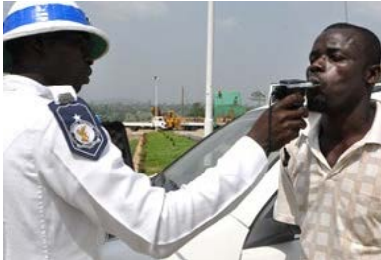
Fig 2.21 A picture of a road safety team