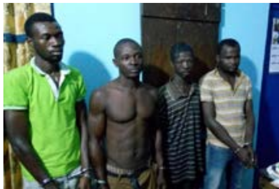
Fig. 4.3: A picture of suspected armed robbers in handcuffs

Unethical behaviours tarnish an individual's fame or esteem. For example, every person is born with some dignity or respect. However, if you are caught or arrested by the police for stealing, people will no longer respect you. In this case, your image is tarnished. Also, the trust that people have in you is eroded thereby affecting personal and professional relationships.