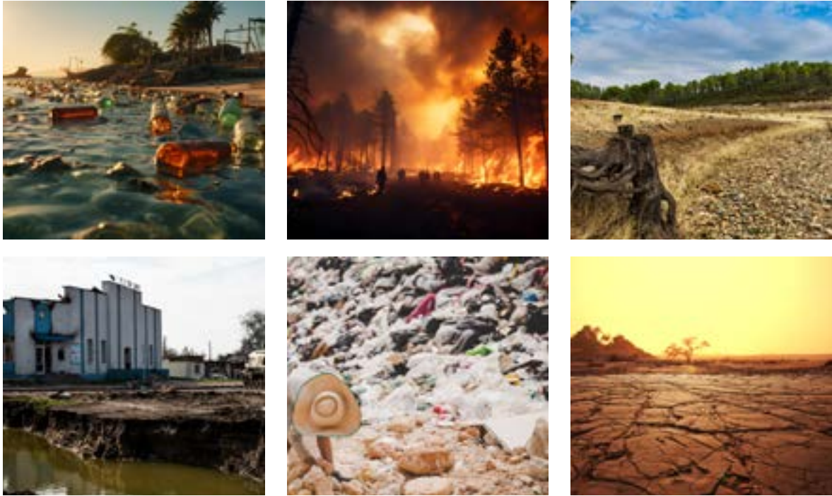
Fig. 4.4: Human activities that destroy the natural environment.