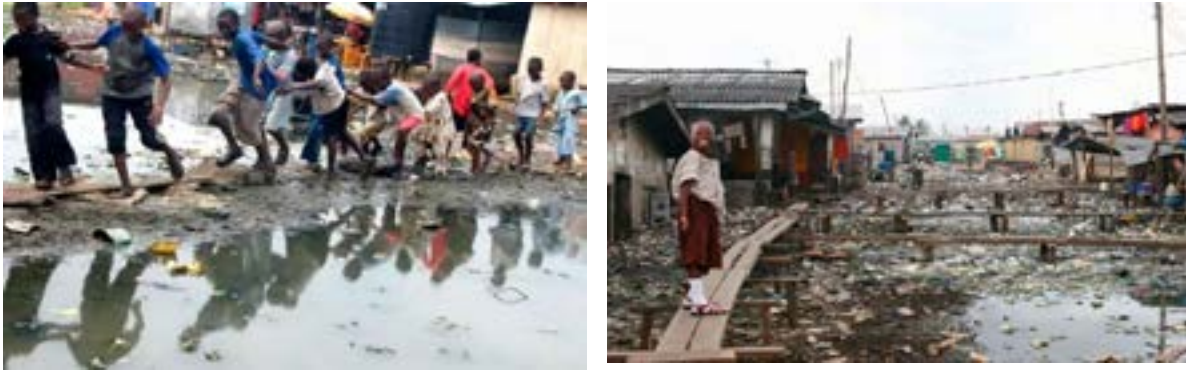
Fig. 4.6: Some children in a filthy environment.