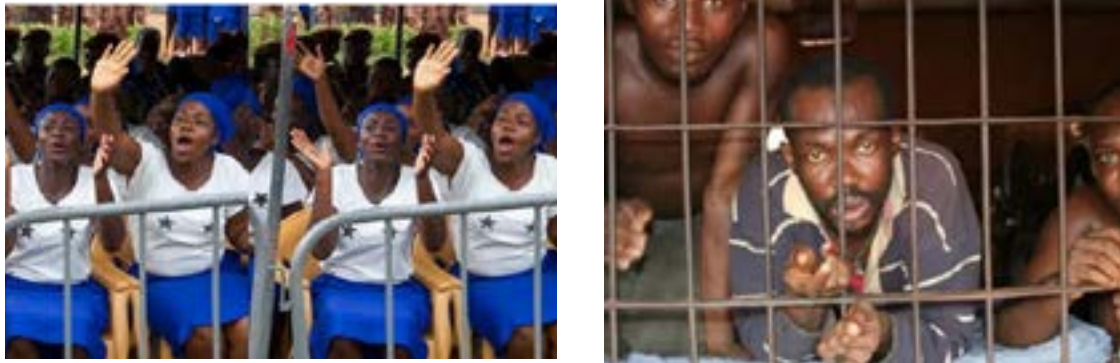
Fig. 4.2: A picture of showing both female and male prisoners

Unethical behaviours may lead to the violation of laws or regulations of the society. Once the individual violates or breaks laws such as stealing, fighting, bullying etc., the individual is arrested and punished. Some may be sued at the law courts and tried, leading to imprisonment, fines or both.