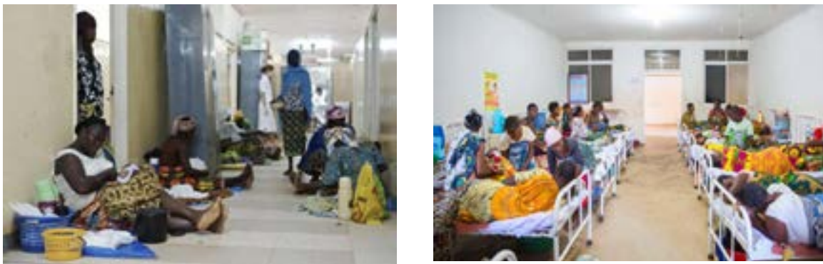
Fig. 4.5: Poor healthcare delivery in Ghana due to unethical behaviour

Unethical behaviours in the healthcare system such as falsifying medical records, taken bribes, increasing medical claims, reusing medical equipment that are supposed to be thrown away may increase the risks of infections, medical errors, and inadequate treatment. This in the end will lead to poor treatment of illness and its related problems.