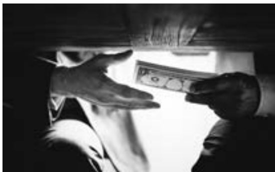
Fig. 4.1: Pictures of unethical behaviours.