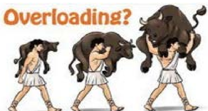
Fig. 4.4: Principle of Overload

The principle of overload is necessary to make gains in fitness and athletic performance. It increases muscle hypertrophy (muscle growth) and boosts the growth of lean muscle mass, which helps athletes obtain results from their workout. This means you can achieve better results from your workouts.