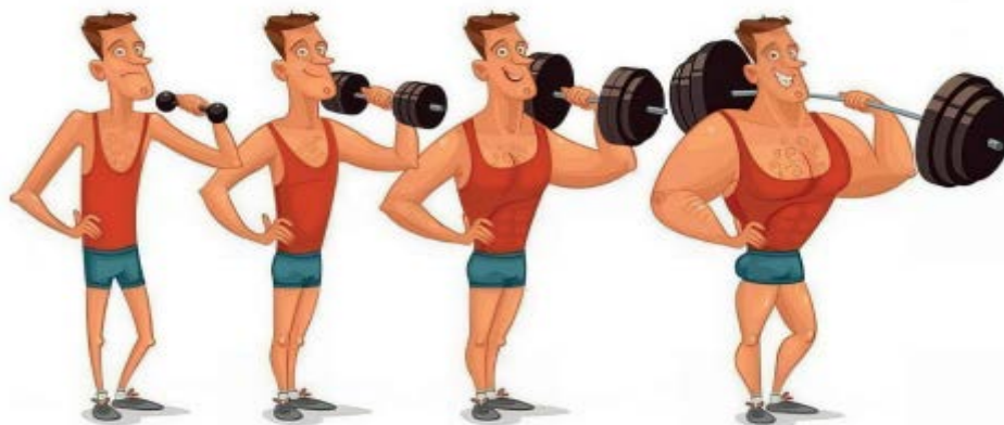
Fig. 4.3: The principle of progression