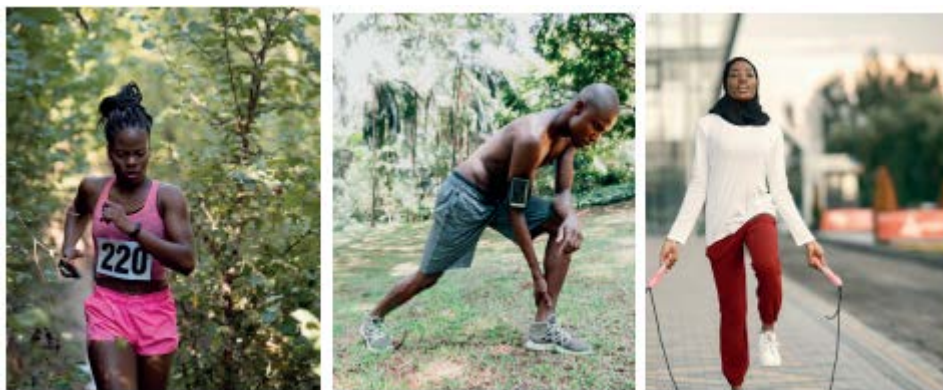
Fig. 4.2: The principle of specificity (for long distance running)