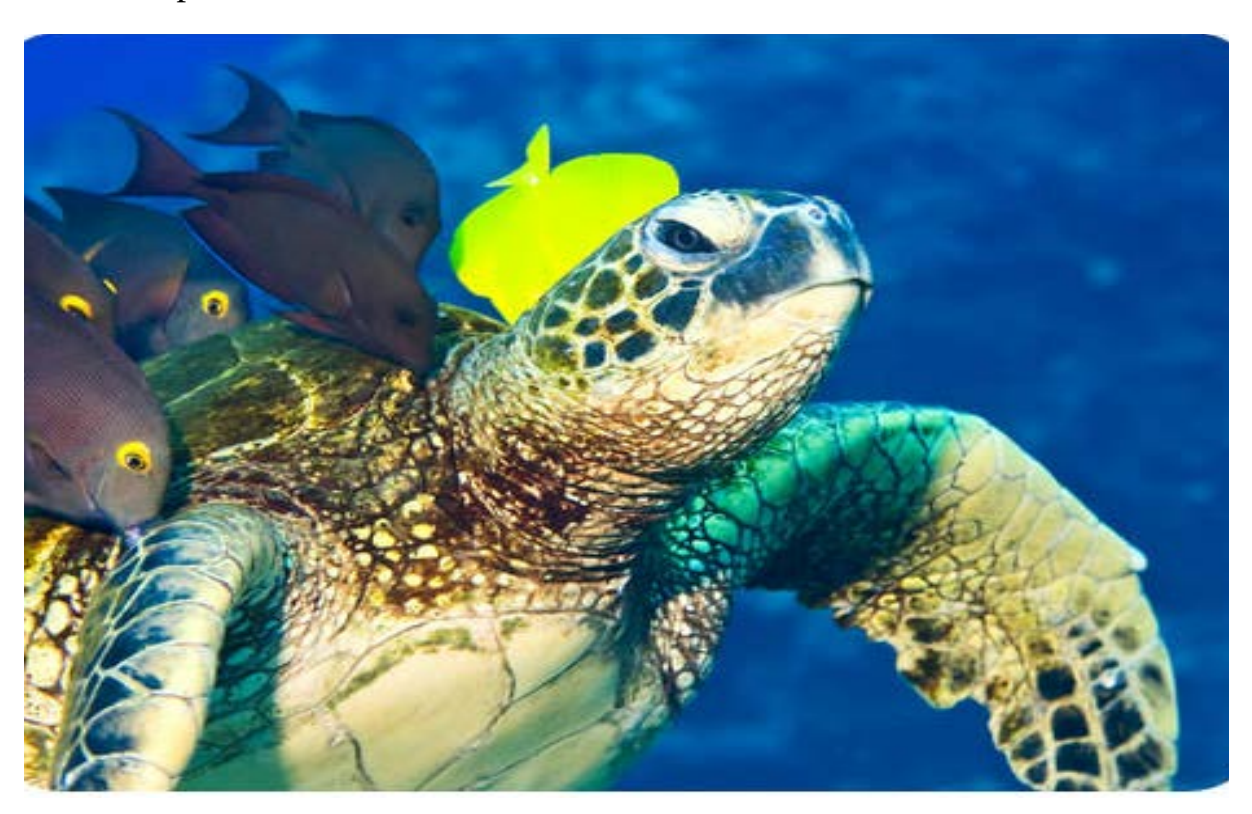
Fig. 11.1: Surgeon fish feeding on algae growth on a turtle shell

Below is an image of fish feeding on algae on a turtle. This is an example of a symbiotic relationship.