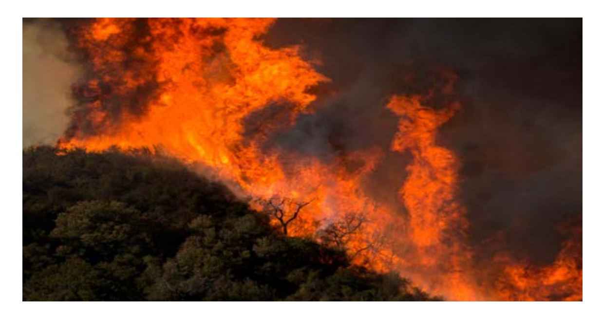
Fig. 11.7: Wildfire causing destruction to a forest cover

Galamsey (Gather and sell) has done serious damage to our forest cover, land and water bodies as well as human and animal health. Below are some images of destructions caused to the environment as a result of galamsey activities.