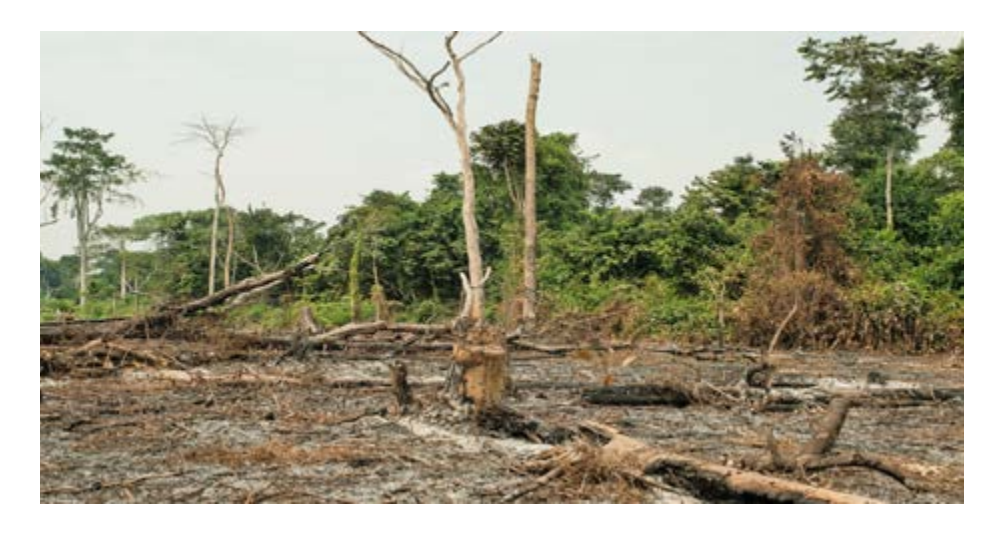
Fig. 11.3: Forests trees cut down for agricultural purposes.