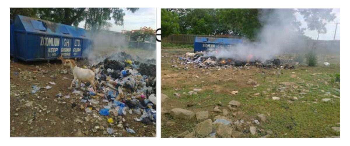
Fig. 11.6: A substandard offsite storage facility showing easy access to vectors, rain and unauthorised persons.

Below is photo of dumped garbage at an unauthorised place near a health facility