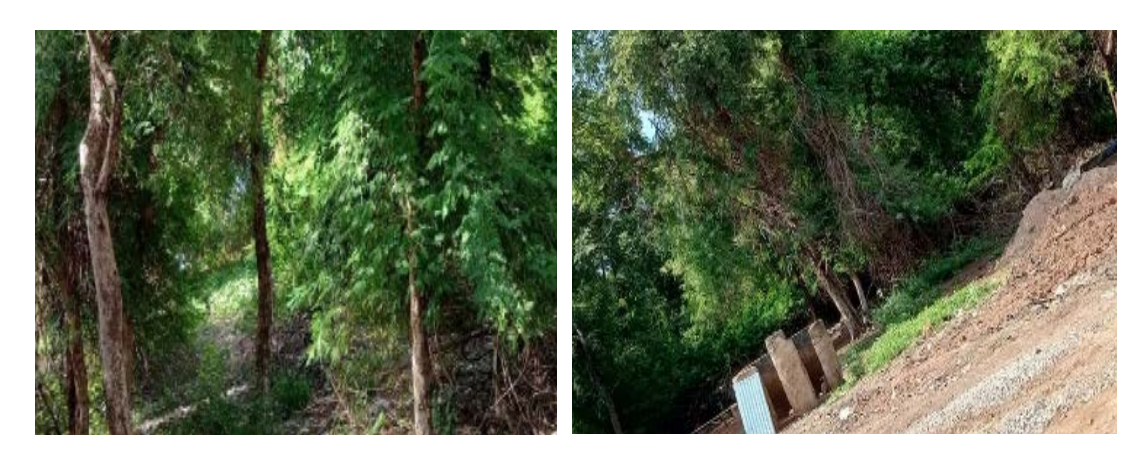
Fig. 11.10: Kplavou shrine at Katariga in the Sagnarigu Metropolitan Assembly.

Example of this reverence and interconnectedness to nature is found among the Dagombas of the Katariga. Local people visit the shrine to perform rituals and feel a connection with the deity and ask that their needs be met. Through their respect for the site as a place of worship or power, practitioners of AIR have looked after and preserved the environment around it, despite the efforts of modern developers. The shrine is pictured below.