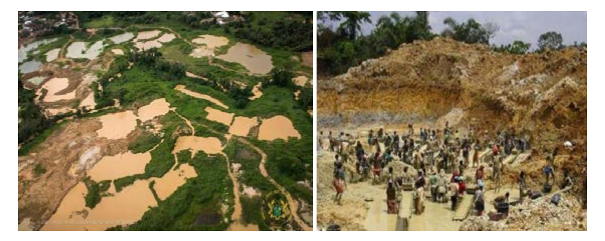
Fig. 11.8: Galamsey activities on the environment

Galamsey (Gather and sell) has done serious damage to our forest cover, land and water bodies as well as human and animal health. Below are some images of destructions caused to the environment as a result of galamsey activities.