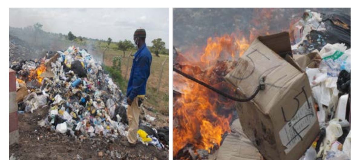
Fig. 11.5: Open burning to reduce volume of Biomedical solid waste at a landfill site, Tamale.

The pictures below show open burning to reduce volume of unseparated waste at a land fill site without proper controls.