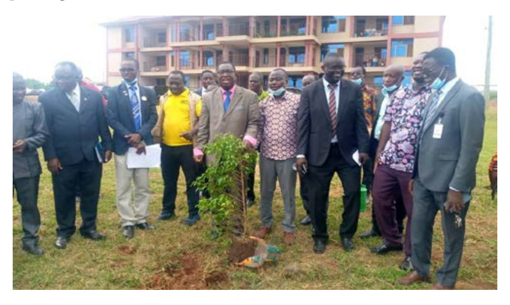
Fig. 11.14: SDA Church involved in tree-planting

The initiative also supports communities affected by deforestation, climate change, and environmental degradation. Below is a picture of Adventists planting trees.