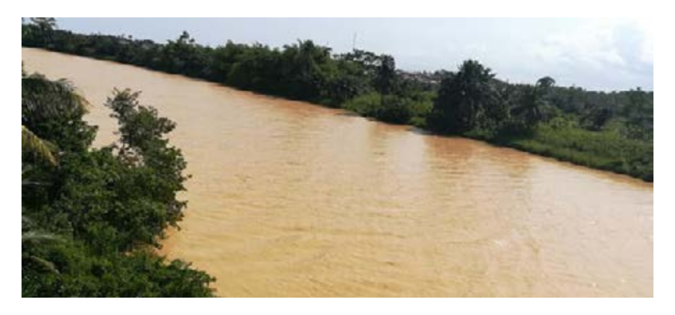
Fig. 11.4: Pollution in the Pra river as a result of galamsey

Unregulated and illegal mining activities leads to environmental degradation and water pollution. This pollution carries health risks to miners and nearby communities as well as aquatic life. Galamsey destroys the habitats of plants and animals, destabilising ecosystems.