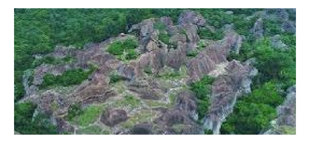
Figure 11.9: Tanoboase Sacred Groove at Bono East Region