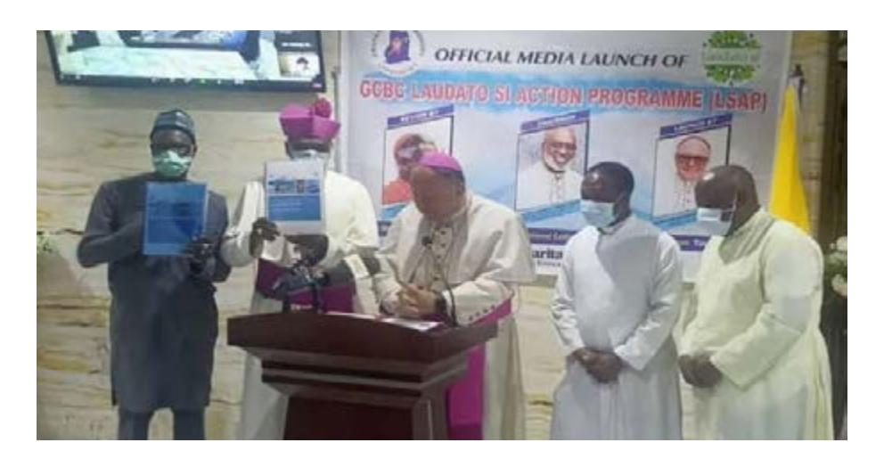
Fig. 11.12: Catholic Bishops in Ghana launching a five-year Laudato Si' Action Program (LSAP)

It was an opportunity for the church to educate its members and inspire them to care for the environment as an act of faith and service to others.