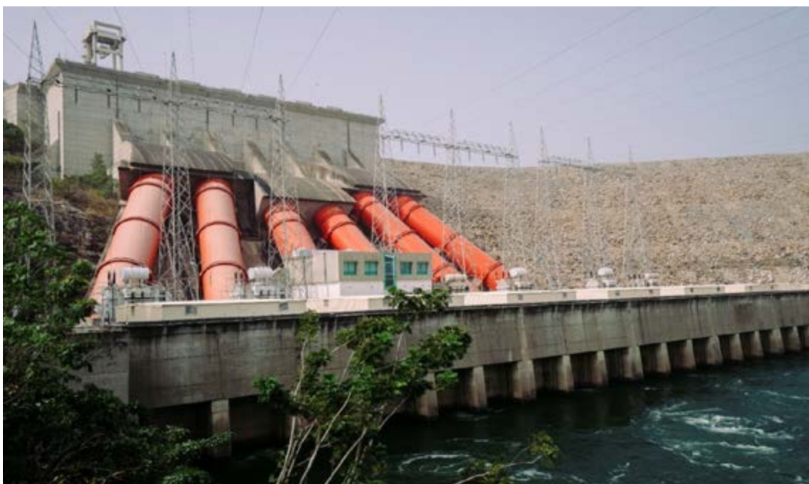
Fig. 12.3: Environmentally friendly energy from Akosombo Dam