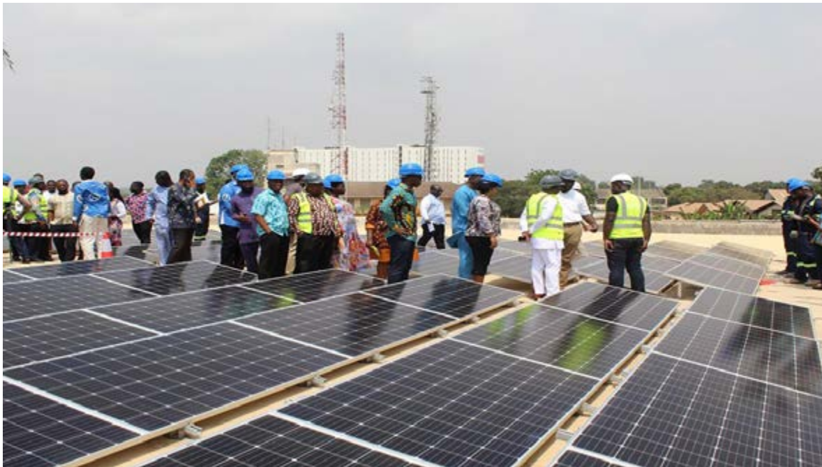
Fig. 12.2: Example of clean energy - Solar Energy