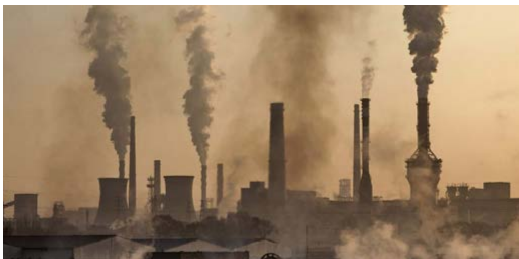
Fig. 12.4: Burning of fossil fuel to generate energy.