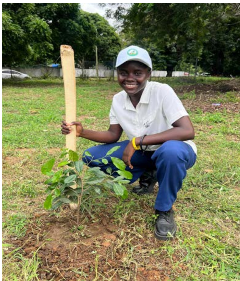
Fig. 12.5: A young religious lady planting a tree as her way of reconnecting to nature