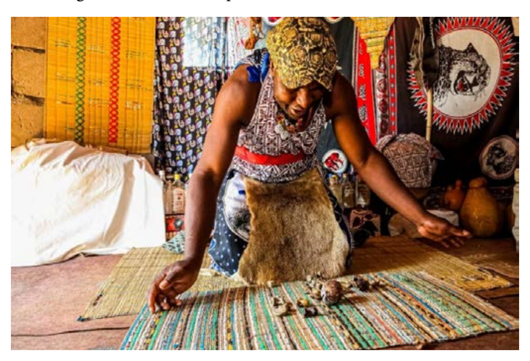
Fig. 6.1: An image of a Female Indigenous Healer

Medicine men and women get their vocation through dreams, visions, or inheritance. They must train formally in traditional medicine and focus on treating sickness, disease, and misfortune caused by magic or witchcraft. They use herbal potions and other natural ingredients to heal and prevent future misfortune.