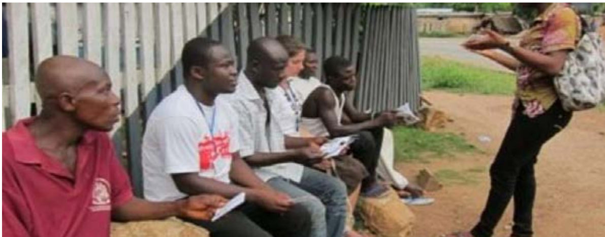
Fig. 7.2: An act of Evangelism

Christians share their beliefs through evangelism to spread the gospel, for example through preaching or witnessing to others. Christian evangelism follows the command of Jesus to go out into the world and preach to all people (Matthew 28:19-20). Evangelism can occur in churches, open-air meetings, electronic media, Christian literature, and one-on-one witnessing.