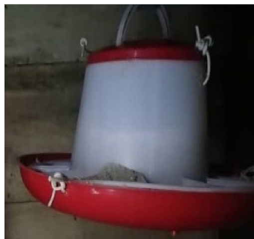
Fig 6.2: A feeding trough