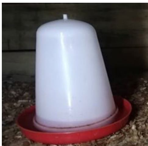
Fig 6.1: A water trough

Equipment: Poultry production requires various types of equipment such as feeding and water troughs, heating and lighting and ventilation systems, incubators, hatcheries, and stores.