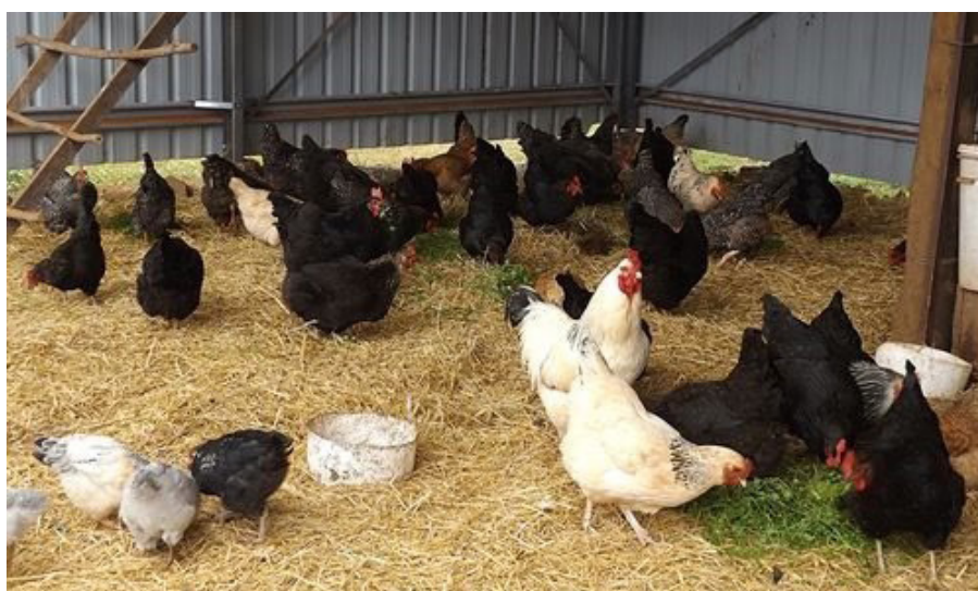
Fig 6.4: Poultry in a deep litter house