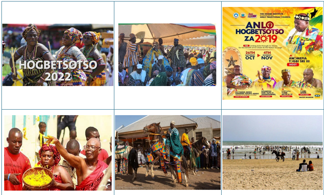
Fig. 9.1: Images of celebration and festivals