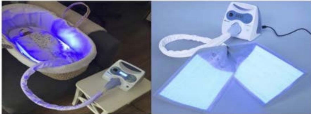
Fig. 6.17: Phototherapy (Light Therapy) Devices

It is now time to further explore therapeutic devices with some activities! Feel free to ask for support when needed.