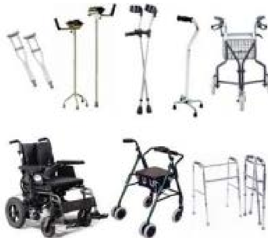
Fig. 6.16: Mobility aids