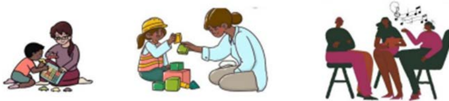
Fig. 6.4: Music and Art Therapy

This therapy uses creative activities like painting, drawing, and music-making to help clients express their emotions and inner experiences. These creative modalities provide a non-verbal outlet for self-expression and can promote self-awareness and emotional well-being.