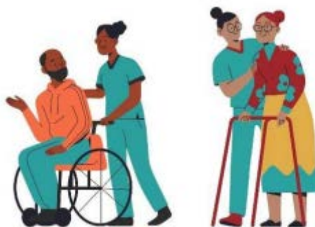
Fig. 6.5: Occupational Therapy

Occupational therapy helps individuals develop the skills and strategies needed to perform daily activities and live more independently. The goal is to enhance the client's ability to manage tasks and improve their overall quality of life.