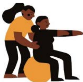
Fig. 6.6: Physical Therapy