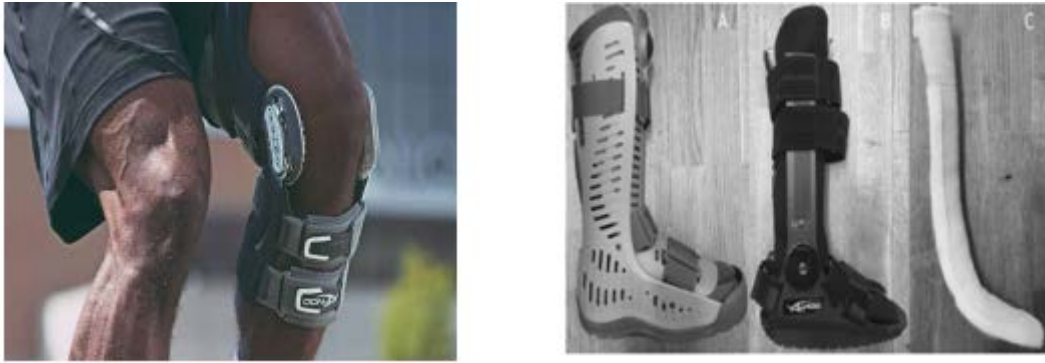
Fig. 6.15 (b): Examples of orthoses