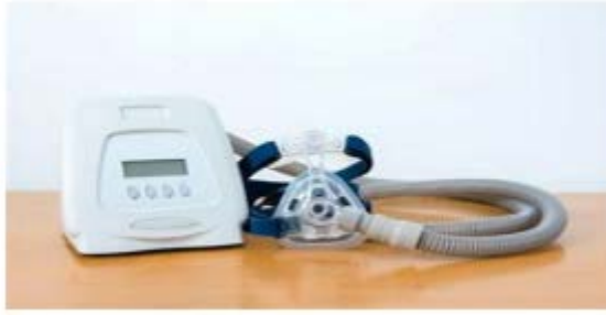
Fig. 6.9: Continuous Positive Airway Pressure (CPAP) Machine