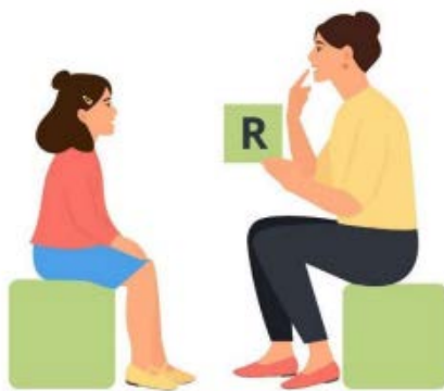
Fig. 6.7: Speech Therapy

Speech therapy focuses on addressing speech, language, and communication difficulties, as well as swallowing problems. Through specialized exercises and techniques, speech therapists work to improve clients' communication skills.