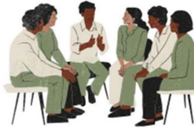
Fig.6.3: Group Therapy