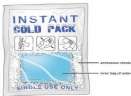
Fig. 6.11: Cold Pack (Ice Pack)