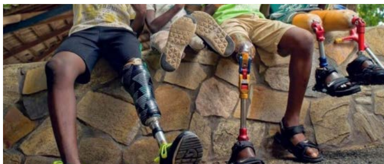
Fig. 6.15(a): Examples of prostheses (Legs for Africa, 2021)