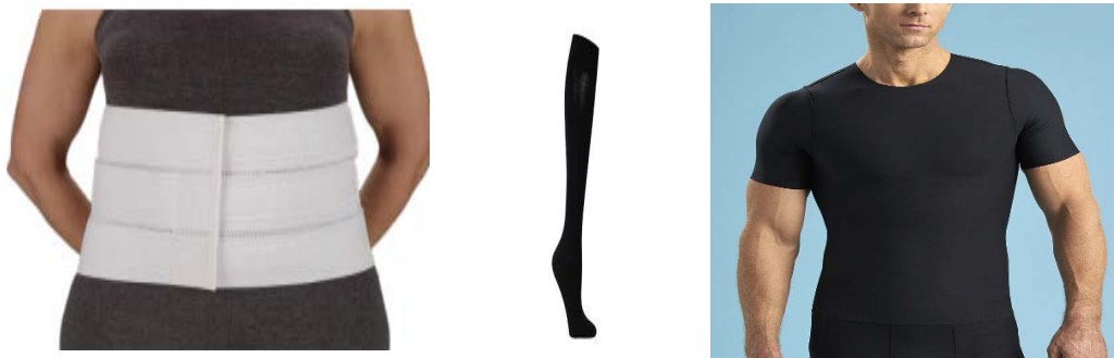
Fig. 6.13: Compression Garments

7. Cervical traction devices: are medical tools used in physical therapy to apply a gentle pulling or stretching force to the neck and upper back area. This is done to help relieve pressure and discomfort.