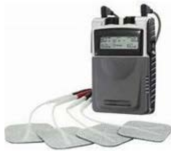
Fig. 6.8: Transcutaneous Electrical Nerve Stimulation (TENS) Unit

Function: provides electrical stimulation to nerves through the skin to alleviate pain, particularly for chronic or acute pain conditions, menstrual cramps or headaches.