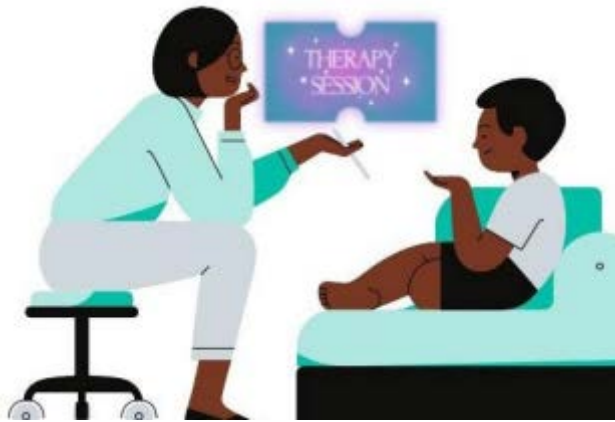
Fig. 6.1:Psychotherapy/Psychodynamic Therapy

how early life events can influence a person's current thoughts, feelings, and behaviours. By gaining insight into the roots of their issues, clients can develop healthier ways of coping.