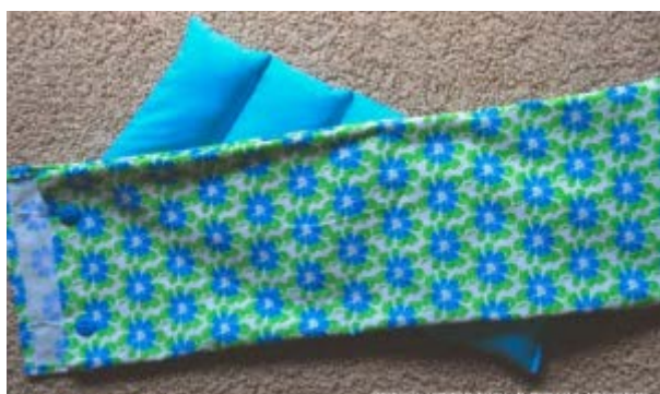
Fig. 6.12: Heating Pad