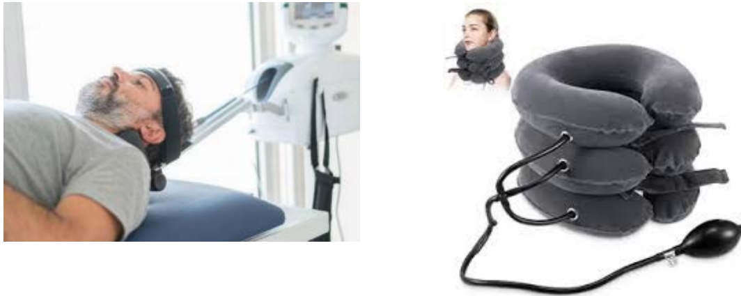
Fig. 6.14: Cervical Traction Devices