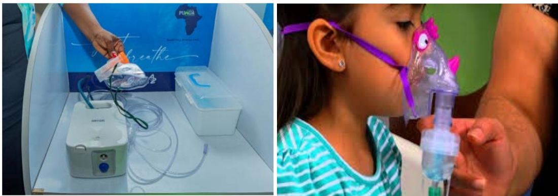
Fig. 6.10: Nebulizer

Function: It is beneficial for treatment and management of respiratory conditions like asthma, chronic obstructive pulmonary disease (COPD), cystic fibrosis and other diseases and disorders that affect breathing.