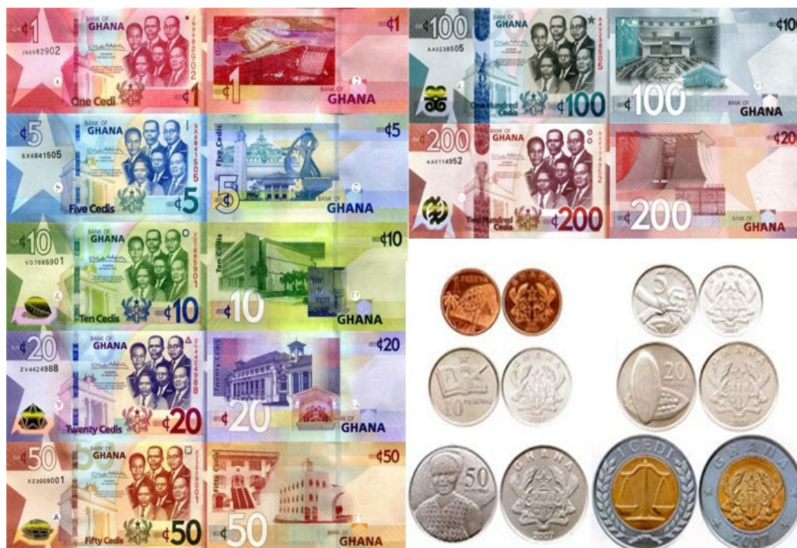
Figure 9.1 Some Ghanaian Currency – Notes and Coins

In this modern world, most countries use currencies as money in exchange for goods and services. In Ghana, the currency we use is in the form of banknotes, coins, credit and debit cards, and cheques. Barter still occurs in rural communities in Ghana where people do not earn wages or have little cash. One person might exchange vegetables they have grown for other goods.