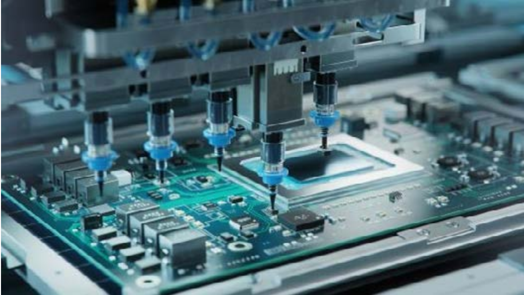
Fig. 7.3: A picture of the production of Printed Circuit Boards