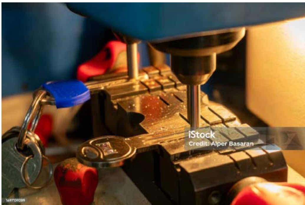
Fig. 7.4: A picture of Laser Cutter