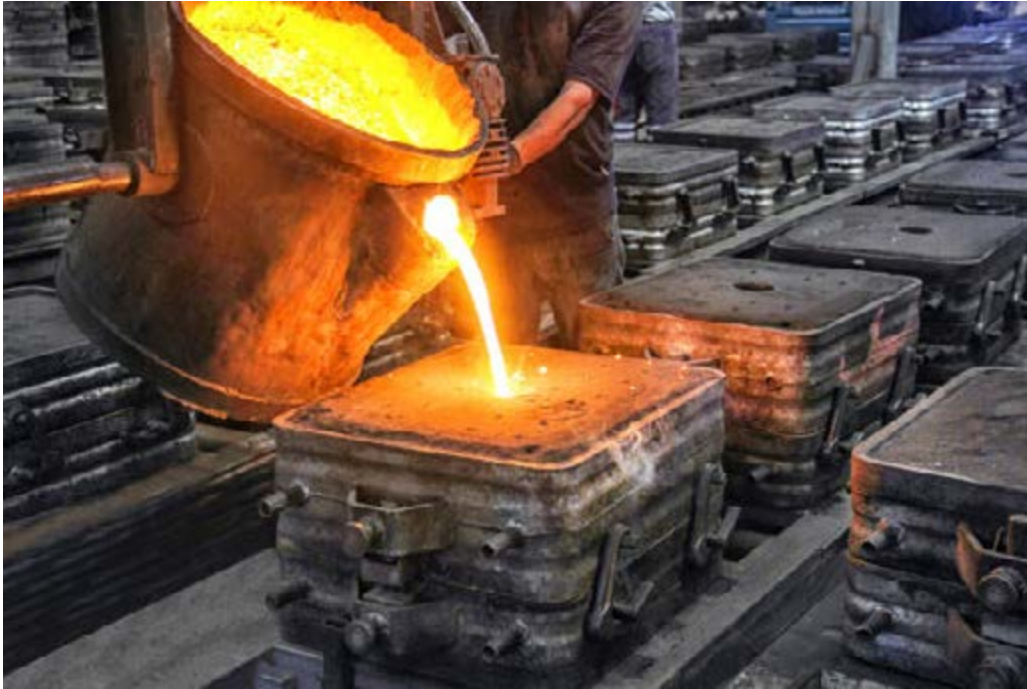
Fig. 7.2: A picture of Casting