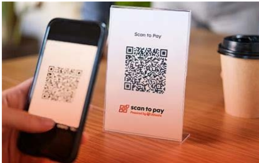
Fig. 9.10: A picture of an E-payment system