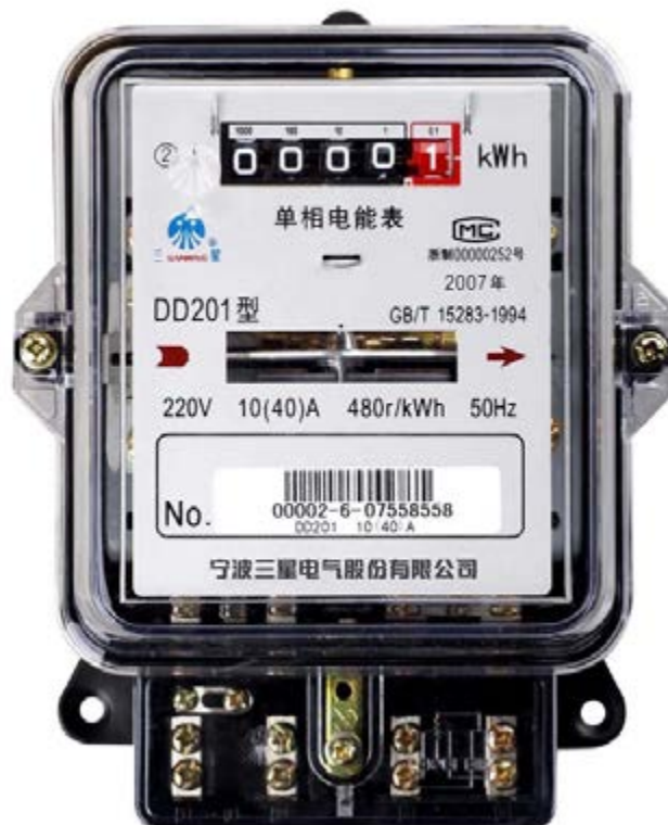
Fig. 9.6: A picture of an analogue electricity meter