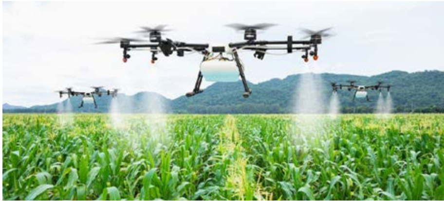
Fig. 9.16: A picture of an automated irrigation system