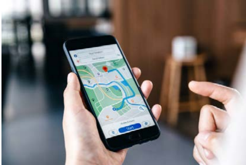
Fig. 9.15: A picture of GPS Navigation Software interface