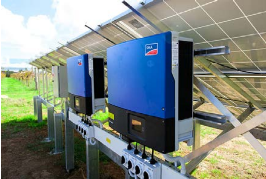
Fig. 9.4: A picture of a solar power inverter