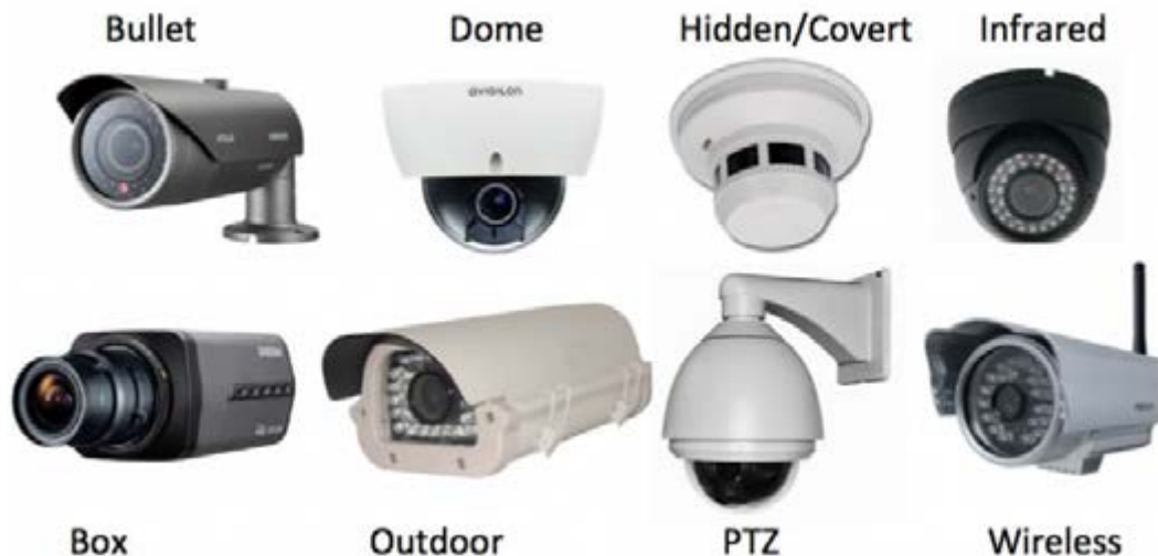
Fig. 9.5: A picture of Closed-Circuit Television (CCTV) cameras