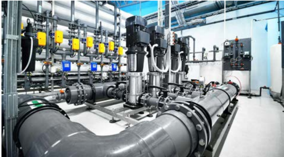
Fig. 9.3: A picture of Water pump control system