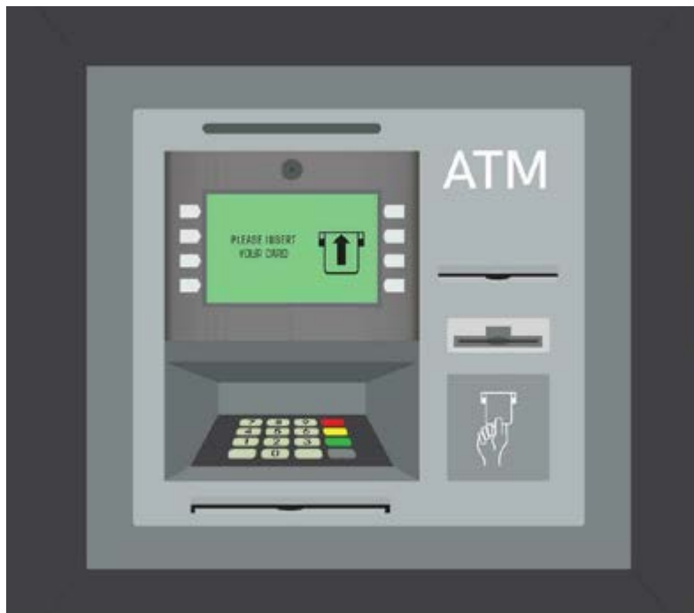
Fig. 9.2: A picture of an ATM machine