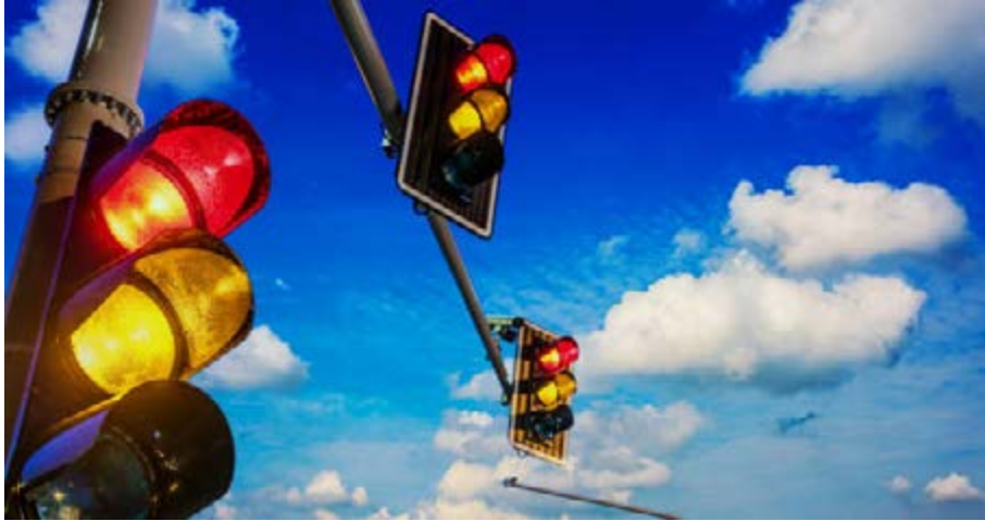
Fig. 9.1: A picture of Traffic light