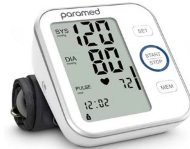
Fig. 9.9: A picture of blood pressure monitor