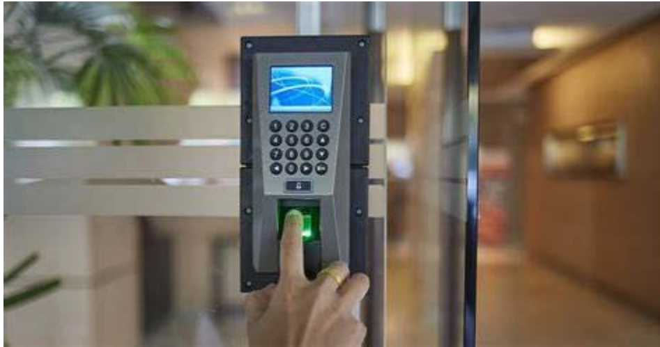
Fig. 9.14: A picture of Biometric Access Control System