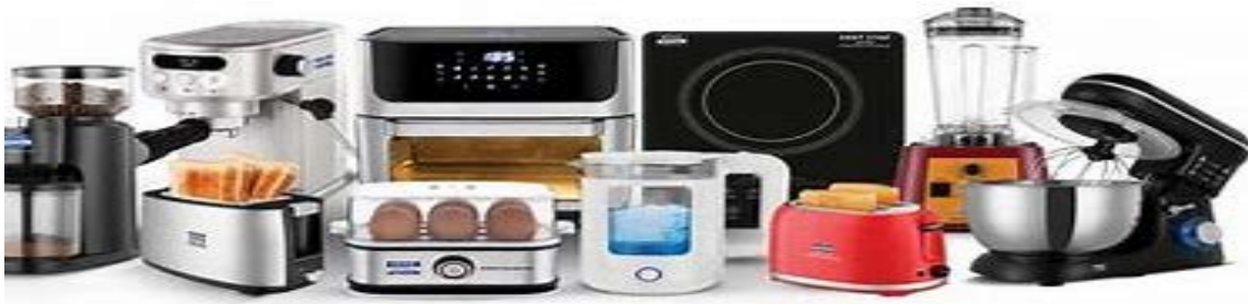
Fig. 9.13: Picture of Home Appliances with embedded system