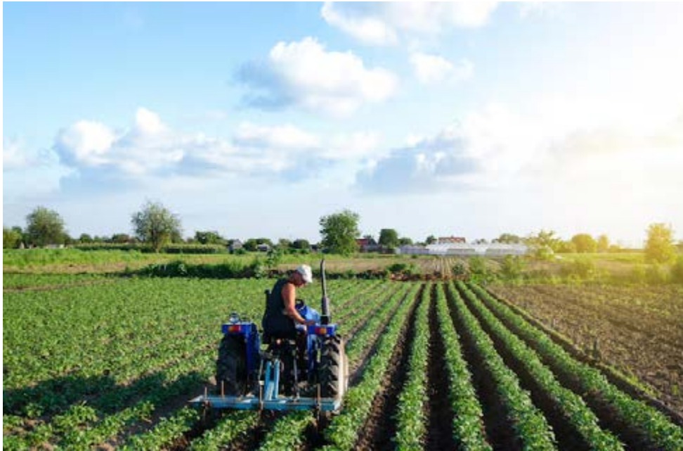
Fig. 9.8: A picture of a Tractor working on a farm