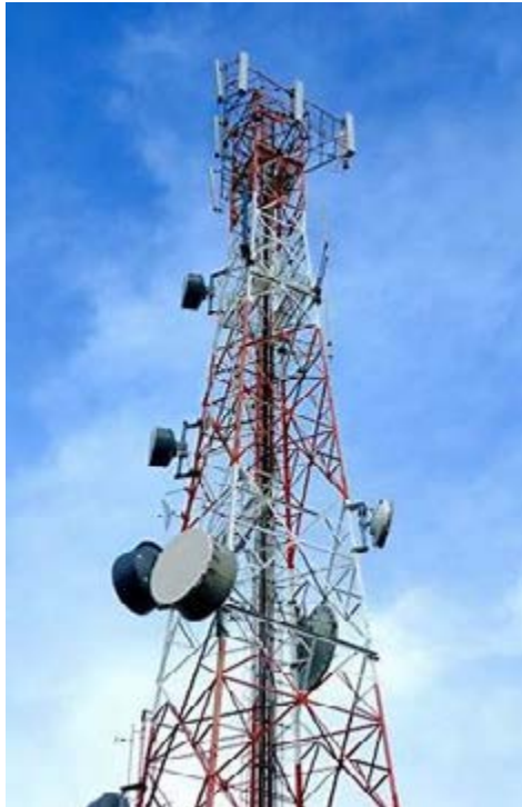
Fig. 9.7: A picture of Telecommunication tower