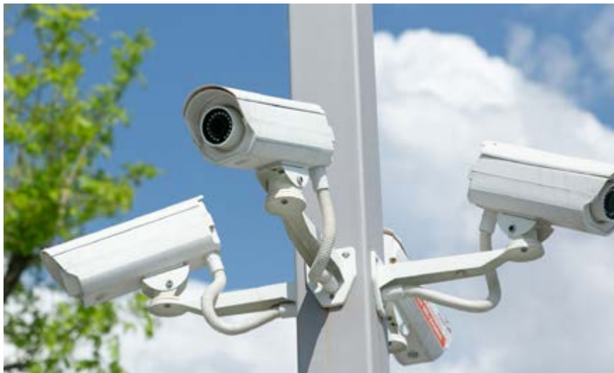
Fig. 9.12: A picture of Traffic Surveillance cameras