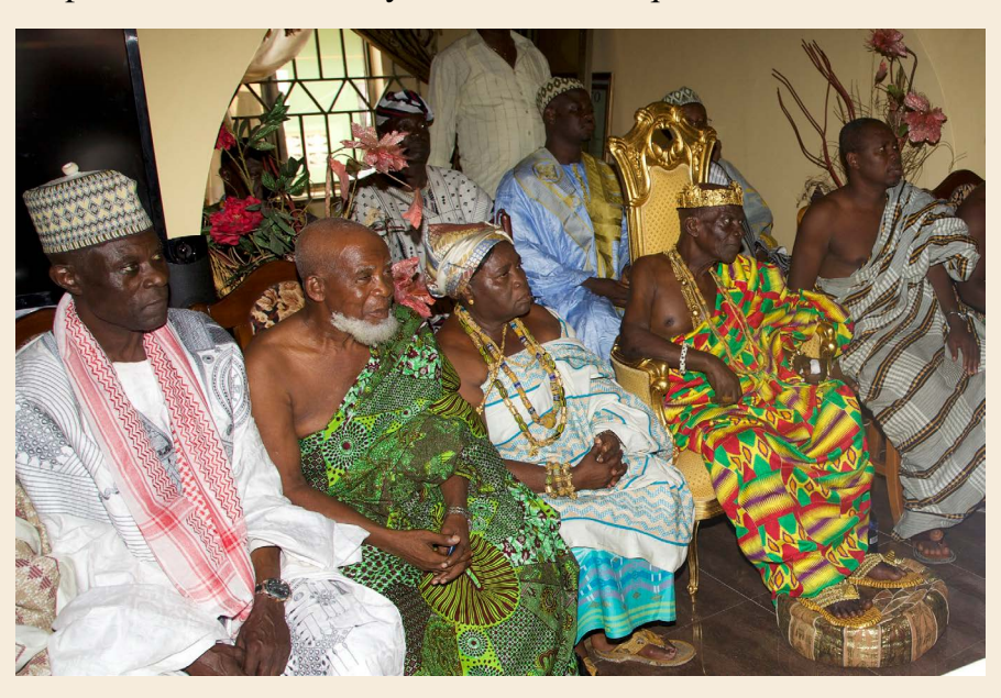
Fig. 7.2: Chief and elders in gathering

Observe the picture below carefully and answer the questions that follow: