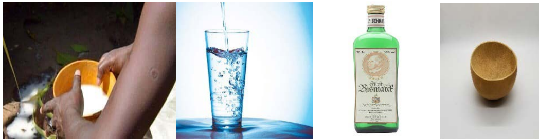
Fig. 8.3: Items used in performing libation

The items used differ from culture to culture but some include Calabash, water, wine, rice, palm wine or hard liquor and glass cups.