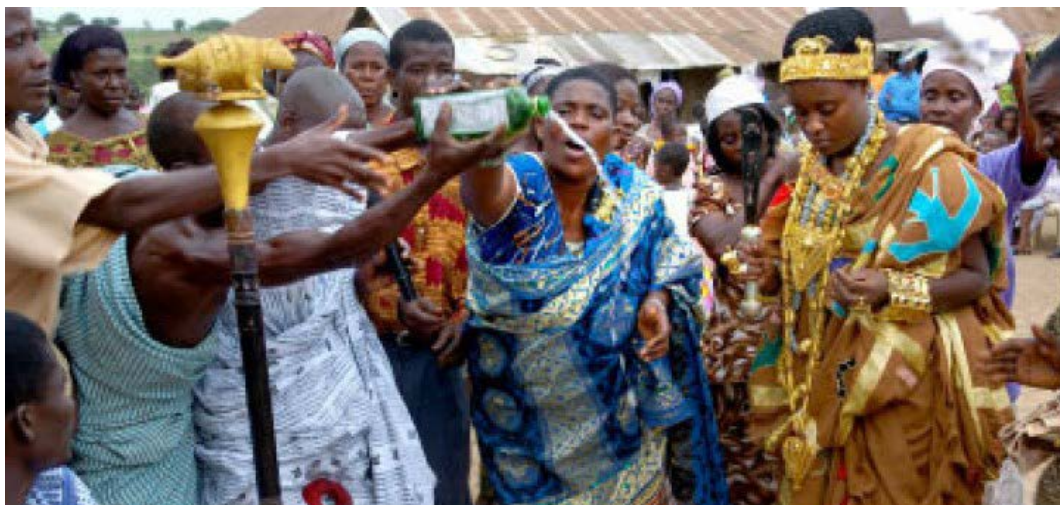
Fig. 8.2: The invocation