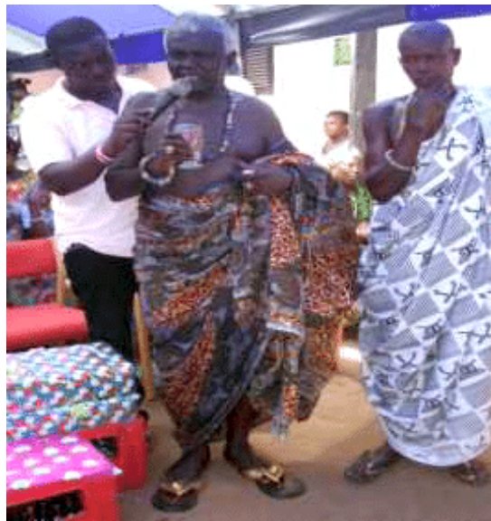
Fig. 8.1: The message in a libation

This part of the libation is meant to thank the ancestors or make a promise to offer something to the ancestors or gods after granting their request. The performers also ask the deities to throw curses at those who have any bad intentions for the occasion. The performer also asks for blessings from the deities to be bestowed on those doing good for society. In some situations, such as purification, a sacrifice is offered at this stage. The pictures below are examples of libation sessions among a particular group of people in Ghana.