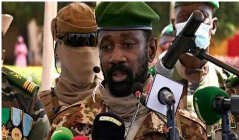
Fig. 5.4b: Image of a military leader of Burkina Faso