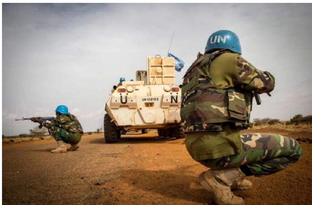
Fig. 5.10: UN Oct. 2017

Since the end of the Second World War in 1945, the United Nations has engaged in several peace operations such as peacekeeping, peacebuilding and enforcement to ease the effects of wars and civil conflicts around the world. The UN keeps peace around the world using military and police personnel from many member states, who wear blue helmets to show that they are representing the UN. The men and women from the UN disband groups and combatants involved in the conflicts and monitor peace agreements. Examples of the UN peacekeeping activities to restore stability include its observer Mission in El Salvador (1991), the Congo (1960-64), Bosnia and Herzegovina (1995), Lebanon (2000), and Sudan (2007).