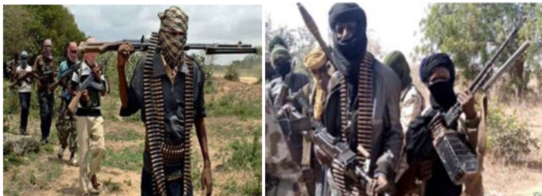
Fig. 5.5: Terrorist groups

The West Africa sub-region has the most porous border regimes in the world with the borderlands covering several ungoverned spaces where terrorist groups operate. This has created opportunities for militant groups such as Boko Haram, al-Qaeda in the Islamic Maghreb (AQIM) and Islamic State (ISIS) activities causing widespread insecurity and humanitarian crises.