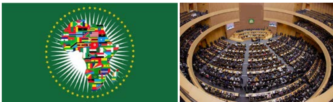
Fig. 5.6a: African Continent Flags Fig. 5.6b: Ordinary Session of the AU, Addis Ababa.

Headquartered in Addis Ababa, Ethiopia, the AU currently covers a population of over 1.3 billion. Today, the 54 African countries represent over a quarter of the United Nation's total of 193 member states. The founding treaty called the Constitutive Act of the African Union, provides for ten organs namely: the Assembly of Heads of State and Government (AHSO), the Executive Council, the Security and Peace Council, the Pan-African Parliament (PAP), the African Court of Justice and Human Rights, the Commission, the Permanent Representatives Committee, the Specialised Technical Committees (STCs), the Economic, Social and Cultural Council (ECOSOCC), and the Financial Institutions.