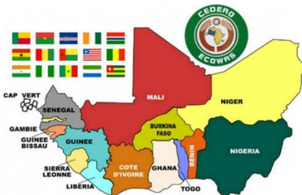
Fig. 5.3: ECOWAS member states

NB: Mauritania, a signatory to the Treaty of Lagos withdrew its membership of ECOWAS in 2002