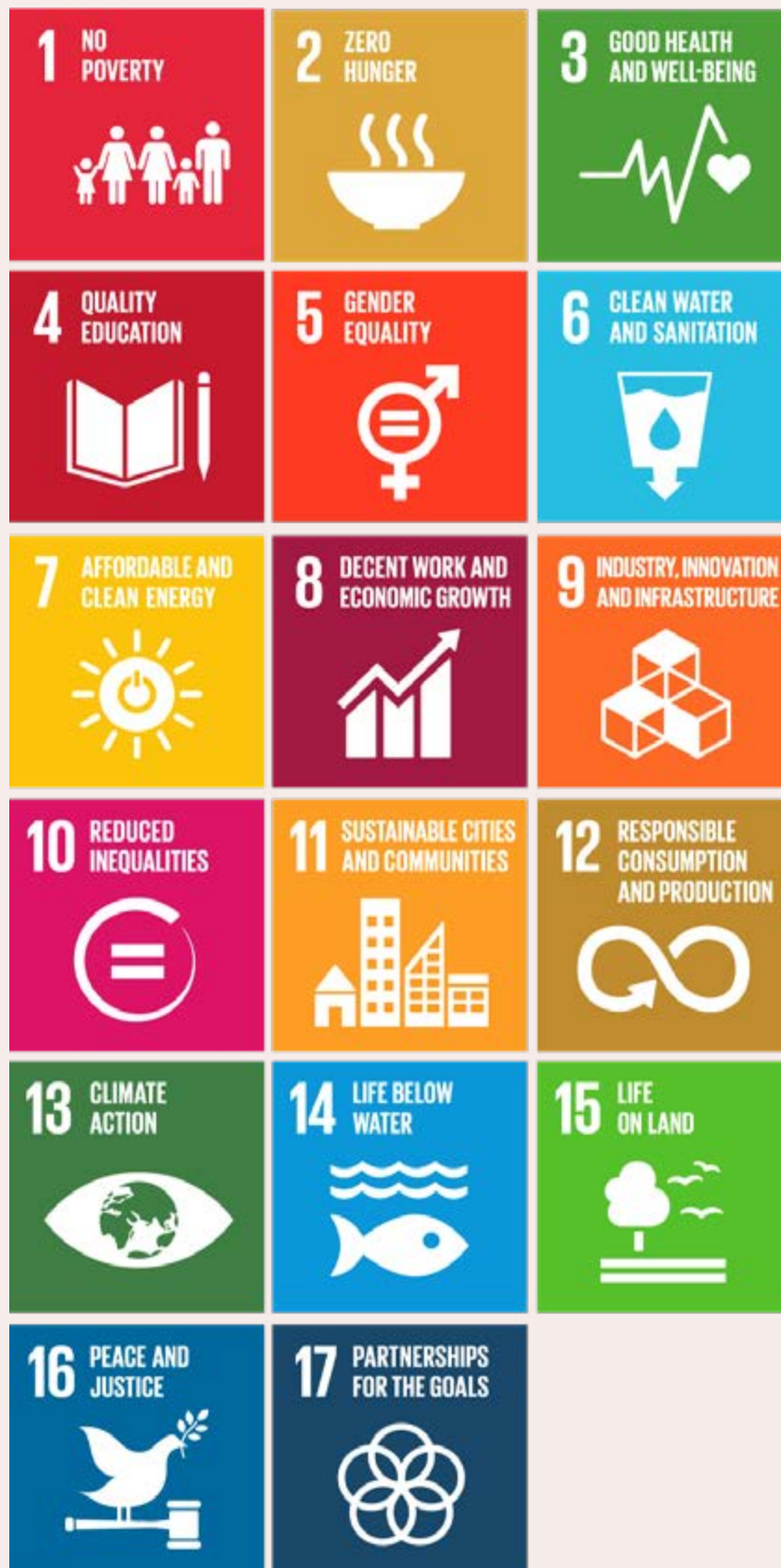
Fig. 5.10: Logos of the SDGs

The most important SDG goal to me is ...and why?