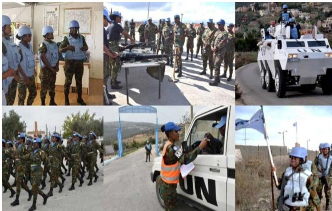
Fig. 5.11: Images of the UN peacekeeping mission