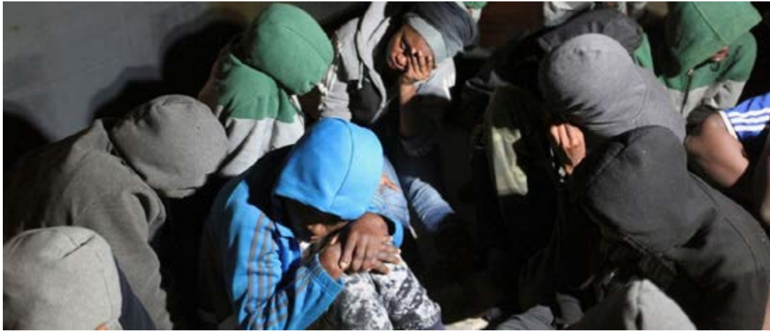
Fig. 5.7: An image of trafficked people