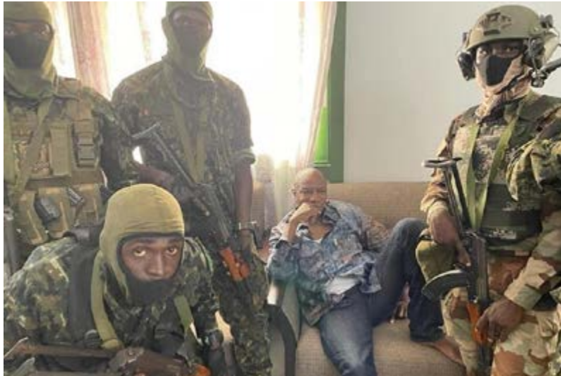
Fig. 5.4a: Image of a detained president (Guinea)