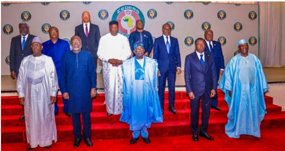
Fig. 5.1: ECOWAS heads of state

State actors are individuals and institutions that act on behalf of states/countries. State actors set objectives which seek to address the challenges and protect the well-being of current and future generations. State actors usually derive authority from constitutional sources or other legal sources. Examples are the executive (President, Foreign Minister), the legislature, intelligence/security agencies/the civil bureaucracy.