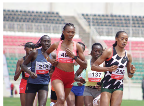
Fig. 6.5: 3,000m race