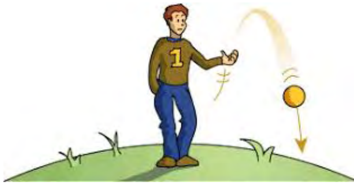
Fig. 6.2: Ball throwing

Observe the image in Figure 6.2 and consider the forces acting on the ball as it moves through the sky.