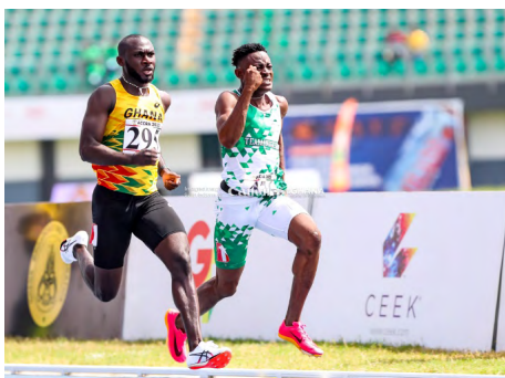
Fig. 6.4: 100m race

In the next discussion, observe the images in Figures 6.4 and 6.5 .