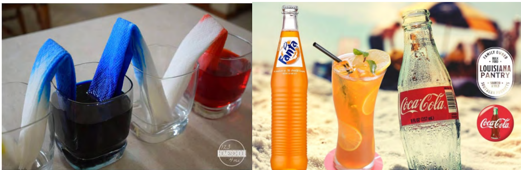
Fig. 6.6: Capillary action

Compare your activity with the image in Figure 6.6