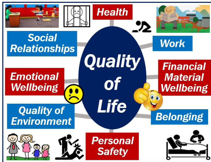
Fig. 10.6: A picture showing some components of quality life.

or even taking vacations. Financial literacy empowers individuals to use their money in ways that improve their overall well-being.