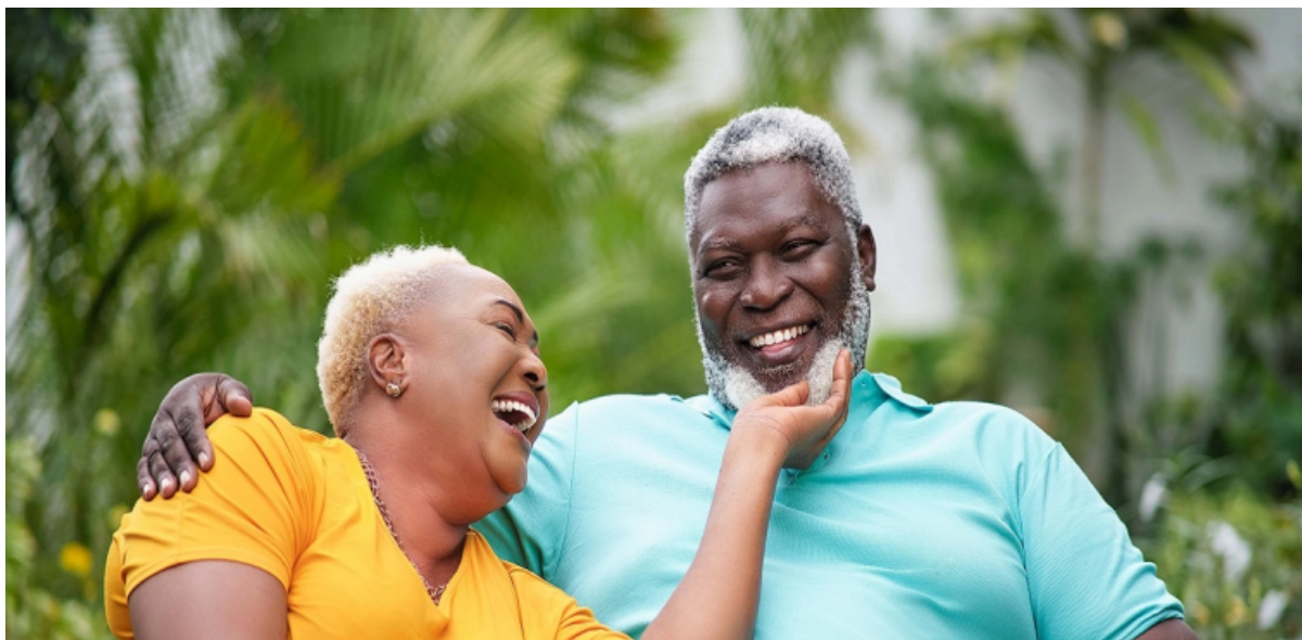
Fig. 10.24: Couple enjoying their retirement as a result of proper financial planning.