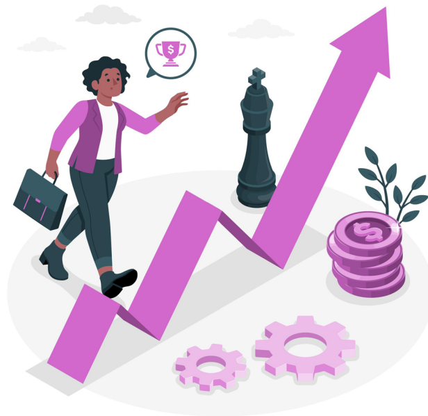
Fig. 10.5: Picture of financial goal