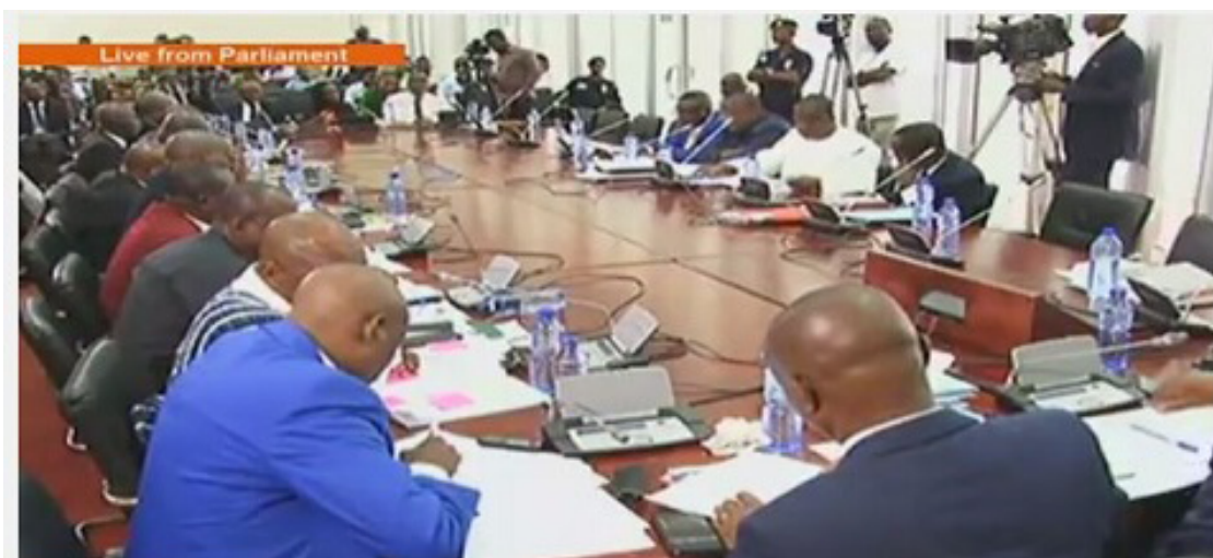
Fig. 10.23: The Public Accounts Committee of Parliament holds some state institutions accountable

The state ensures that there are systems in place to check and report public spending. Audits, transparency laws, and public accountability instruments help prevent misuse of funds. Transparency builds public trust and ensures that funds are spent as planned, reducing the risks of corruption and waste.