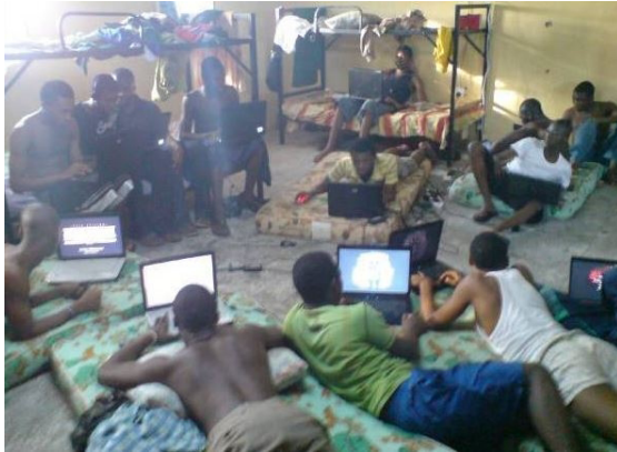
Fig. 10.3: Financial scammers operating

Financial literacy involves identifying and avoiding scams, frauds, or risky financial schemes that promise quick money but often lead to losses in the financial market. A case in question is recognizing a scam or fraud when a person comes to you with a high-return investment opportunity which has no risks.