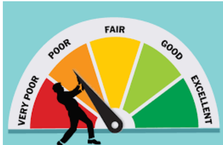
Fig. 10.12: Credit score rating