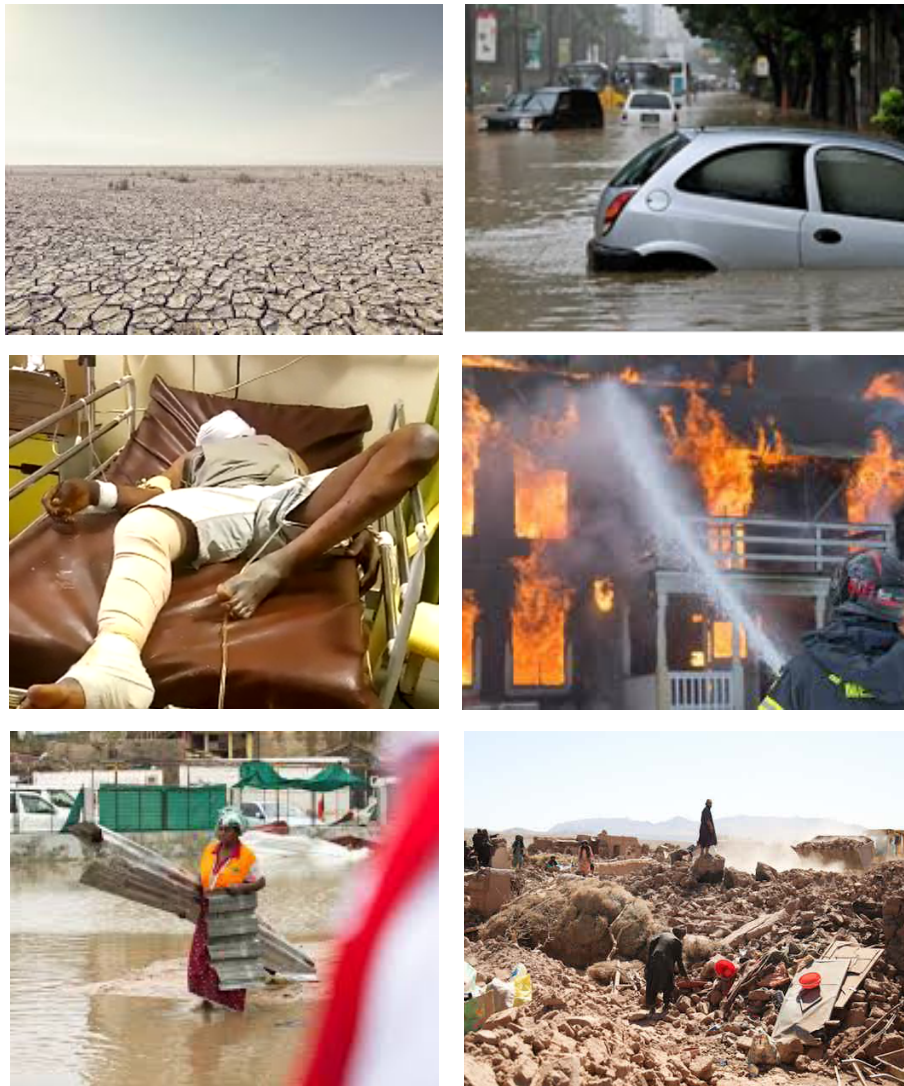
Fig. 10.5: Pictures of disasters that can happen to you and your family

Learning about saving and being ready for unexpected expenses can help people handle tough times, like losing a job or facing a big or unexpected bill. Regularly setting aside money in an emergency fund can provide a financial cushion during uncertain times.