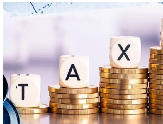
Figure 15b A picture showing how taxes grow into income