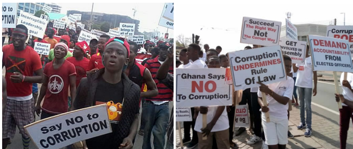
Fig. 10.16: Anti-corruption demonstrators