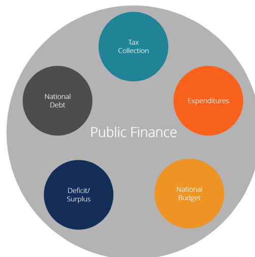
Fig. 10.14: A picture showing public Finance.

It is all about how governments handle money to keep everything running smoothly and to make sure that there is enough money for both current needs and the future as well.