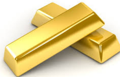
Fig. 10.2: A picture showing investing choices