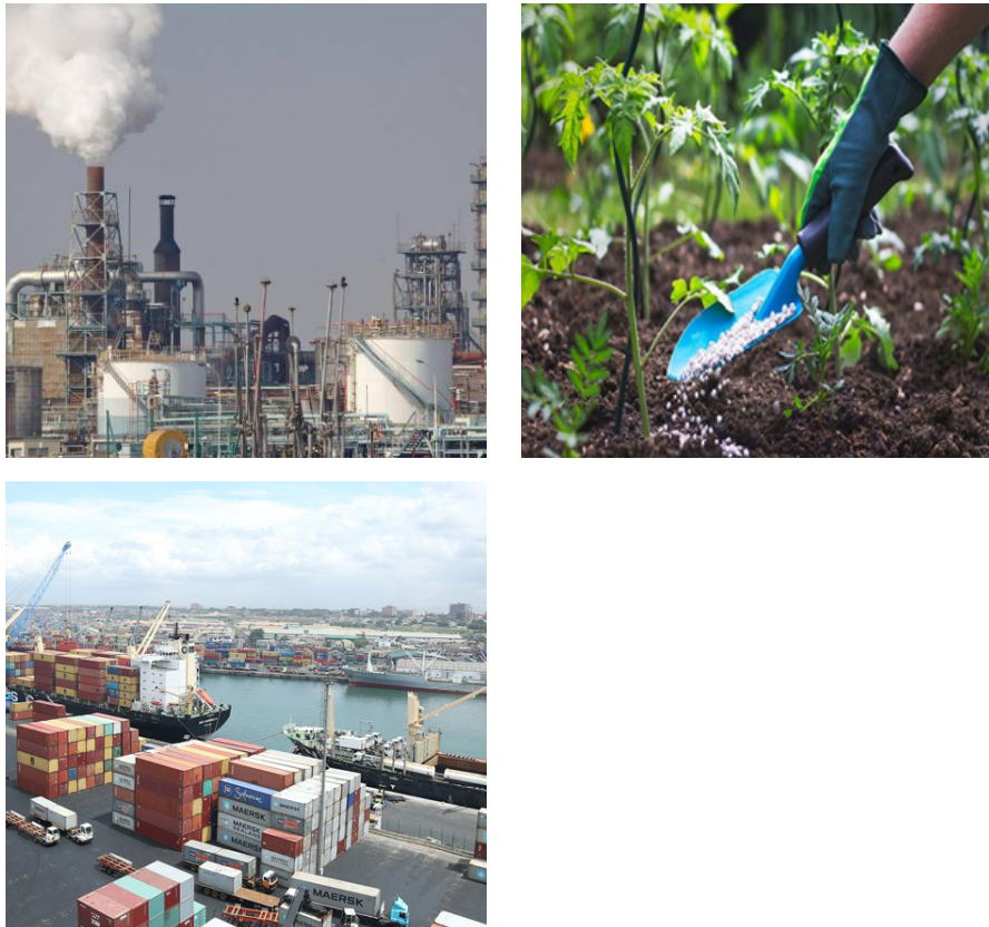
Fig. 10.7: A picture of Economic Diversification