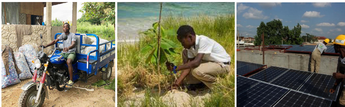
Fig. 10.18: Individuals protecting the environment