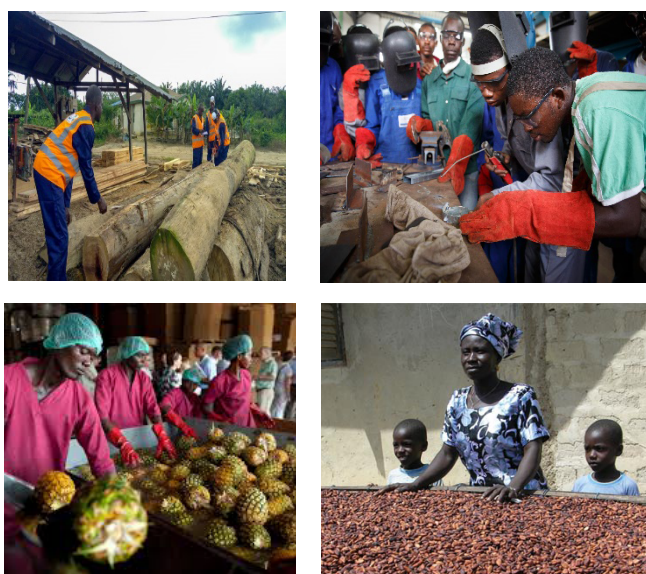
Fig. 10.22: Local community-led building projects

Communities that support local businesses and create a culture of entrepreneurship contribute to a stronger local economy, leading to higher tax revenues and more financial stability for local governments. A strong local economy can increase public revenues, which can be invested in public services and infrastructure.