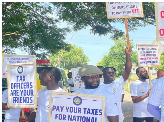
Fig. 10.15a: A group of people promoting honest tax payments.

Paying the correct amount of taxes on time ensures that the government has the resources to fund public services like healthcare, education, and infrastructure. Honest tax payments reduce the need for borrowing or increasing taxes which promotes financial stability in the country.