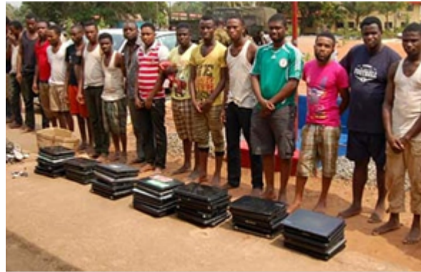
Fig. 10.4: Apprehended financial scammers