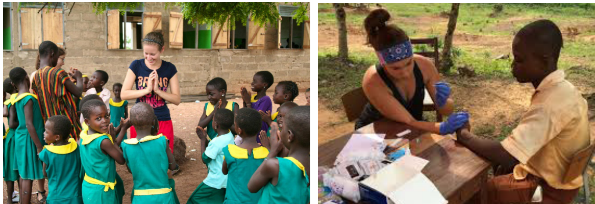
Fig. 10.21: Foreign volunteers teaching and assisting in education and health sectors in Ghana.

Communities can volunteer or donate to social programs that serve the public, such as food banks, educational programs, or public health initiatives. Volunteering reduces the burden on public funds while enhancing social services, ensuring that limited public resources can be directed to areas of higher need.