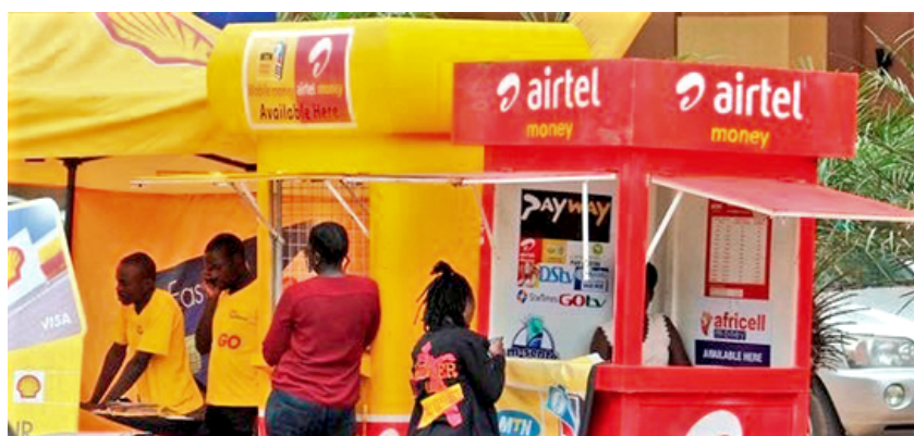
Fig. 10.9: Mobile money operatives doing business online.

Digital financial services like online sales have become the order of the day. With the increasing reliance on digital financial services like mobile money, protecting against cyber threats is vital. Strengthening cybersecurity can prevent disturbances and maintain trust in the financial system leading to financial security.