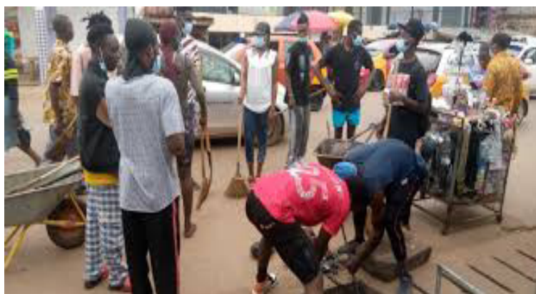
Fig. 10.17: Individuals taking part in a cleaning exercise

Volunteering or taking part in local initiatives like communal labour reduces the need for public spending on community services. Individuals can help build stronger communities with fewer resources by contributing time and effort and reducing the cost of projects for the state to save money for another project.