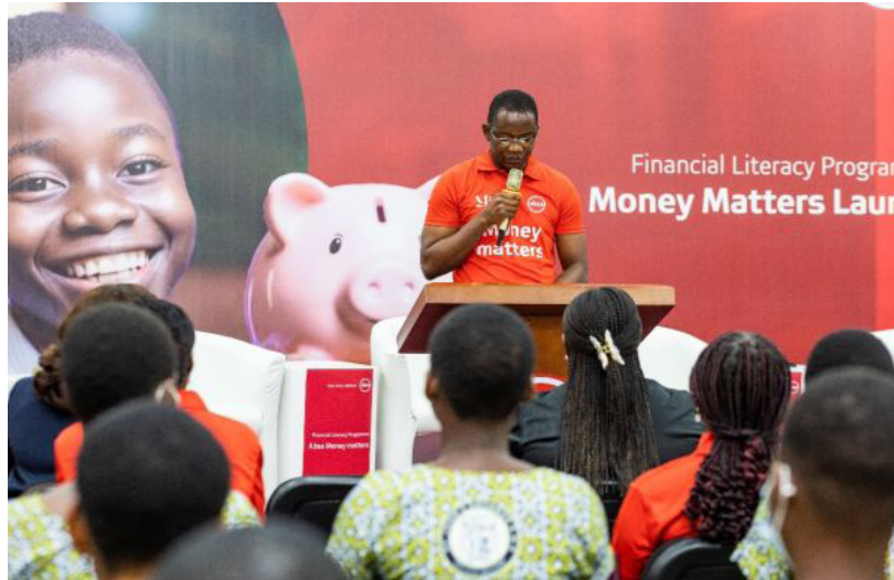
Fig. 10.1: Some students and teachers attending a financial literacy programme.

With this knowledge, you can manage your money well, handle difficult financial problems, understand different financial products and services, and make good decisions that match your financial goals.