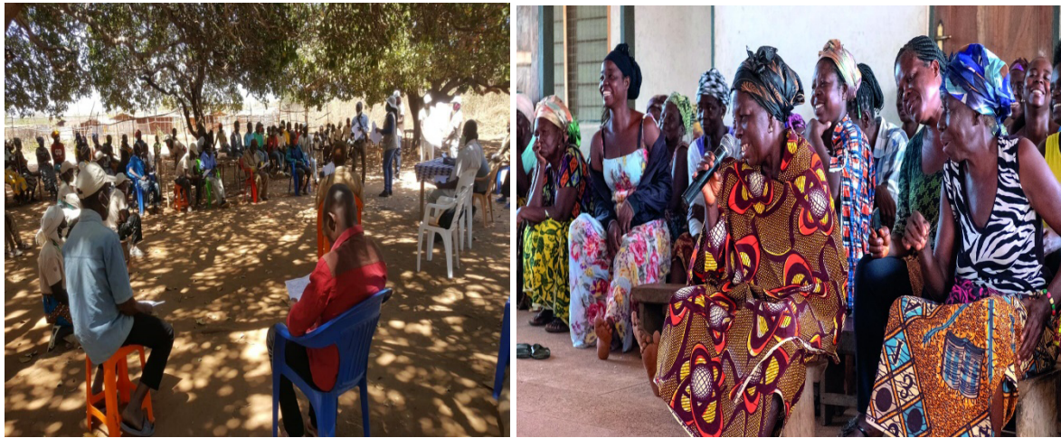
Fig. 10.19: A gathering of community members in a meeting to make a decision.

risk of corruption and wasteful spending which ensures that funds are allocated to vital services.