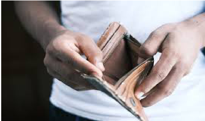
Fig. 10.11: A picture of a person showing an empty wallet.