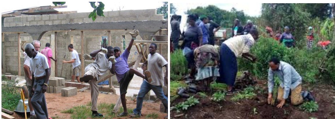
Fig. 10.20: Community members working to support community projects.

Communities can support the country on local projects like building schools, parks, or community centres through fundraising or volunteering. By taking on some of the costs and responsibilities, communities help reduce the strain on public budgets while improving local infrastructure.