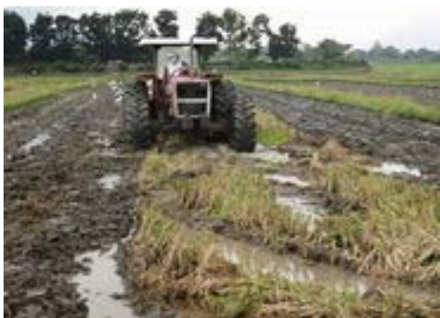
Land clearing by a tractor