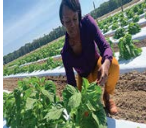
A farmer managing her vegetable crops