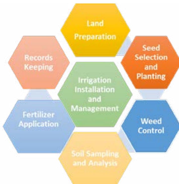
Fig. 3.4: Hands-on farm practical skills to acquire when performing practical farm activity in crop production.