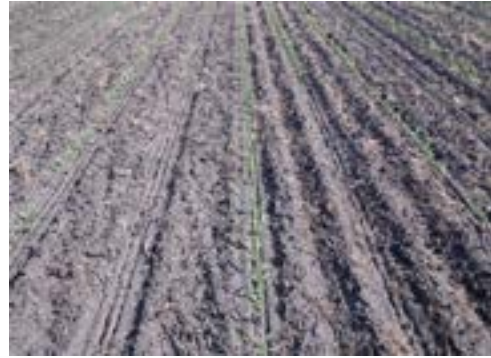
Seedlings planted in drills