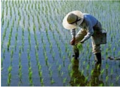
A farmer transplanting seedlings