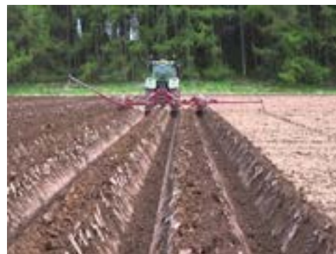
construction of beds