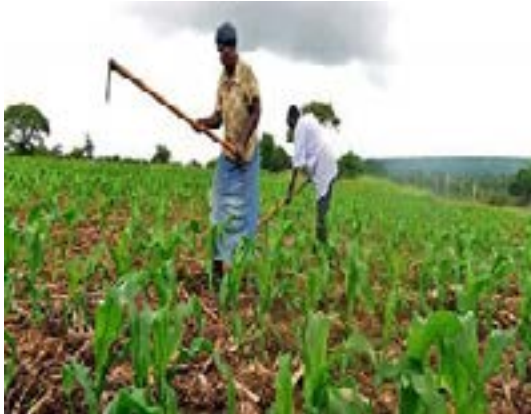
Farmers controlling weeds manually using hoe