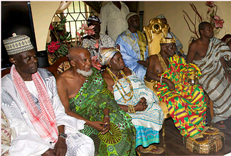
Mfonini. 7.2. Ohene ne ne mpanyimfo a wɔahyam.

Hwe mfonini a ewo ase ho no yie na gyina so bua nsemmissa a edidi so no nyinaa: