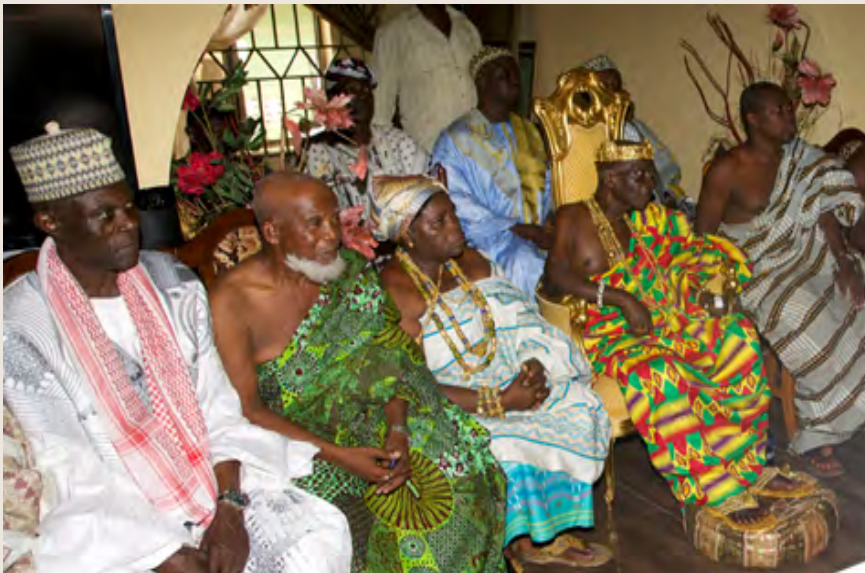
Mfoɔni. 7.2. Ohene ne ne mpanimfoɔ a wɔahyia mu

Hwe mfoɔni a ewo aseɛ ho no yie na gyina so bua nsemmissa a edidi soɔ no nyinaa: