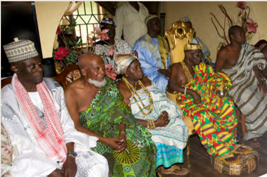
MfoƆi. 7.2. Ohene ne ne mpanimfoƆ a wahaƆia mu

Hwe mfoƆi a ewo asee ho no yie na gyina so bua nsemmisa a edidi soƆ no nyinaa: