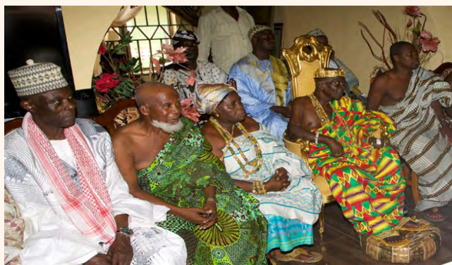
Fig. 7.2: Maŋtse ke enukpai anaa ekpe shi.

Kwemɔ mfoniri ni baa nɛe jogbaŋj koni oha sanebimɔi ni nyie sɛɛ le ahetoo.