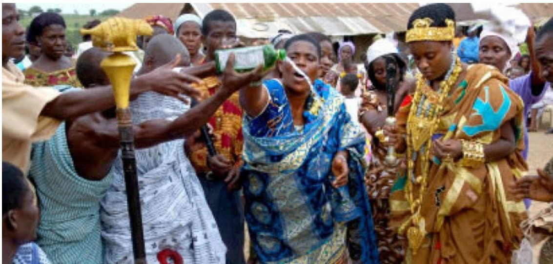
Fig. 8.2: Kasotofuti, amfoni be elarkpa: https://www.artwatchghana.org/libation-art-in-art-of-ghana-linking-the-unlinked/