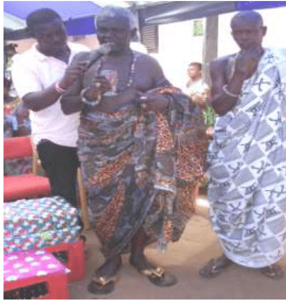
Fig. 8.1: Kachutoo be kebɔya, amfoni be elarkpa: https://www.researchgate.net/figure/Picture-showing-the-head-of-the-brides-family-pouring-libation_fig1_334479271