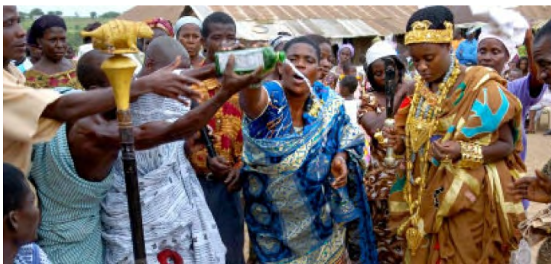
Fig. 8.2: The invocation.