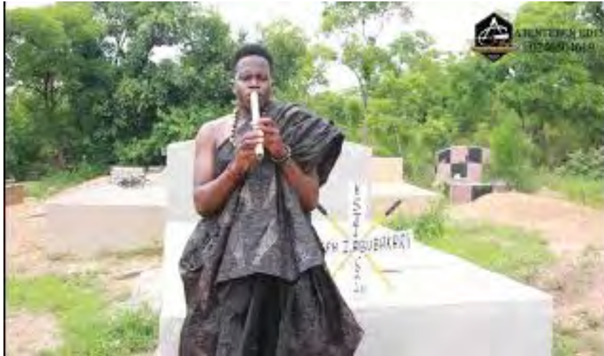
Fig. 8.4: Kubaŋa sakers : Source: Atenteben (2023)