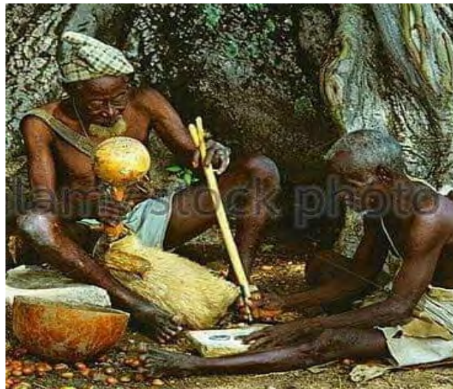
Fig. 8.1: The message in a libation.

Koka'are la puan, kalam de la zi'an ti fu nyaa ni pu'usera yaabeduma la bii biŋera nuure ti ba san maale fu yele la fu wan bo ba sela. Mina n ka'ari ko'om la me ni kelum zusera yaabeduma la ti ba base ti ka'be'o pae mina daana n base ti wuŋere la paara ba la. Mina n ka'ari ko'om la ni kelum zusera yaabeduma la ti ba base ti sum pae seba n boti tiŋa la maalego la. Yela asi'a puan me magese wuu yelebe'ero duusego puan, ba nyaa ni ka'e ko'om la la kalam. Fɔɔra la n boi tilum wa pa'ali la baseba ko'om ka'are n doli se'em n bala Gaana tiŋa wa puan.