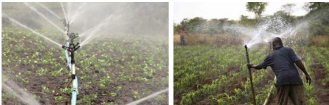
Fig. 2.26: Sprinkler