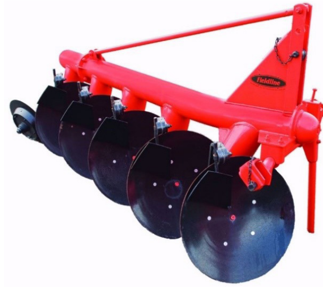
Fig. 2.22: Disc plough