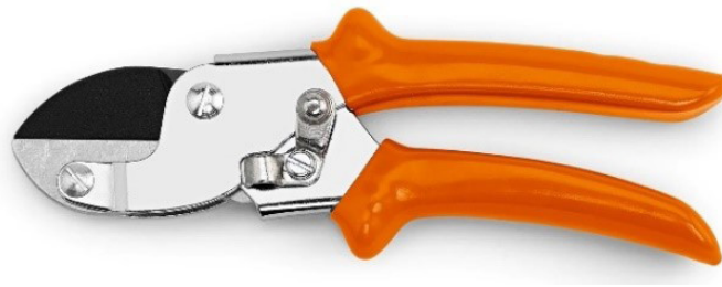
Fig. 2.15: Secateurs