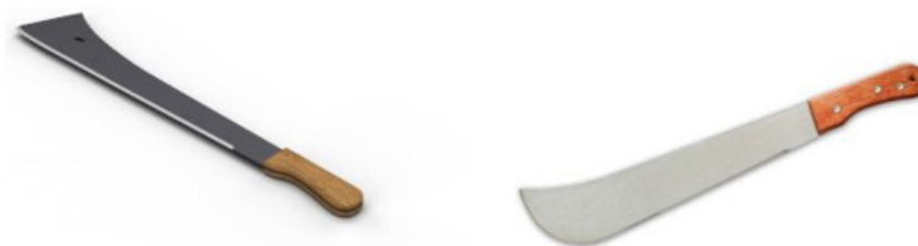
Fig. 2.5: Diagram of machetes/bolos