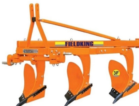
Fig. 2.22: Mould-board plough