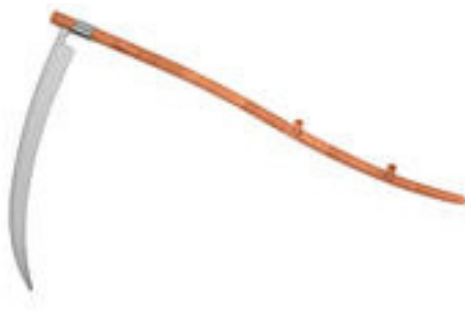
Fig. 2.8: Picture of a scythe