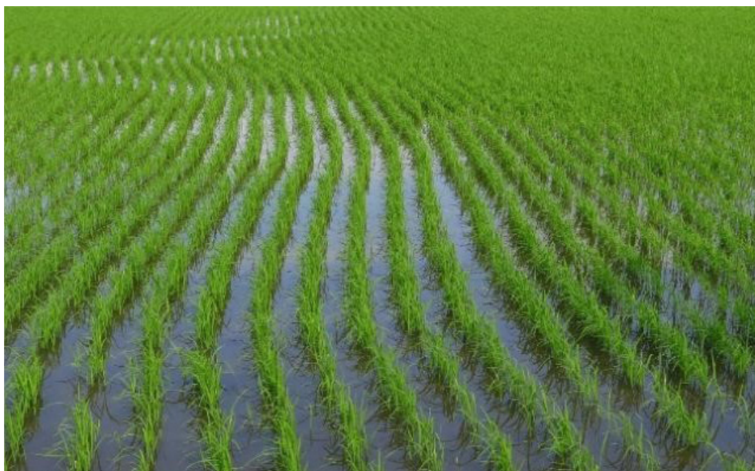
Fig 4.2: A picture showing check basin irrigation