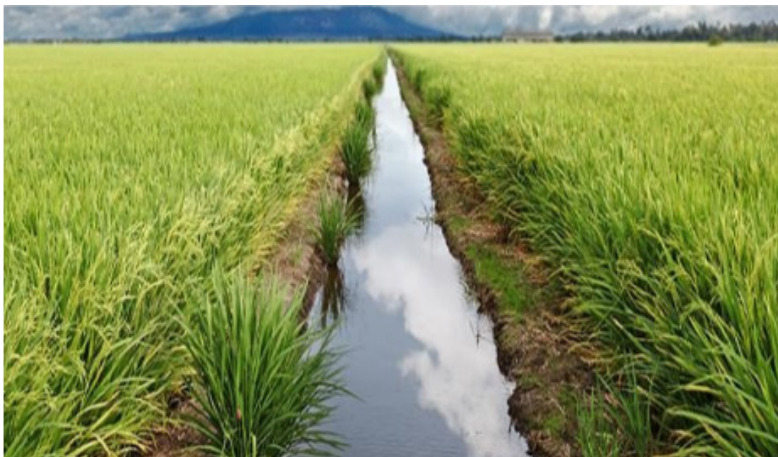
Fig 4.1: Picture of border irrigation on a rice farm