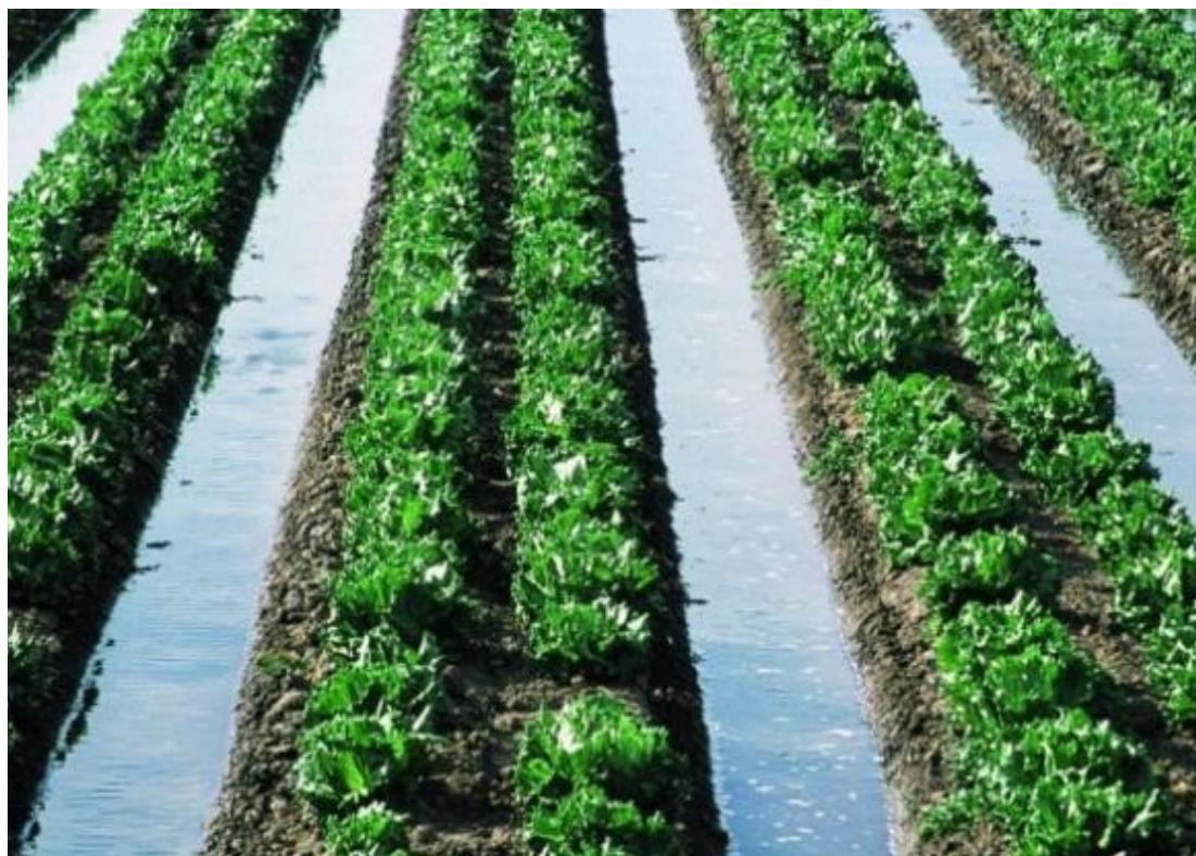
Fig 4.3: A picture showing furrow irrigation.

used and soil type. Water is applied by small running streams in furrows between the crop rows. Water infiltrates into soil and spreads laterally to wet the area between the furrows. In heavy soils, furrows can be used to dispose of the excess water.