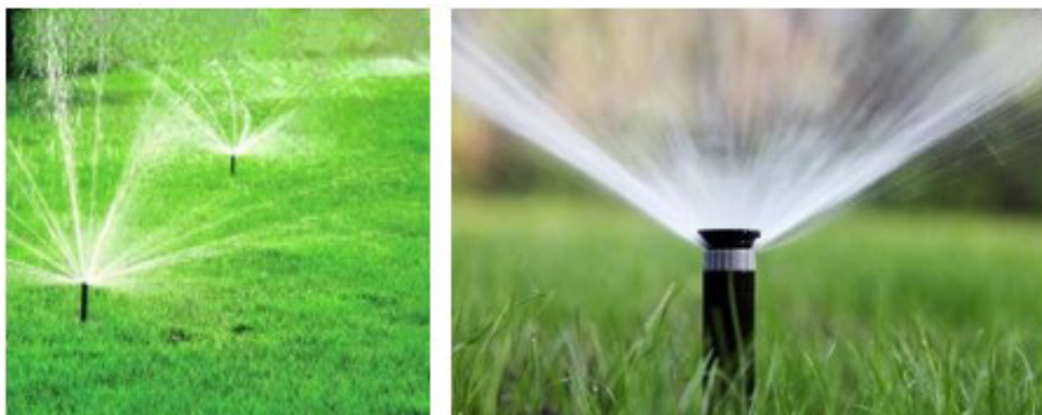
Fig 4.5: Types of sprinkler irrigation systems

less than the infiltration rate of the soil hence, the runoff from irrigation is avoided.