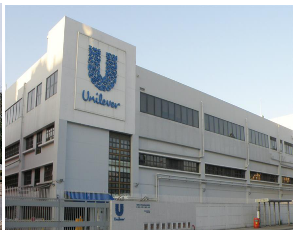
Fig. 4.4: Total Energies, Ghana Office in Accra