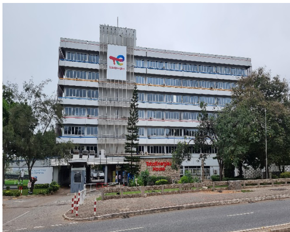
Fig. 4.3: Unilever, Ghana PLC Office in Accra