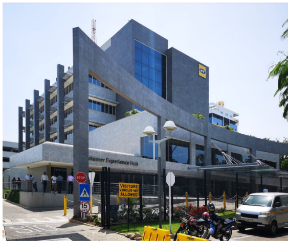
Fig. 4.1: MTN PLC Office in Accra

Below are pictures of the offices of some Multinational Corporations operating in Ghana: