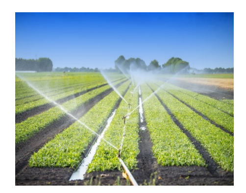
Fig. 3.5a. Modern irrigation system

Irrigation played a significant role in the lives of ancient African societies, especially in the Sahel Regions. In ancient Egypt, Egyptians constructed canals, dikes, and reservoirs to control the rivers flow to distribute water to agricultural fields during both flood and drought seasons. In the Sahel regions, indigenous people developed innovative irrigation techniques to support agriculture in a semi-arid environment.