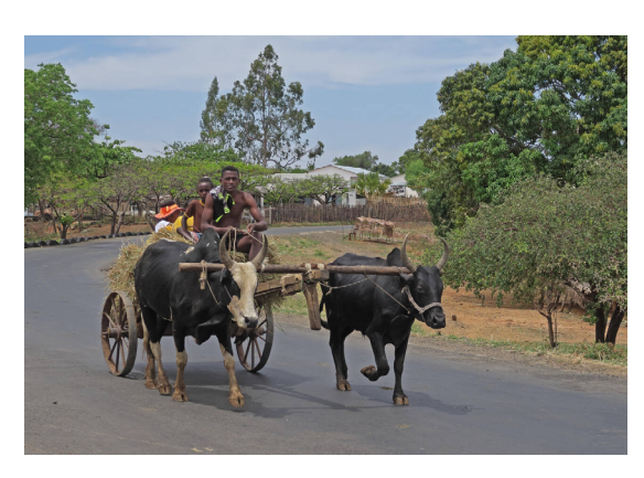
Fig. 3.4a Picture of Bullocks pulling a load