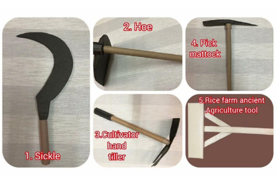
Figure 3.2: Pictures of ancient metal tools