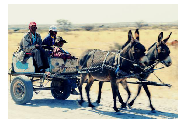
Fig 3.4b Picture of Donkeys transporting people