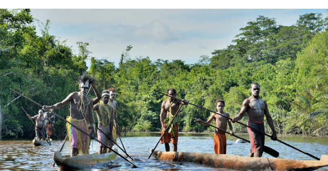
Fig. 3.3: Indigenous technologies our ancestors used to travel on water