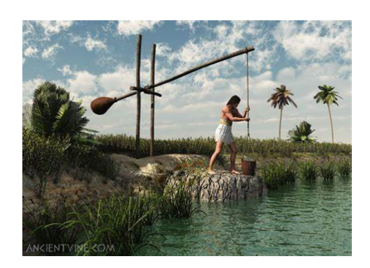
Fig. 3.5b Ancient irrigation system