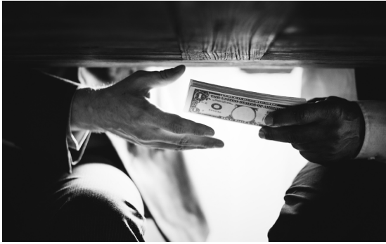
Fig. 4.1: Pictures of unethical behaviours.