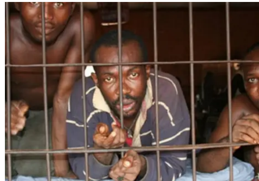
Fig. 4.2: A picture of showing both female and male prisoners