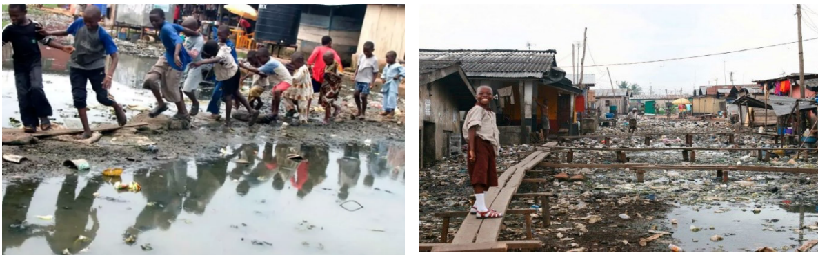
Fig. 4.6: Some children in a filthy environment.

When unethical behaviour is common, it can lead to a poor quality of life. This is because, services may be unreliable, public systems may fail, and there can be a general sense of hopelessness and unhappiness among the people.