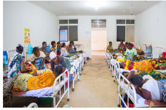
Fig. 4.5: Poor healthcare delivery in Ghana due to unethical behaviour