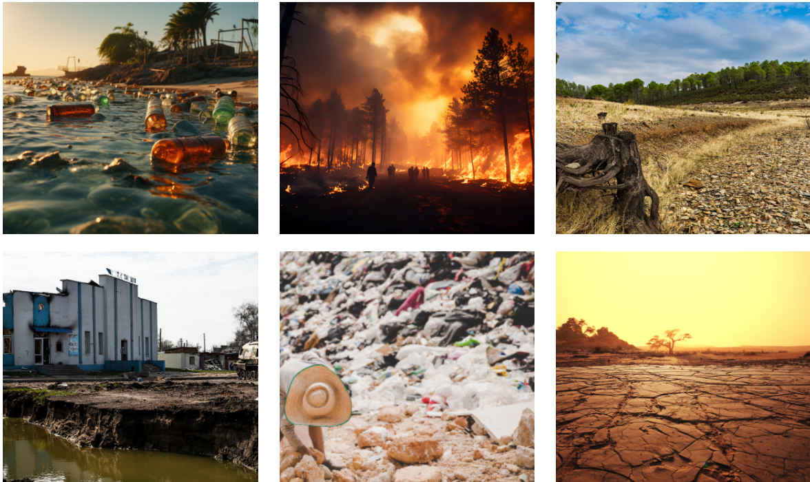
Fig. 4.4: Human activities that destroy the natural environment.

Unethical practices, such as illegal logging, illegal mining (galamsey), and industrial pollution, directly degrade natural environments. Companies or individuals who are interested in profit more than protecting the environment may engage in activities that lead to deforestation, soil erosion, water contamination, and air pollution. This degradation can lead to the loss of biodiversity, the destruction of habitats, and loss of human lives.