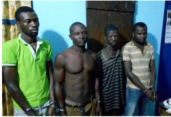
Fig. 4.3: A picture of suspected armed robbers in handcuffs